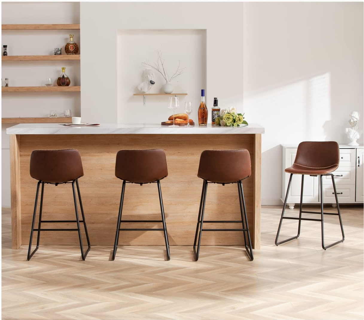
Image: HeuGah T-5100 Bar Stools in a kitchen environment.