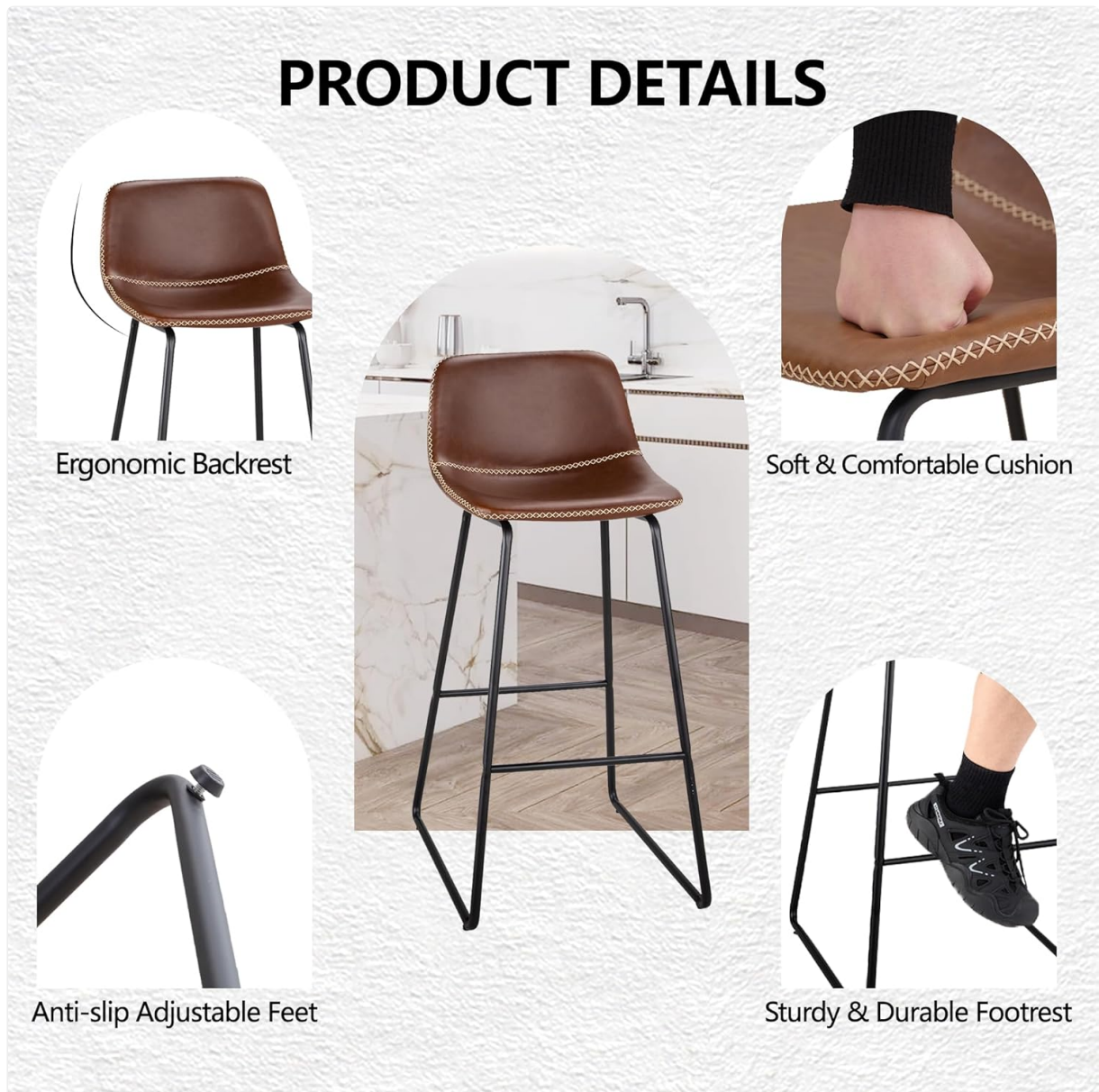
Image: Detailed view of bar stool components, highlighting the ergonomic backrest, comfortable cushion, adjustable feet, and sturdy footrest. These elements are integrated during assembly.