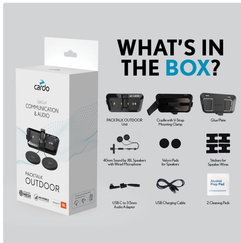
Image: All components included in the Cardo PACKTALK Outdoor package.