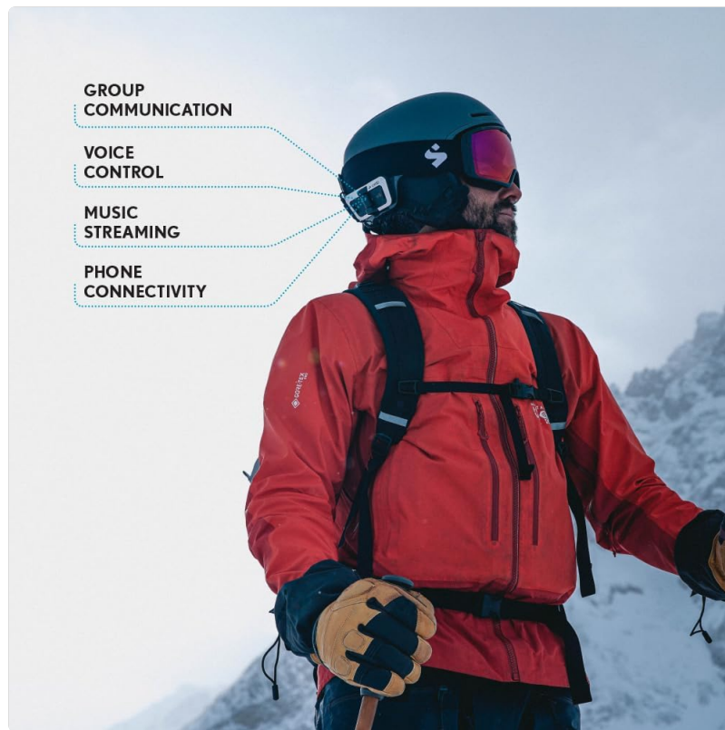
Image: The Cardo PACKTALK Outdoor unit mounted on a helmet, illustrating its key communication and audio features.