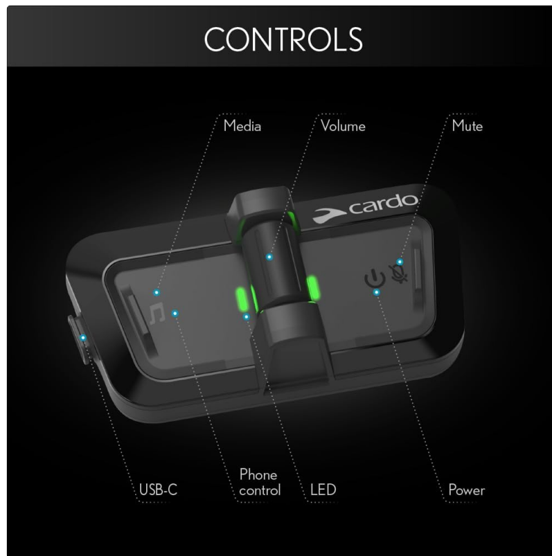
Image: Detailed view of the PACKTALK Outdoor unit, showing USB-C port, phone control, LED indicator, and power/mute buttons.