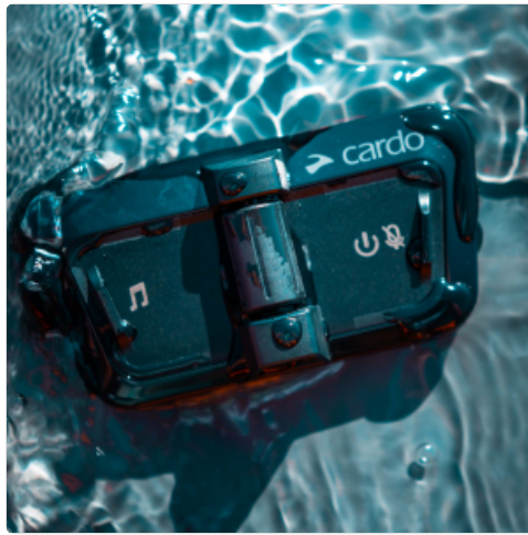
Image: The PACKTALK Outdoor unit shown partially submerged in water, emphasizing its IP67 waterproof rating.