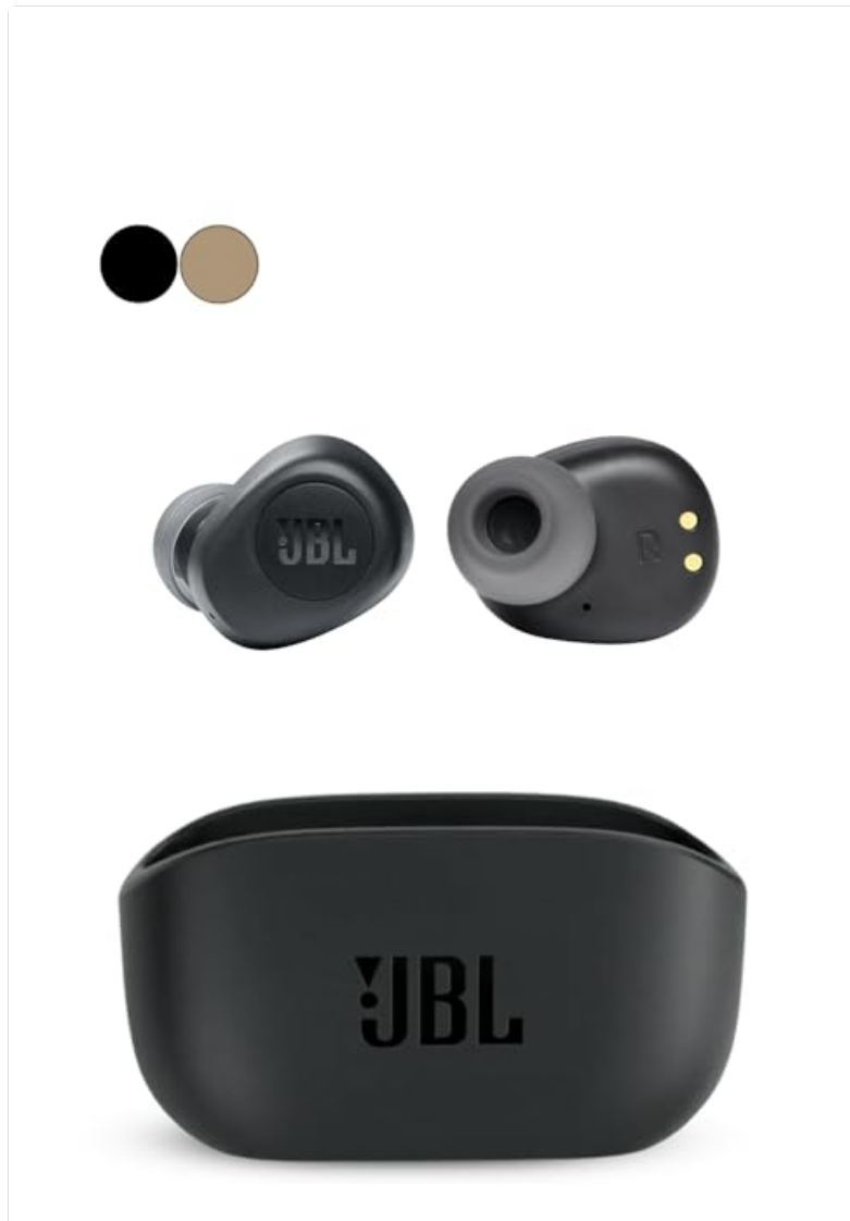
Image: Contents of the JBL Wave Beam package, including the earbuds, charging case, USB-C cable, and various ear tip sizes.