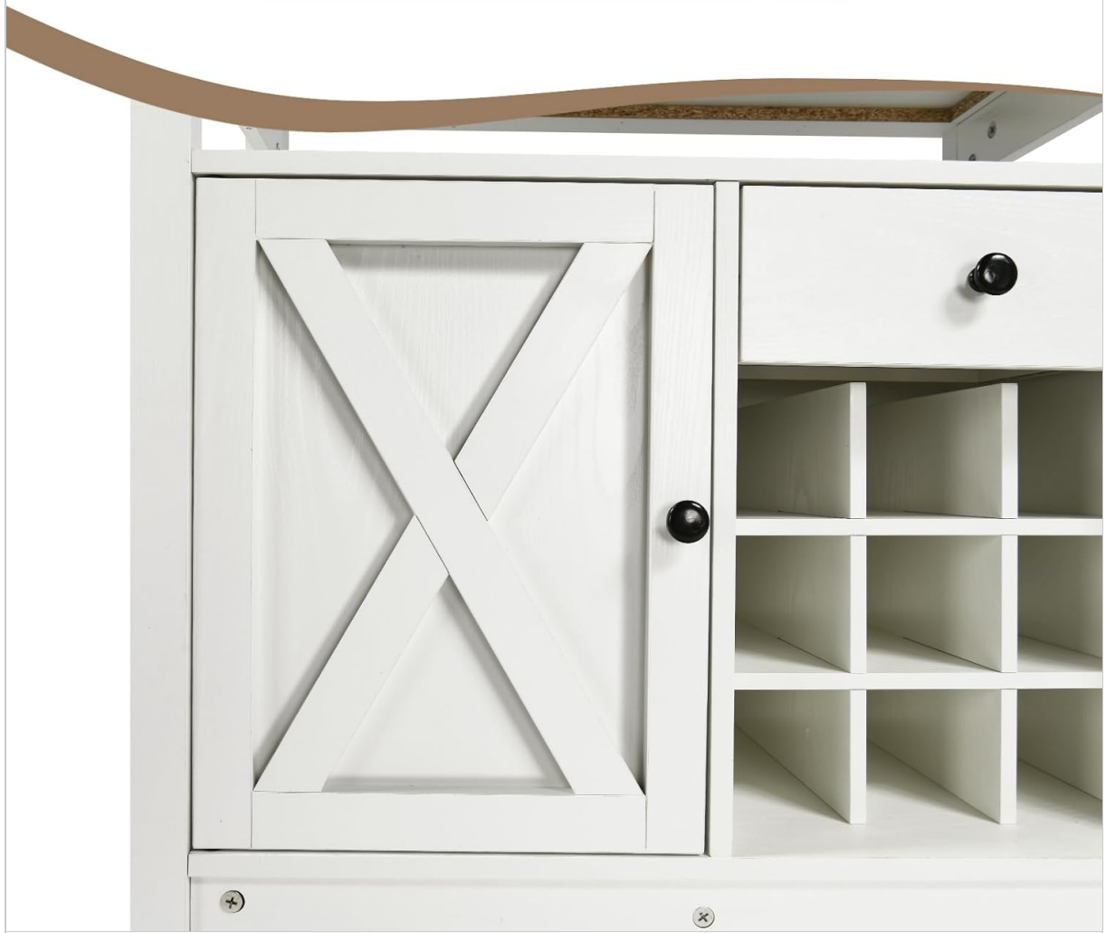
Image: Detail of the barn door design, highlighting the aesthetic feature of the cabinet.