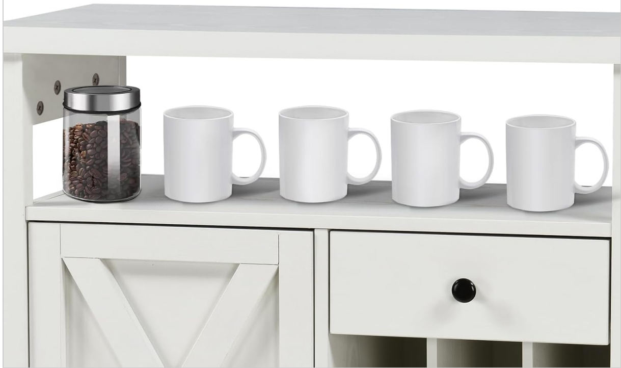
Image: Storage space on the open shelf, demonstrating its capacity for multiple coffee mugs and a jar.