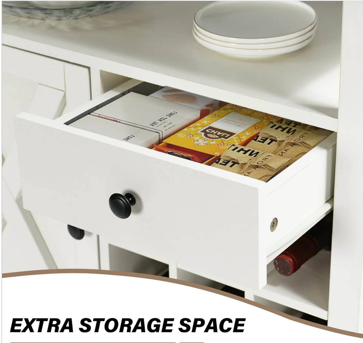
Image: Extra storage space provided by the pull-out drawer, suitable for small kitchen or bar accessories.