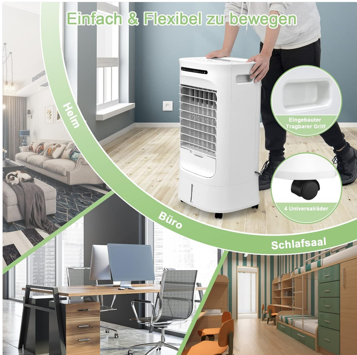
Image 4.1: The air cooler features wheels and handles for easy portability.