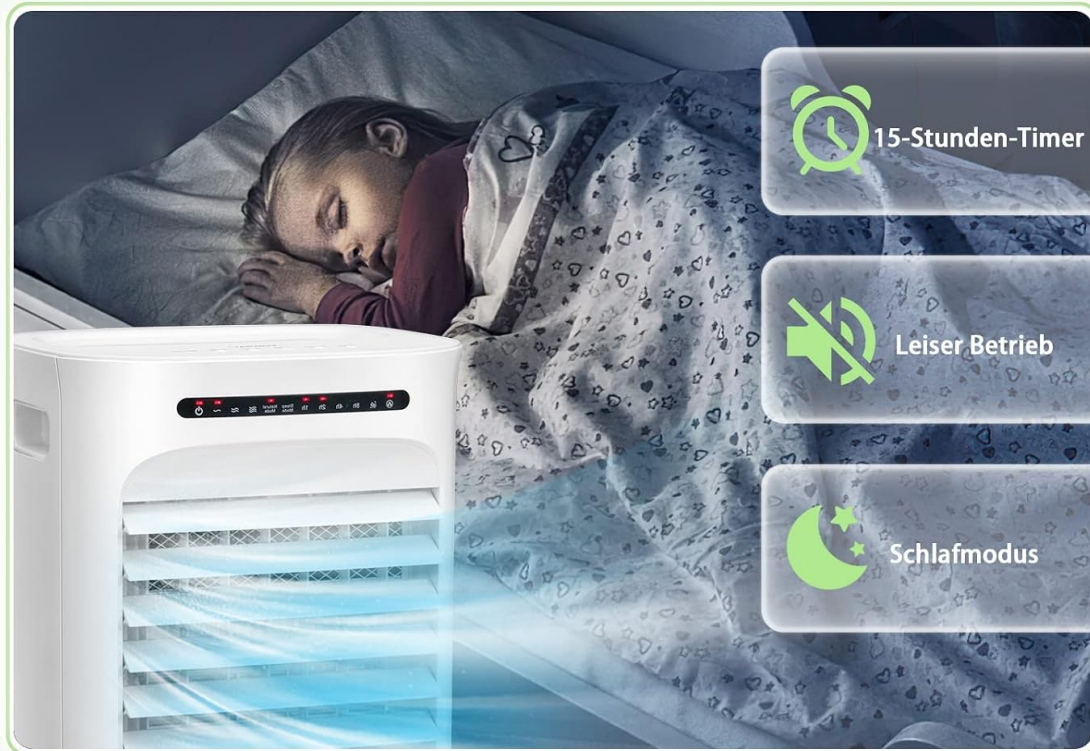
Image 5.1: The air cooler offers Normal, Natural, and Sleep modes with adjustable fan speeds.