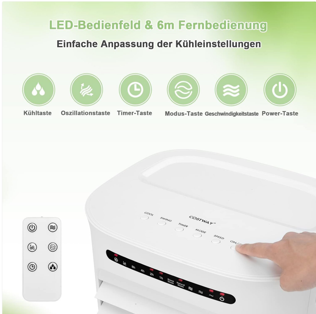
Image 3.1: Detailed view of the LED control panel and remote control.

The LED control panel on top of the unit allows you to manage all functions. It includes buttons for Power, Speed, Mode, Timer, Oscillation, and Cooling. The display shows current settings.