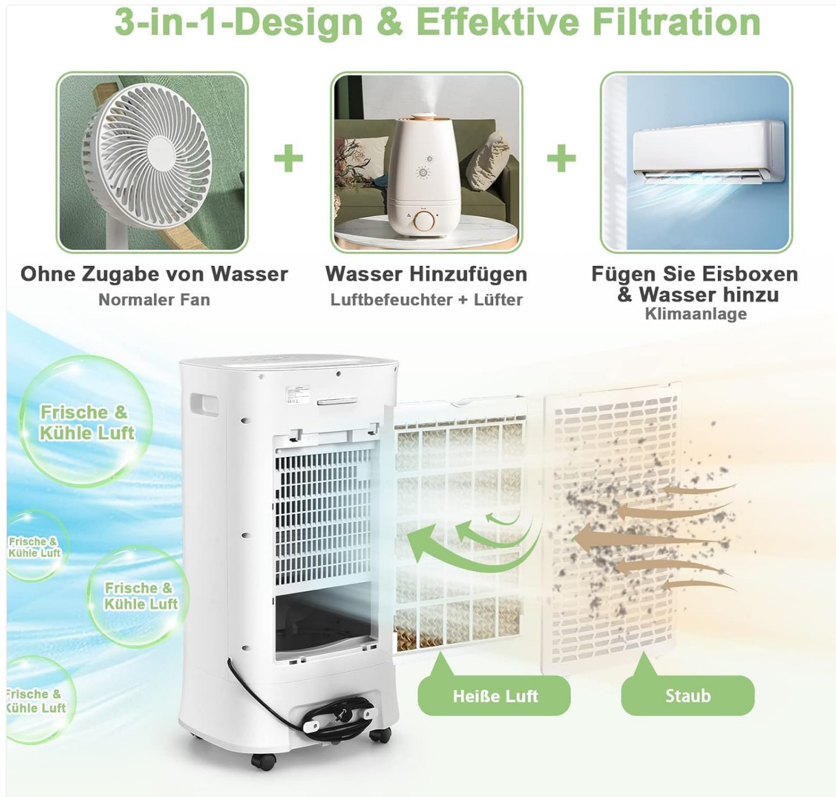
Image 6.1: The air cooler's filtration system, including the removable dust filter and honeycomb cooling pad.