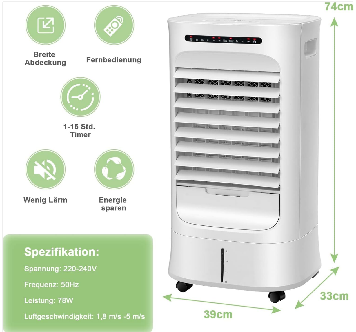
Image 8.1: Dimensions and technical specifications of the air cooler.