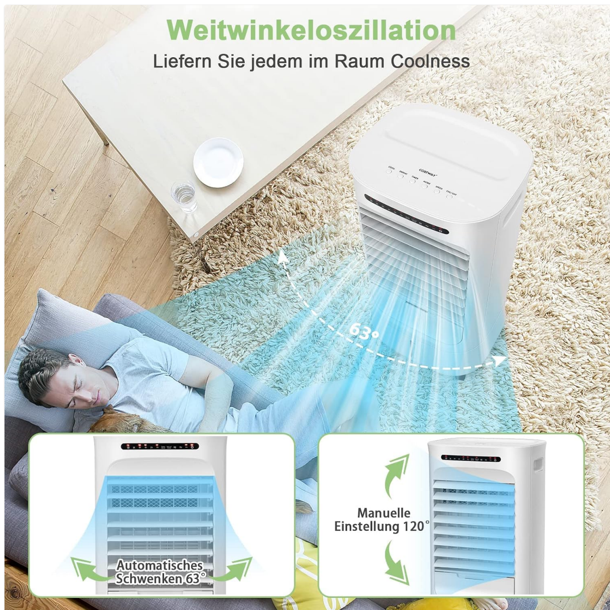
Image 5.2: The air cooler features wide-angle oscillation for even air distribution.