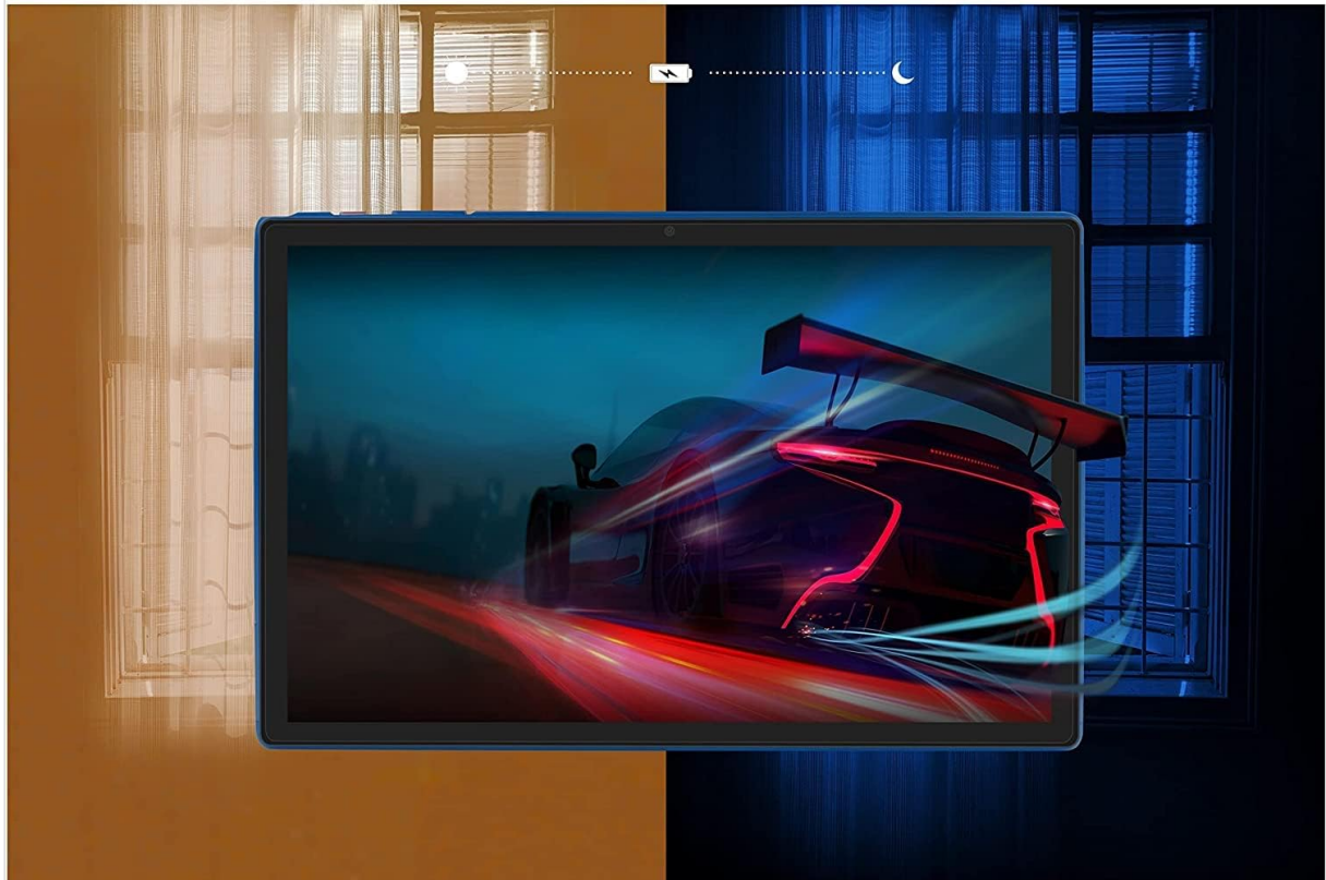
Figure 3.4: Tablet's 8000mAh long-lasting battery.