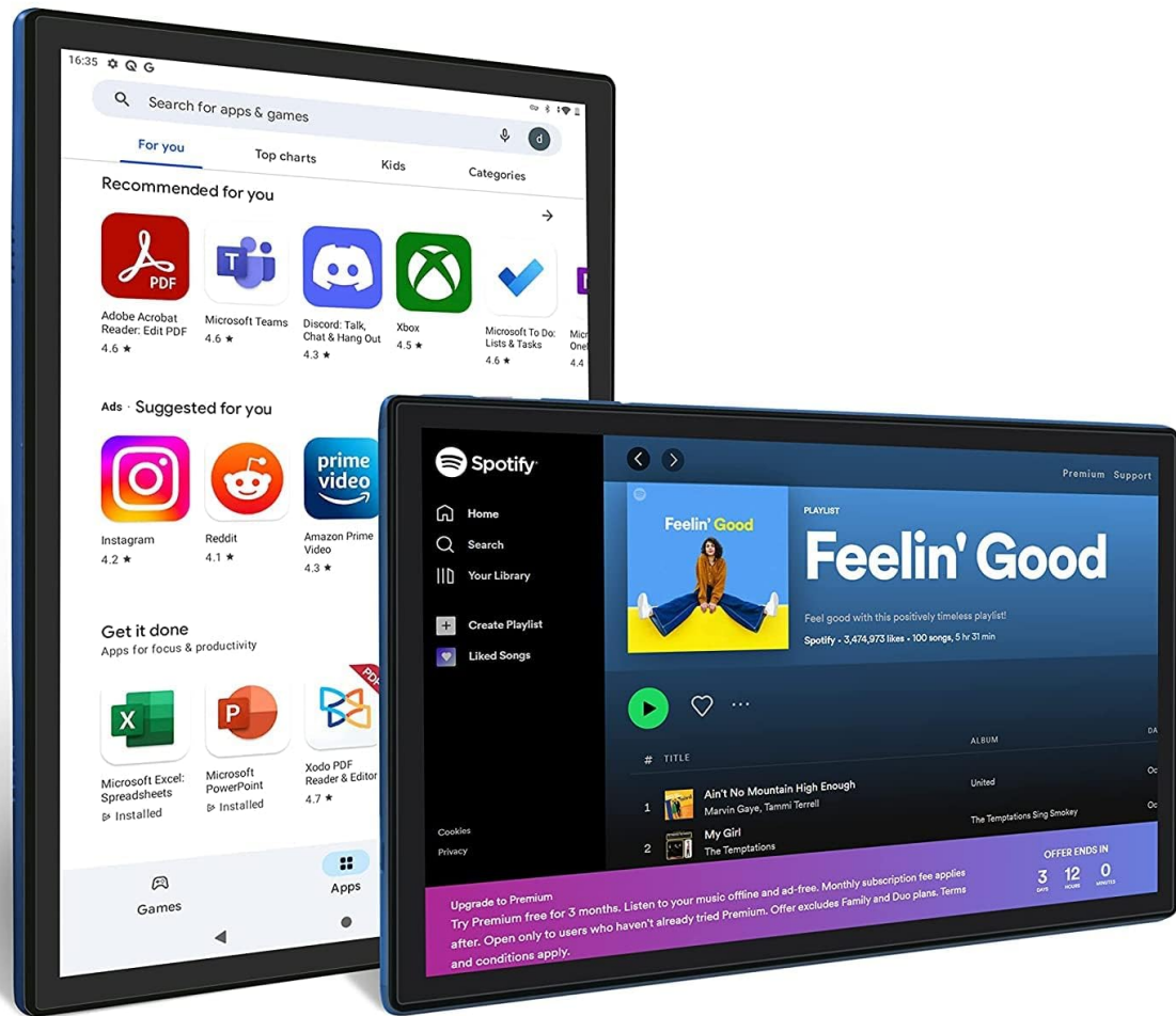
Figure 3.3: The 10-inch Smart IPS Display in use.

The screen of the G10 is a 10-inch smart IPS screen with flexible response, comfortable touch and bright colors, and anti blue light