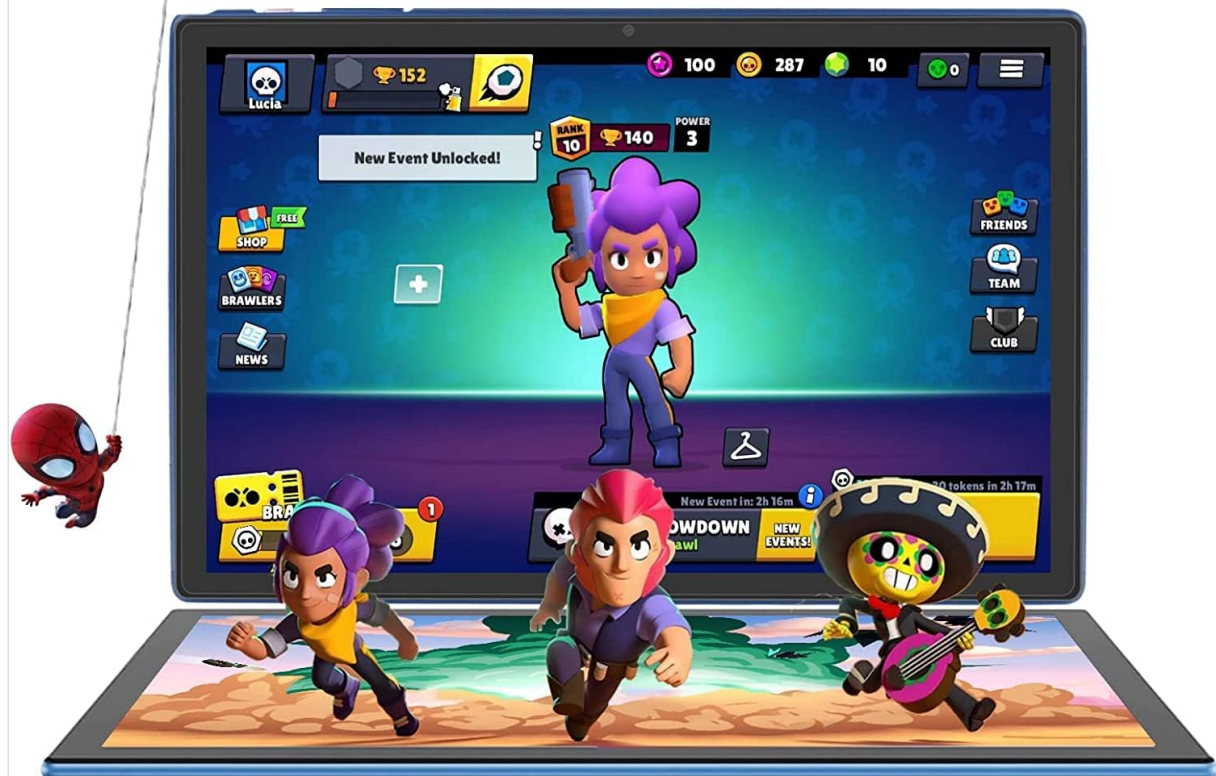
Figure 3.2: Tablet performance with Octa-Core processor and Android 12 OS.

Android 12 OS and octa-core processor provide stability and synchronous response for system running application processing.