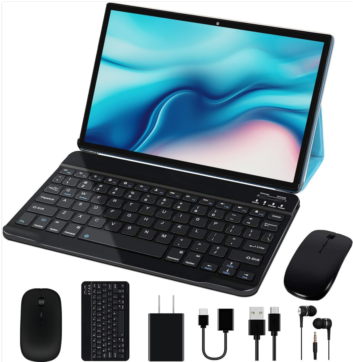
Figure 2.1: GOODTEL G10 Tablet and its complete set of accessories.