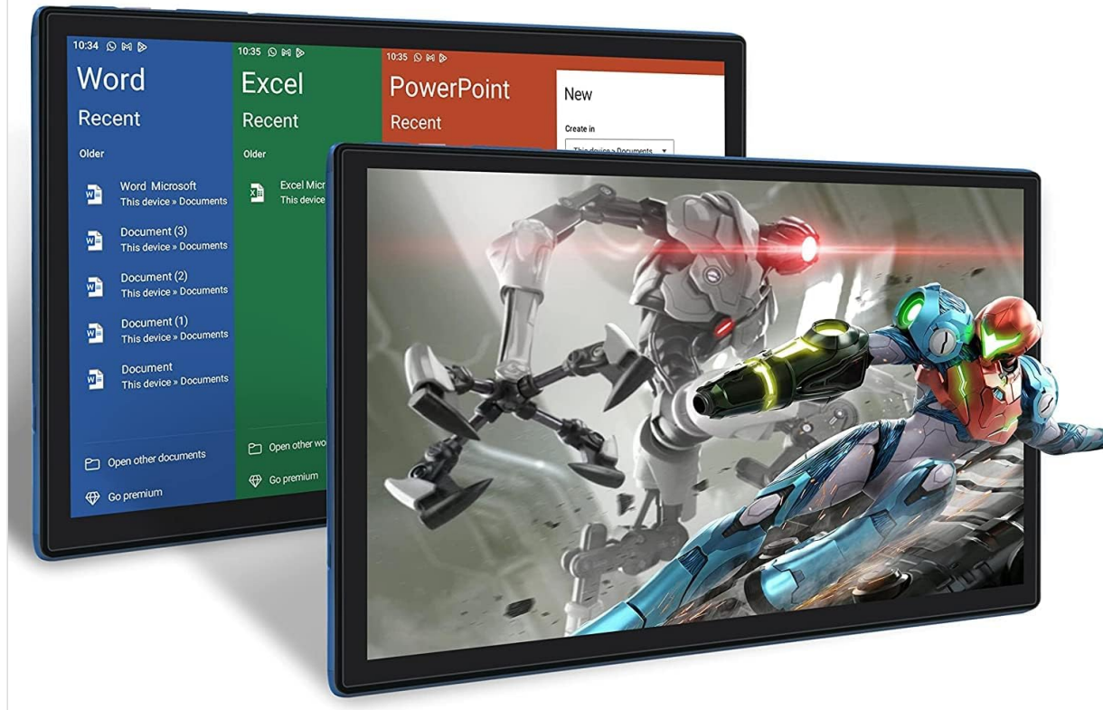
Figure 3.5: Tablet's storage capabilities for documents and media.

G10 tablet is equipped with 64GB ROM and supports 4GB - 256 GB SD/TF card memory expansion, Provide ample space for desktop study materials, work files, pictures, video,movies, music and applications, etc. ( SD/TF card needs to be purchased separately).