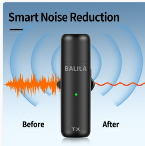
Image: Diagram illustrating how smart noise reduction technology filters out unwanted background noise.