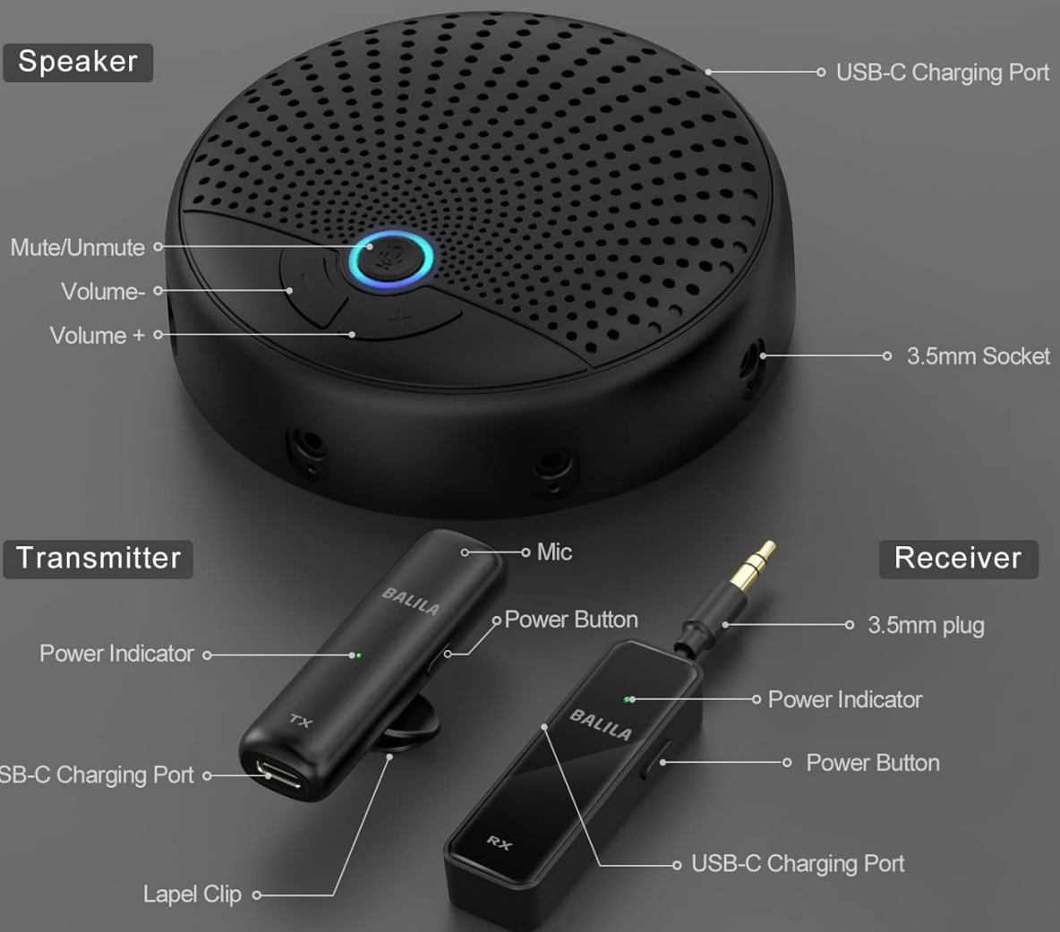
Image: Detailed diagram illustrating the various ports, buttons, and indicators on the speaker unit, transmitter, and receiver.