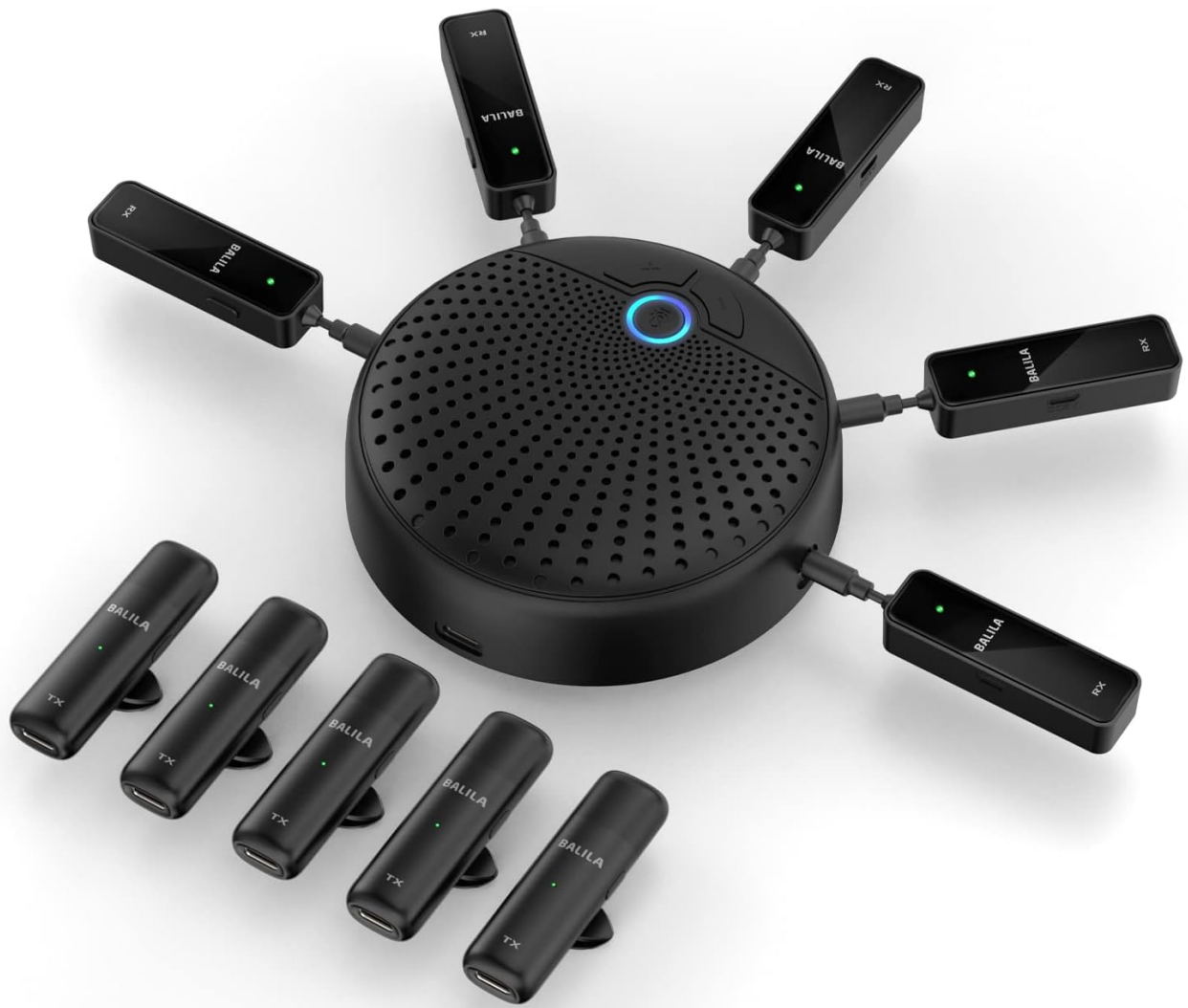
Image: The BALILA USB Conference Speakerphone system, showing the central speaker unit connected to five receivers, and five separate transmitters.