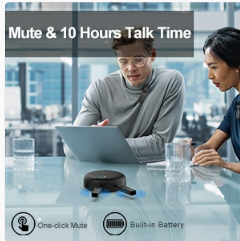
Image: Visual representation of the one-click mute functionality and the extended talk time provided by the built-in battery.

Press the Mute/Unmute button on the speaker unit to mute or unmute all connected microphones. The blue indicator light on the transmitters will be on when the microphone is working and off when muted.