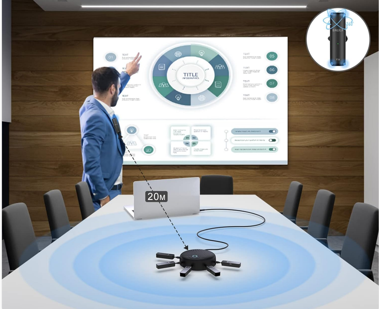
Image: Demonstration of the wide working range, allowing speakers to move up to 20 meters from the speaker unit.

Working range up to 20M, speakers can walk around for presentations freely.