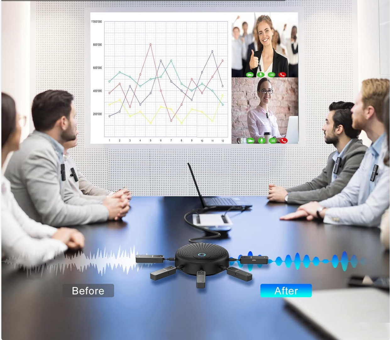
Image: Visual comparison of audio quality before and after noise reduction, highlighting clear sound for remote participants.

Let the person you're calling hear you clearly and brightly