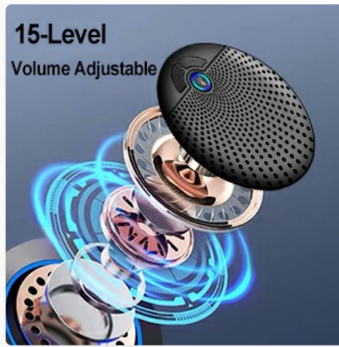
Image: An internal view of the speaker unit, emphasizing its 15-level adjustable volume capability.