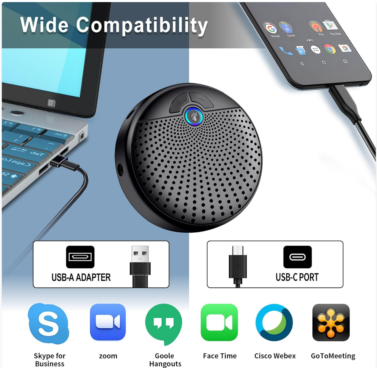
Image: Illustration of the wide compatibility of the speakerphone with various devices via USB-A and USB-C, and popular conferencing software.