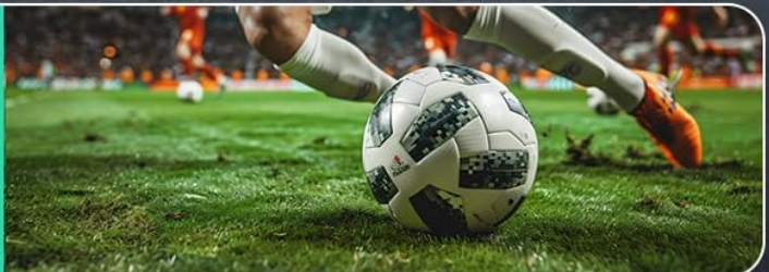
Image: The inflator is compatible with a wide range of items, from vehicle tires to sports equipment.