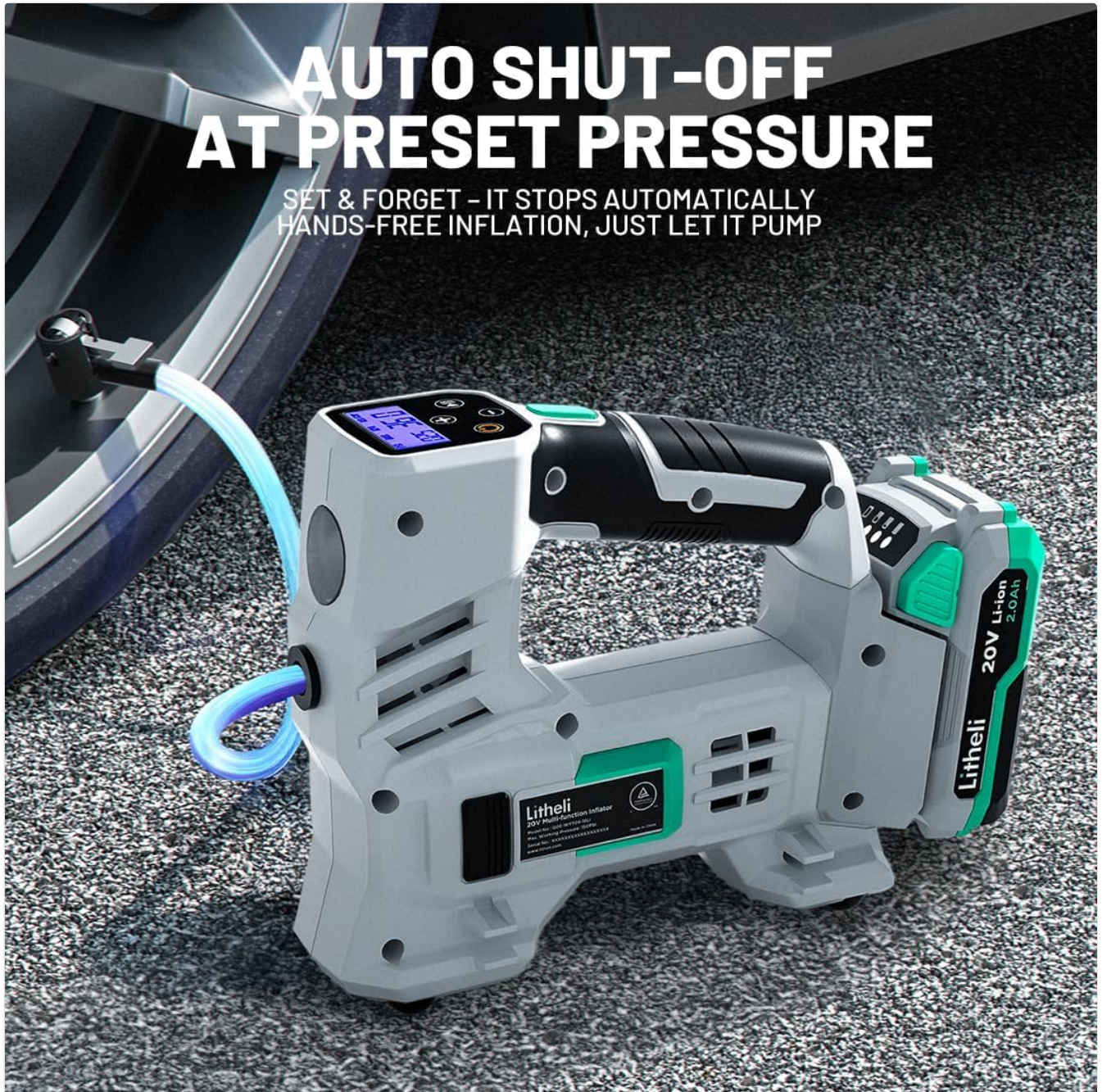
Image: The inflator features an automatic shut-off function when the target pressure is reached.