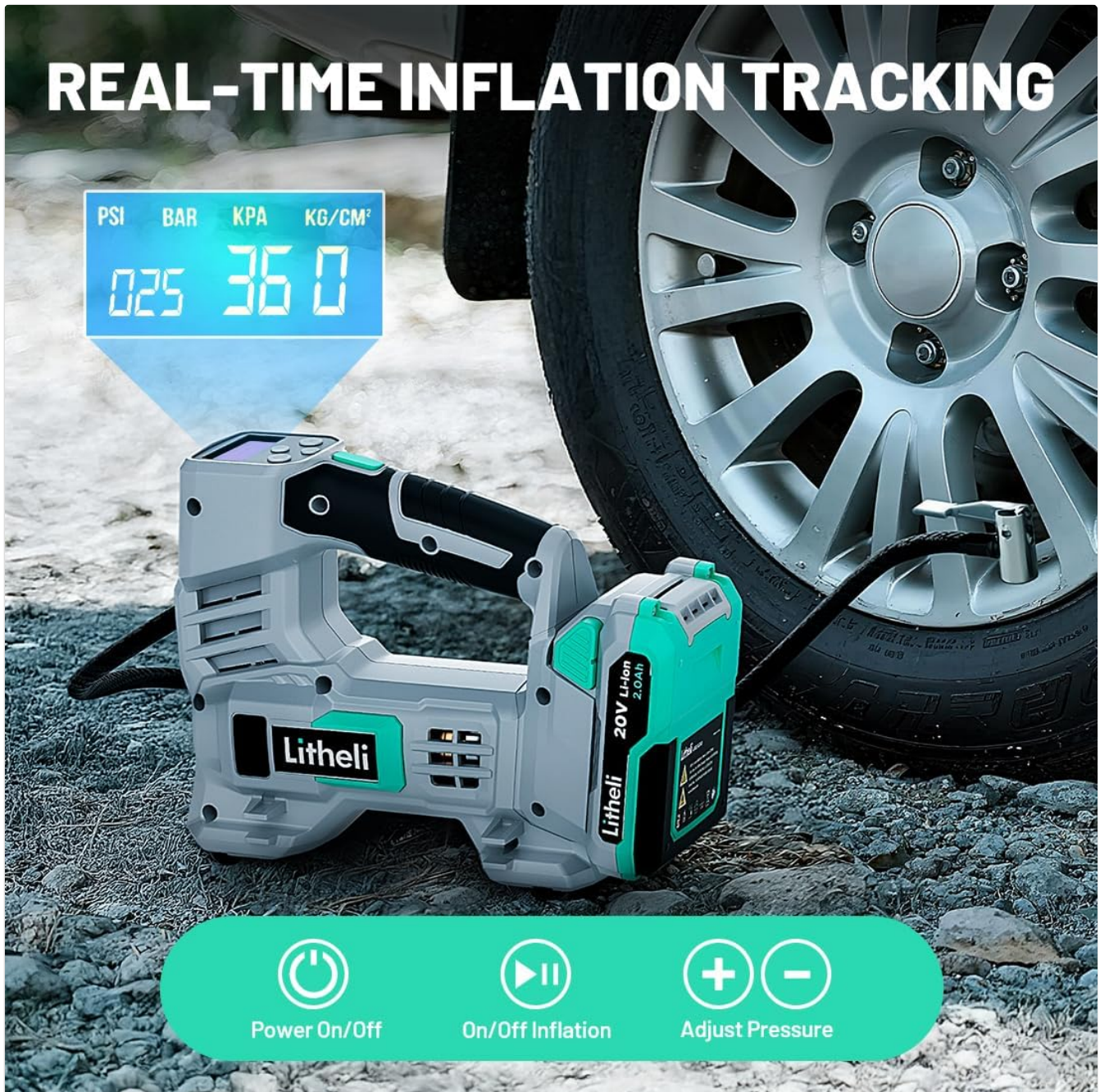
Image: The digital display shows real-time pressure and allows for preset adjustments.