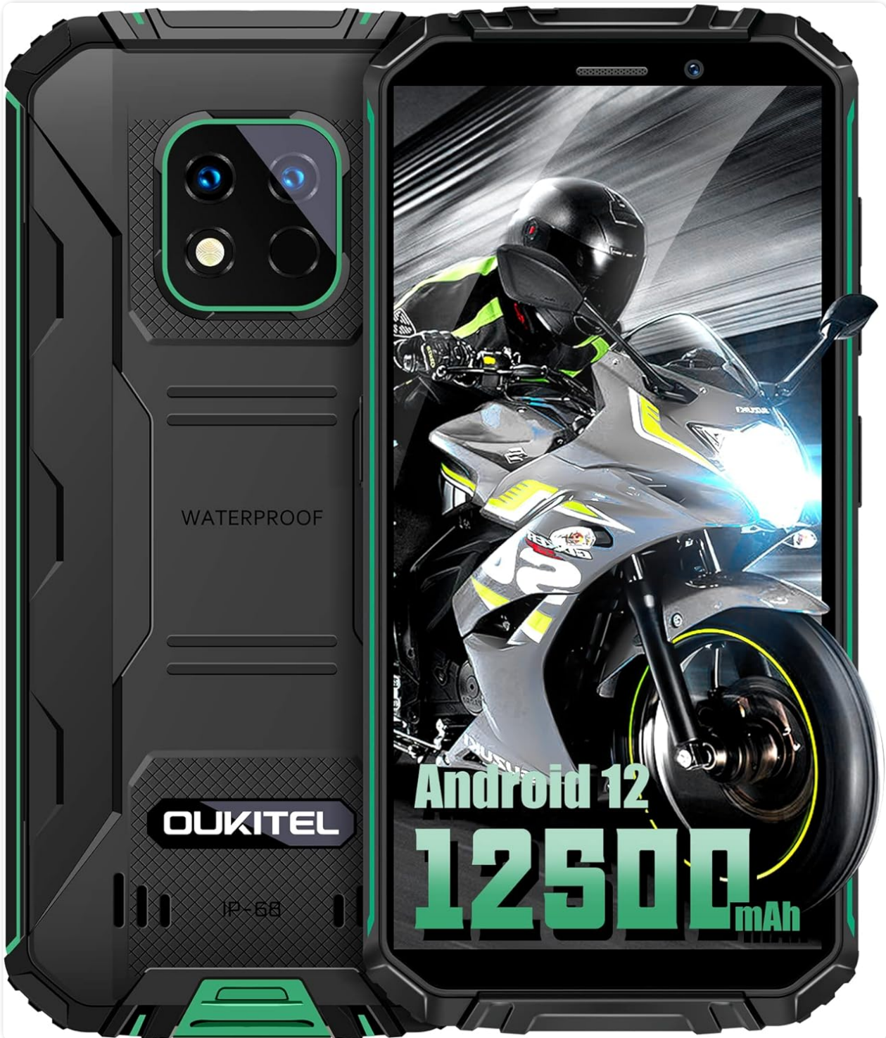
Figure 1: OUKITEL WP18 Pro Rugged Smartphone

The OUKITEL WP18 Pro is a rugged smartphone built to withstand harsh conditions, featuring a durable exterior and a large battery capacity.