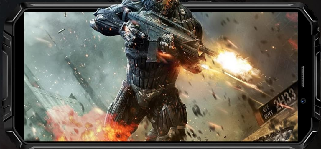
Figure 4: Shows the OUKITEL WP18 Pro running Android 12, emphasizing the user interface and system features.