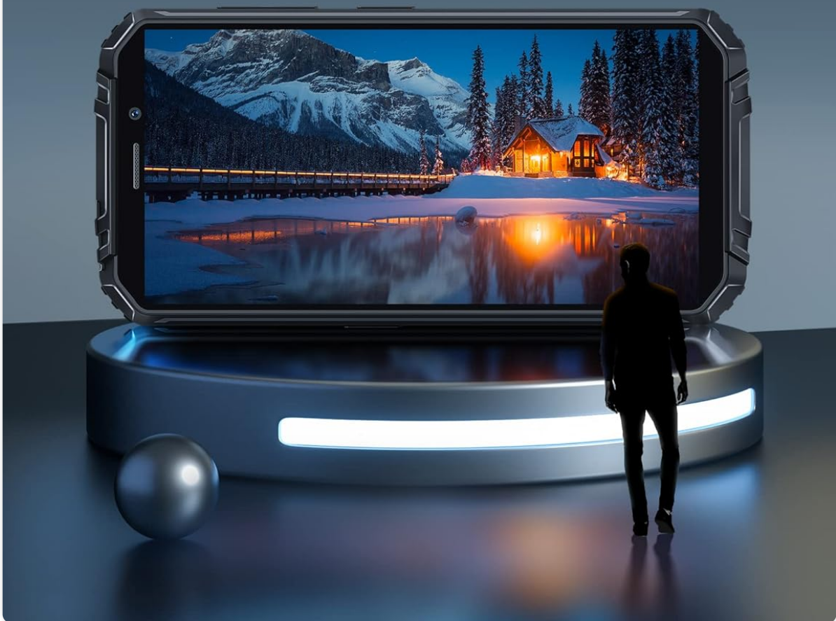
Figure 5: Highlights the 5.93-inch HD+ display with Corning Gorilla Glass, providing a clear and durable viewing experience.