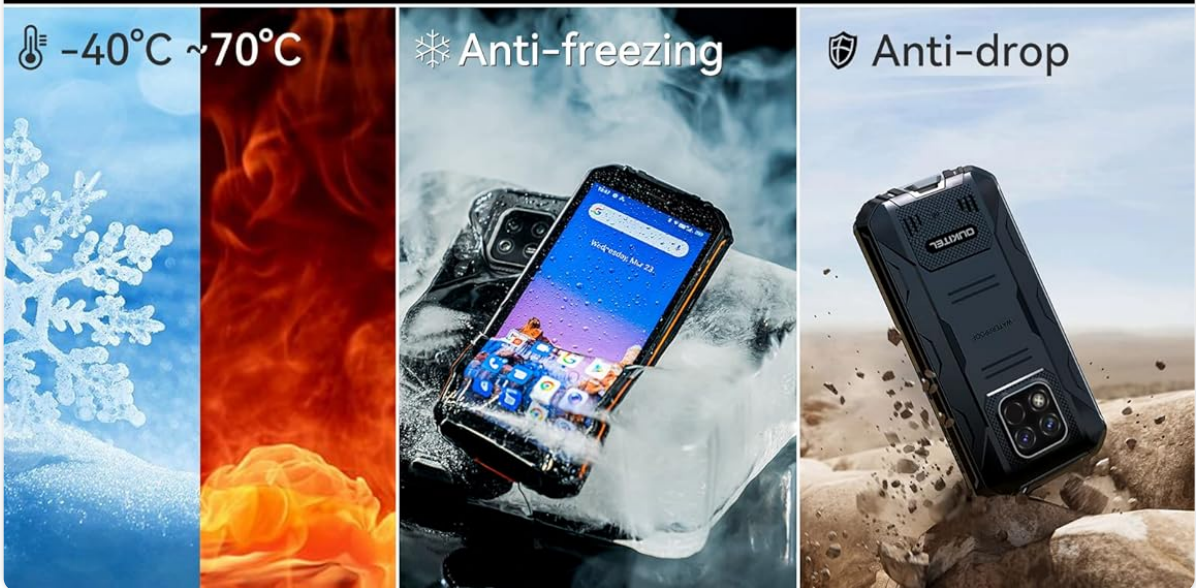
Figure 3: Demonstrates the phone's resistance to water, extreme temperatures, and drops, highlighting its rugged design.