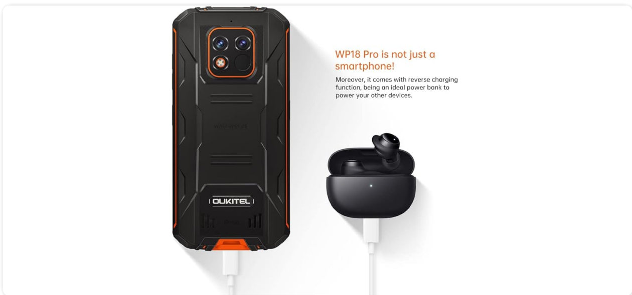
Figure 8: Shows the OUKITEL WP18 Pro utilizing its reverse charging feature to power another device, demonstrating its power bank capability.