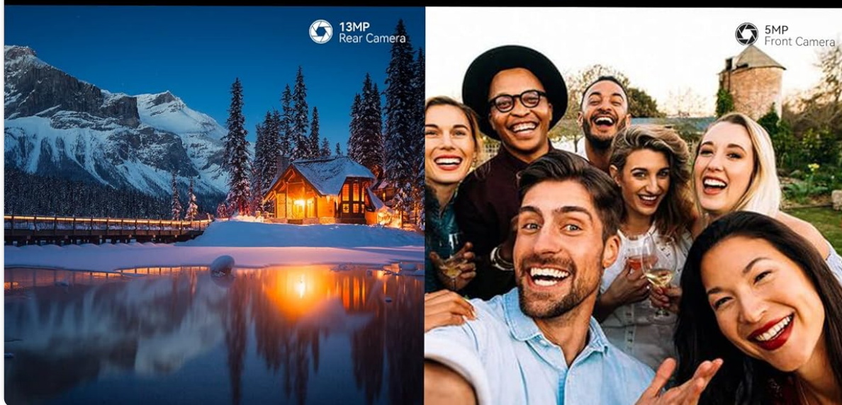
Figure 6: Details the camera specifications, including the 13MP rear camera and 5MP front camera, suitable for various photography needs.