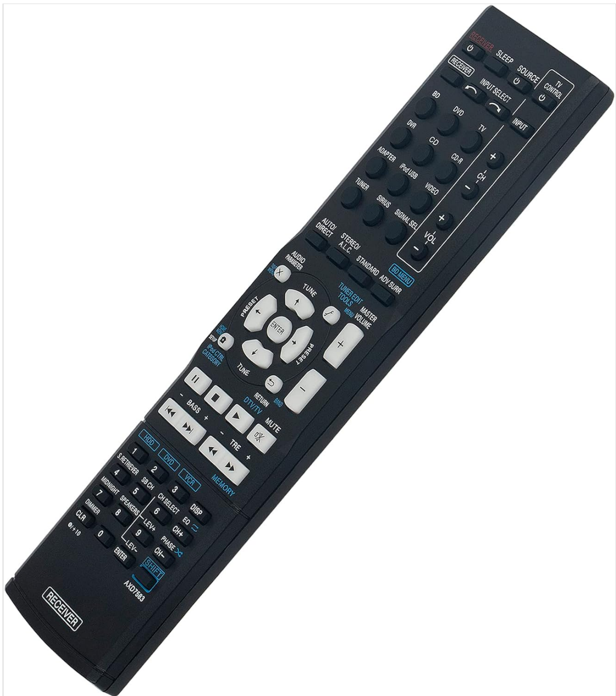
Image 1: Front view of the VINABTY AXD7583 Replacement Remote Control, showing all buttons and their labels.