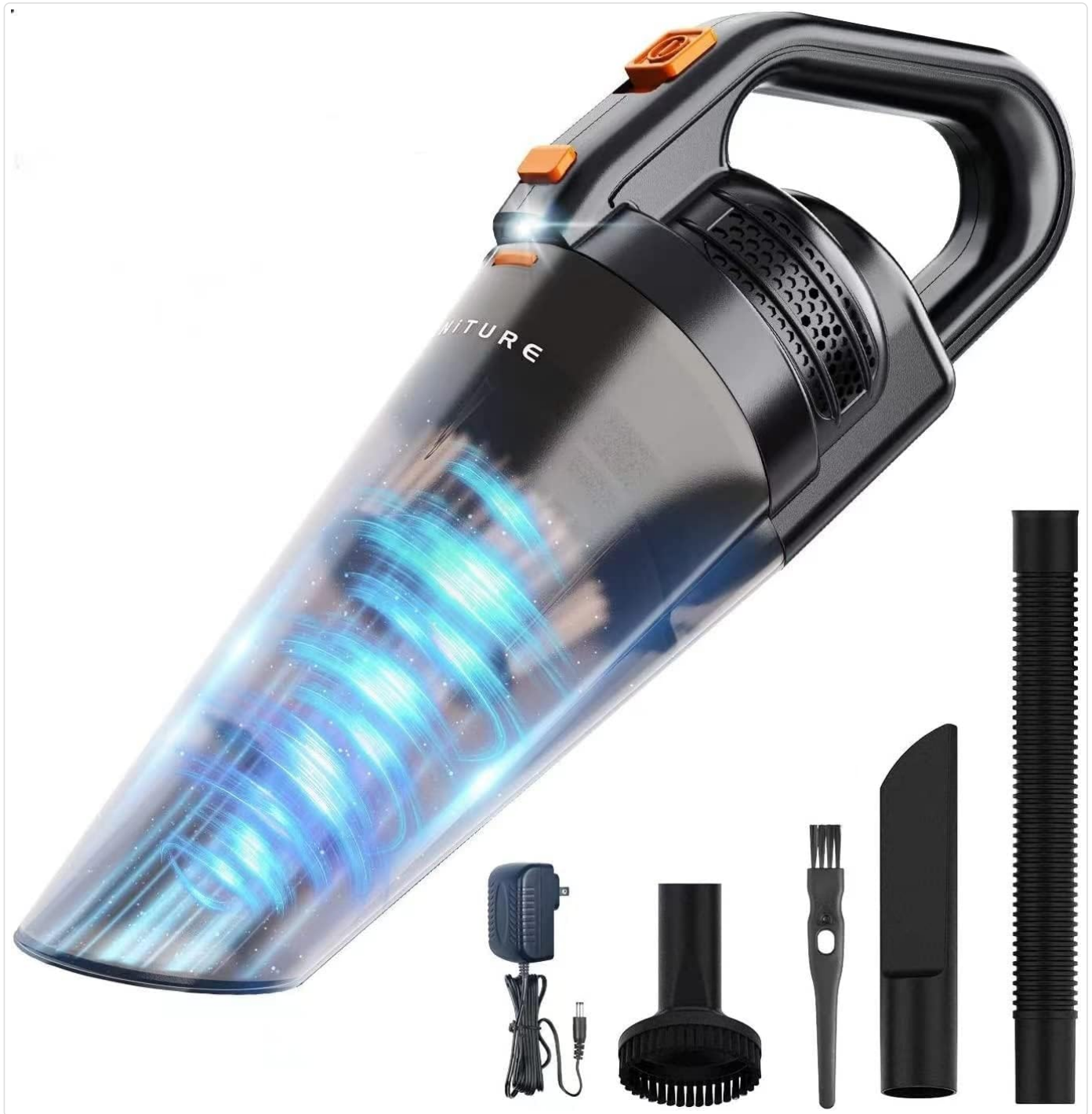
Figure 2.1: The HONITURE H203 handheld vacuum cleaner shown with its included accessories: charging adapter, brush nozzle, crevice tool, and extension hose.

Familiarize yourself with the components of your HONITURE H203 handheld vacuum cleaner.