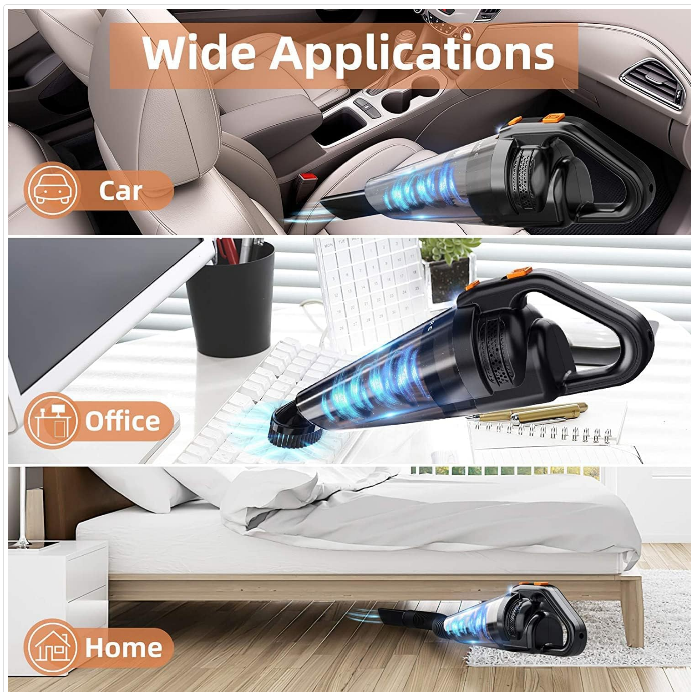
Figure 4.1: The HONITURE H203 vacuum cleaner demonstrating its versatility in various environments, including car interiors, office desks, and under furniture at home.

For general dry cleaning, attach the appropriate nozzle (crevice tool for tight spots, brush for surfaces) and turn on the vacuum. Move the nozzle slowly over the area to be cleaned to allow the suction to effectively pick up debris.