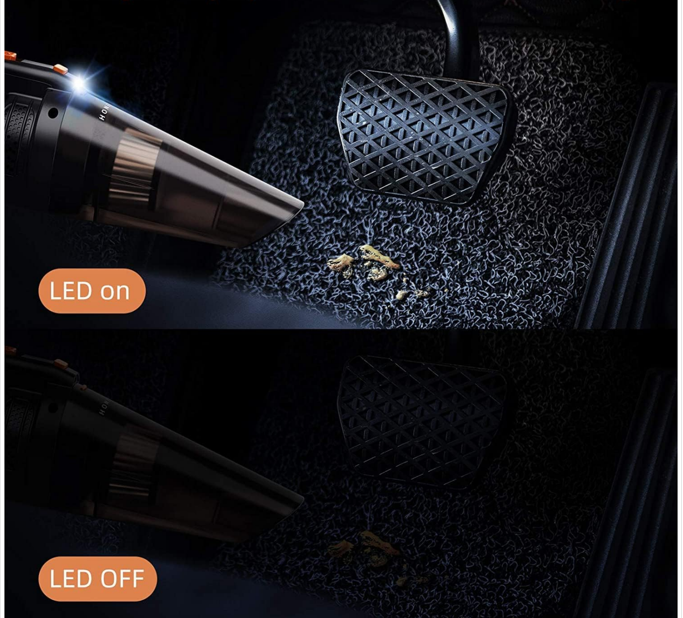
Figure 4.3: The vacuum's LED light is shown illuminating a dark car footwell, highlighting debris that would otherwise be difficult to see, demonstrating its utility in low-light conditions.