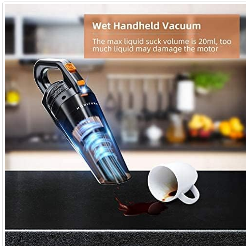
Figure 4.2: The handheld vacuum is shown effectively cleaning a small liquid spill on a countertop, highlighting its wet vacuuming capability.