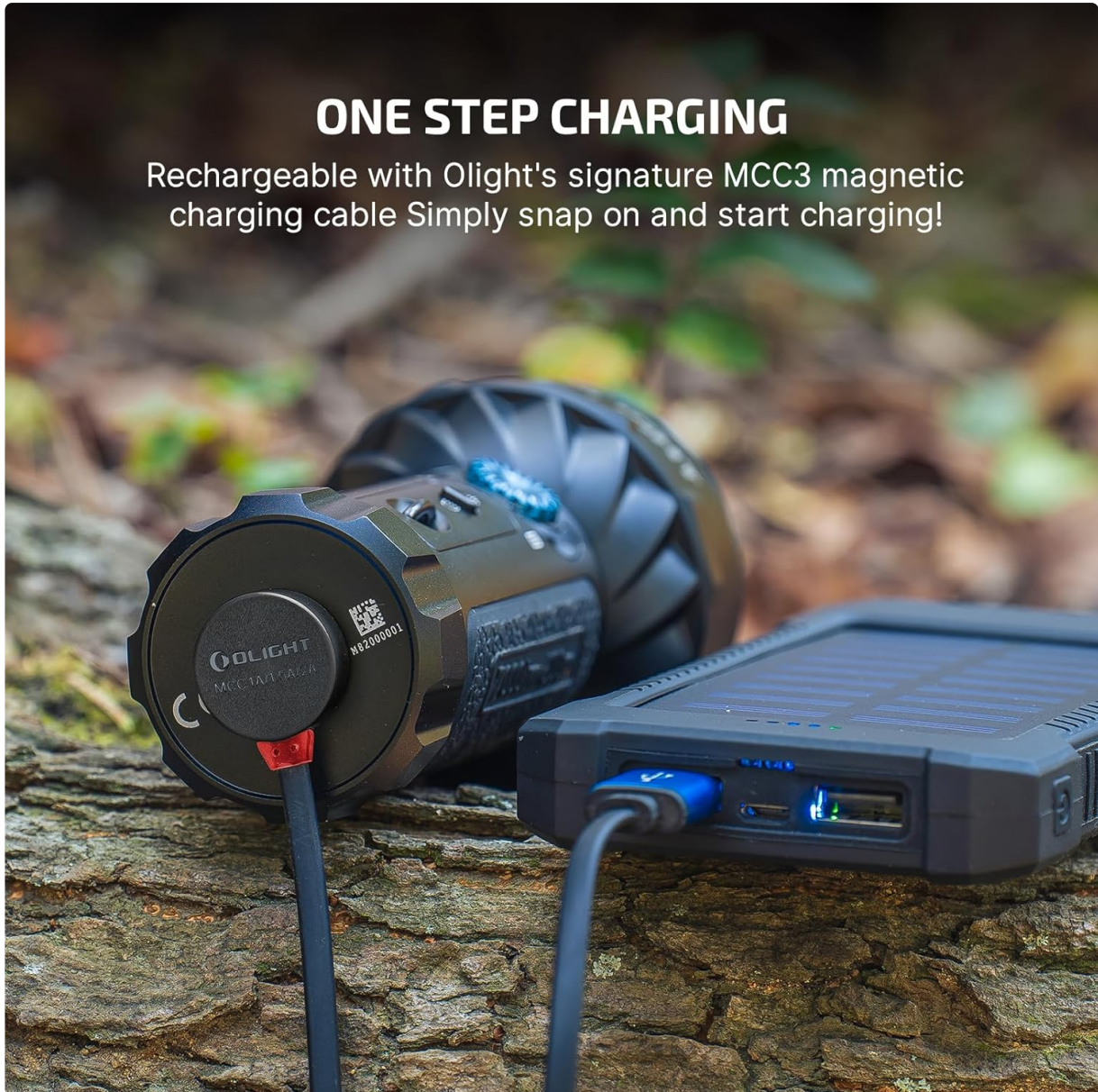
Image: The Marauder Mini connected to its MCC3 magnetic charging cable, demonstrating the simple one-step charging process with a power bank.