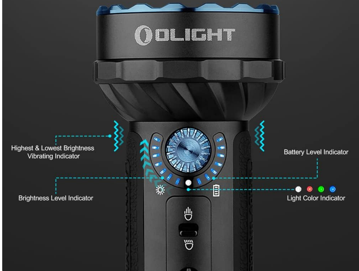
Image: A detailed view of the Marauder Mini's intuitive user interface, illustrating the rotary knob and the surrounding indicators for brightness, battery status, and RGB light color selection.

Large, ergonomic rotary knob switch for easy operation.