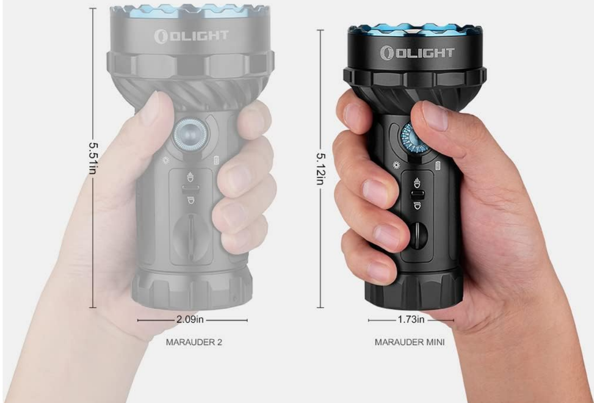
Image: A visual comparison illustrating the Marauder Mini's more compact and lighter design compared to the larger Marauder 2, emphasizing its improved portability and handling.

Compared to the Marauder 2, this light is more compact and holds a lighter weight at only 16oz, which comfortably fits in your hand and feels exceptionally balanced.