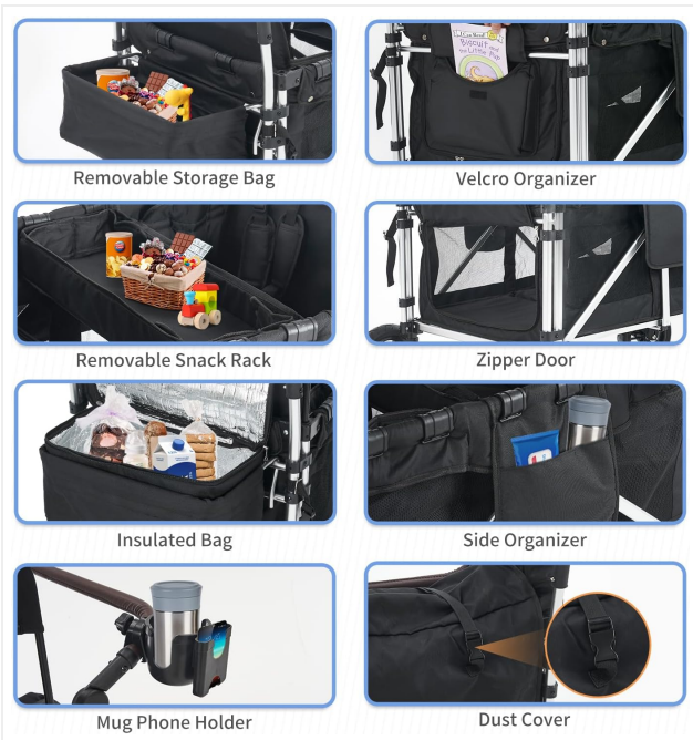
Figure 3.2: Detailed view of the various storage options, including a removable storage bag, removable snack rack, insulated bag, side organizer, and mug/phone holder.