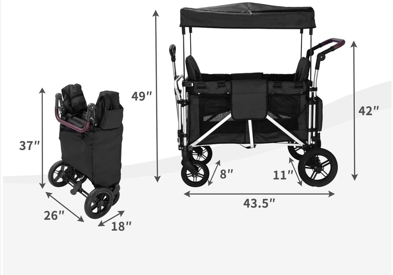
Figure 8.1: Product dimensions in both unfolded and folded states.