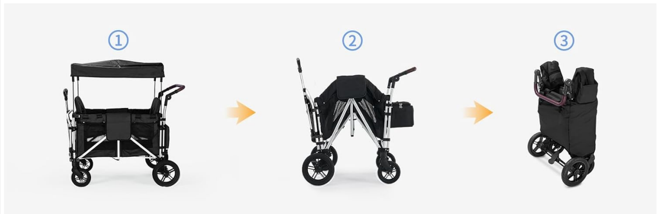
Figure 4.1: Visual guide for the multi-angle adjustable handle and the three-step process for folding the wagon for storage.