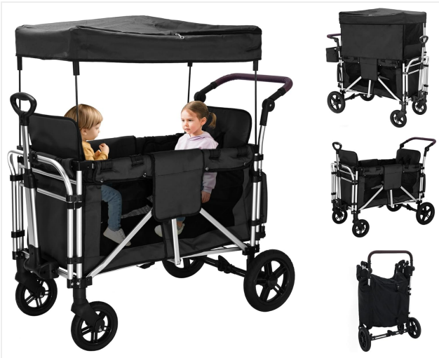
Figure 3.1: Overall view of the wanan Stroller Wagon, showcasing its design for two children with an extended canopy.

The wanan Stroller Wagon is equipped with several features for comfort, convenience, and safety.