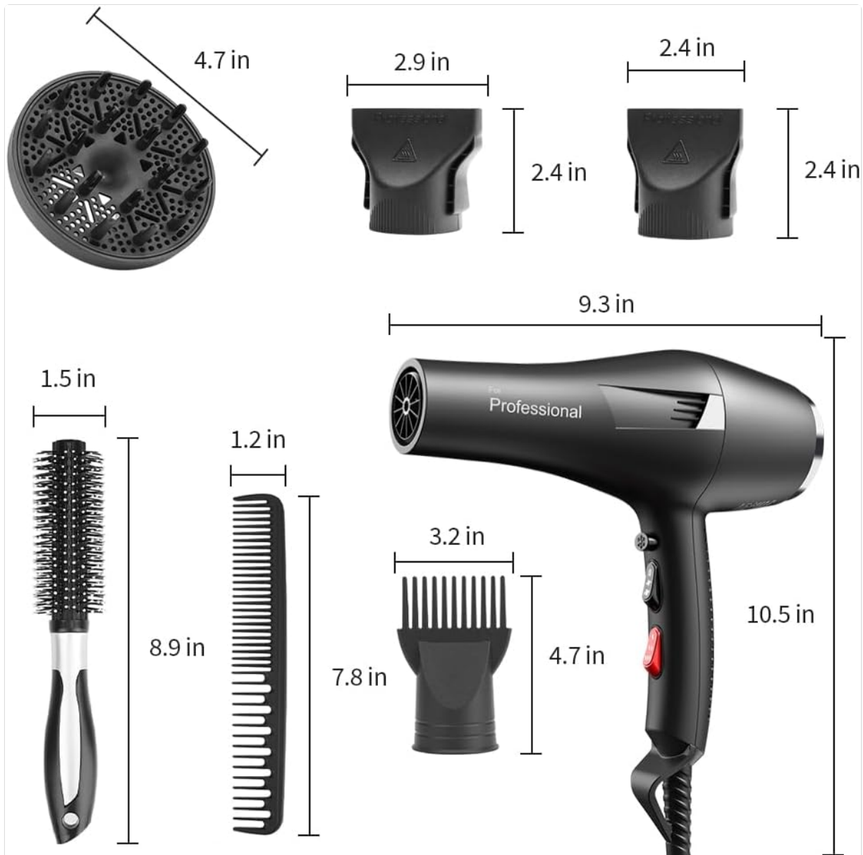
Image: Detailed dimensions of the hair dryer, diffuser, concentrator nozzles, round brush, and flat comb.