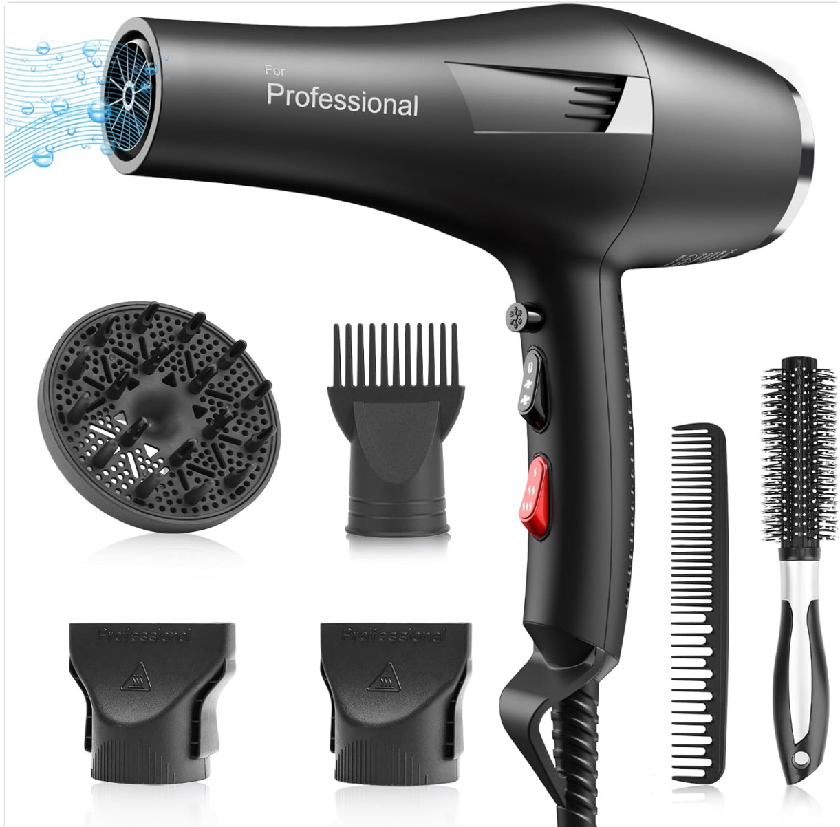
Image: The Faszin Ionic Salon Hair Dryer shown with its main unit, diffuser, two concentrator nozzles, a wide-tooth comb, and a round brush.

Your Faszin Ionic Salon Hair Dryer comes with several components designed for versatile styling.