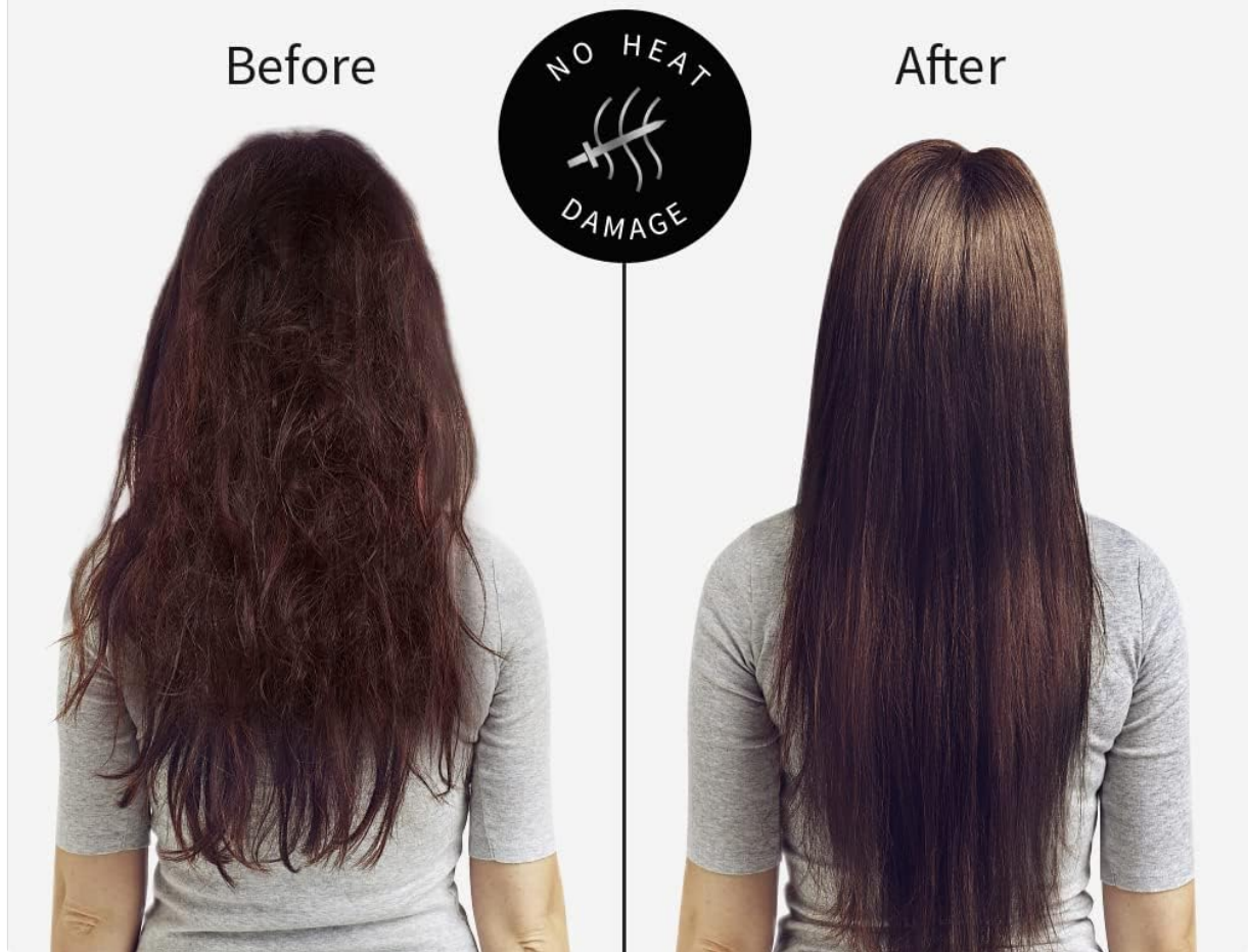
Image: Before and after photos demonstrating the effect of the ionic technology, showing significantly reduced frizz and increased smoothness and shine without heat damage.

40-90 Million Negative Ions 30% more shine, softness