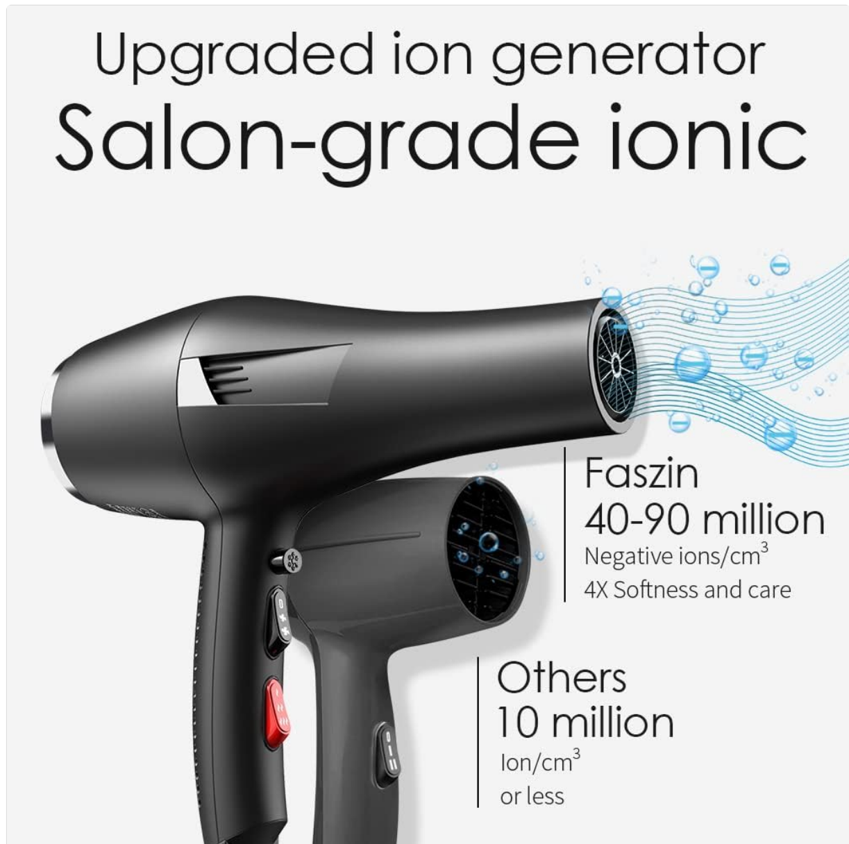
Image: Comparison illustrating the higher negative ion output of the Faszin hair dryer (40-90 million ions/cm 3 ) compared to other models (10 million ions/cm 3 or less).

The Plasma dual ionic system releases negative ions that help to break down water molecules faster, reducing drying time. These ions also seal the hair cuticle, locking in moisture, reducing frizz, and increasing shine and smoothness by up to 30%.