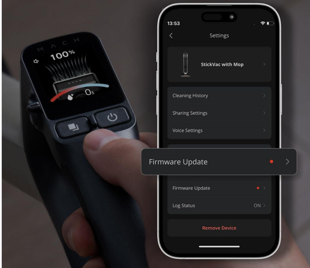
Image: The display showing various modes and battery life, with app integration for firmware updates and features.