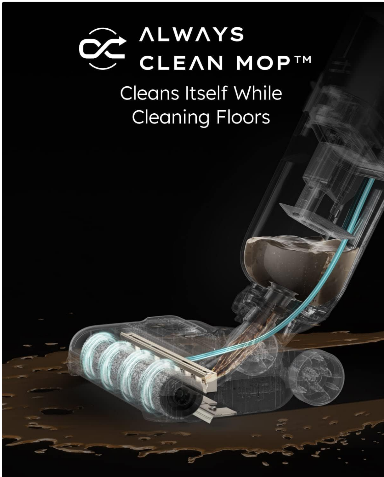
Image: The 'Always Clean Mop' system ensures the brush roll is clean during operation.

For convenient and thorough cleaning of the brush roll and internal pathways, utilize the self-cleaning function. Place the Mach V1 Ultra WetVac securely on its charging dock. Ensure the clean water tank has sufficient water and solution. Press the dedicated self-cleaning button on the handle. The device will automatically perform a hot water wash of the brush roll and then initiate a 30-minute hot air drying cycle (at 60°C) to prevent odors and keep the brush fresh.