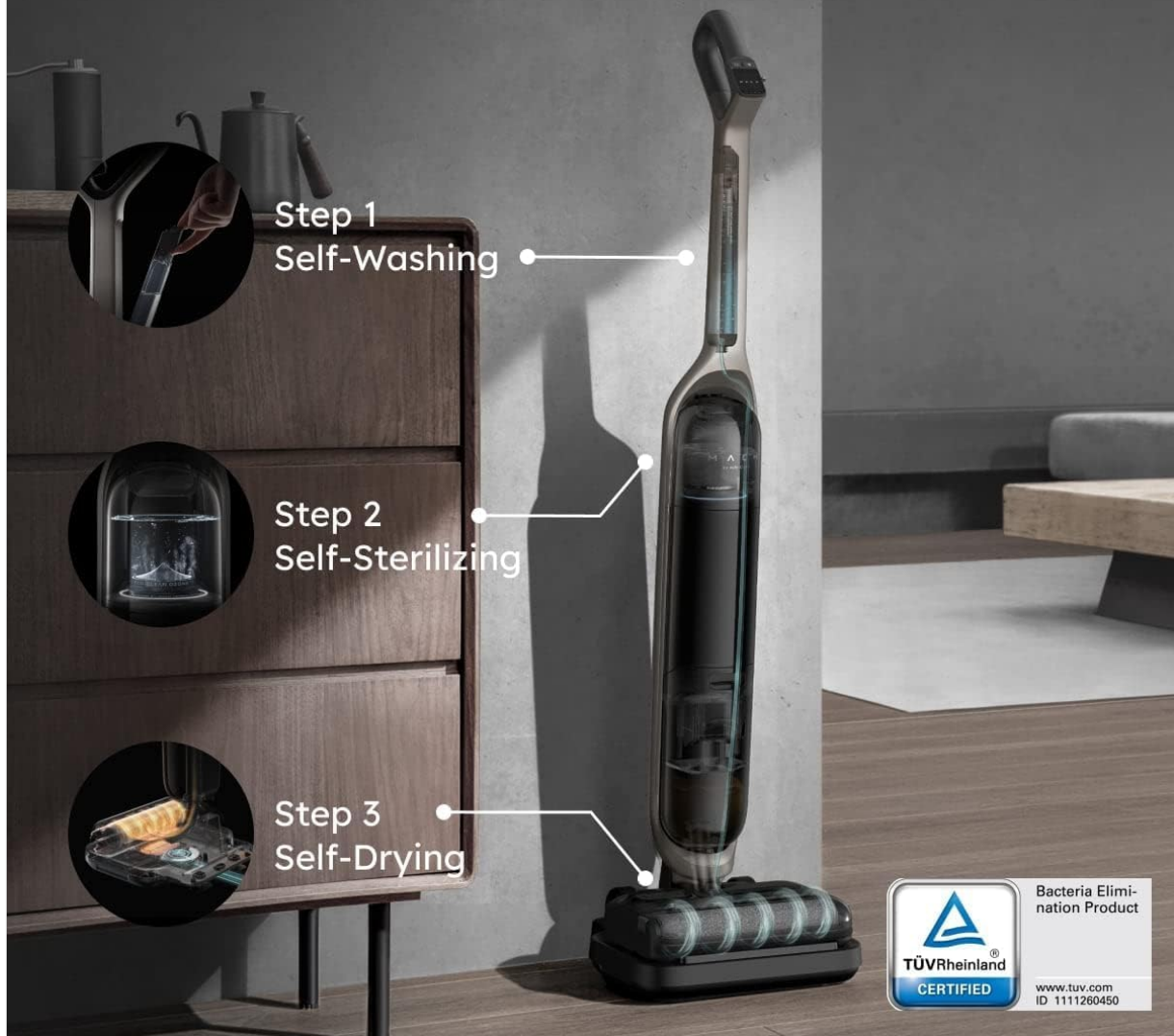
Image: The Triple Self-Cleaning System for self-washing, self-sterilizing, and self-drying after use.