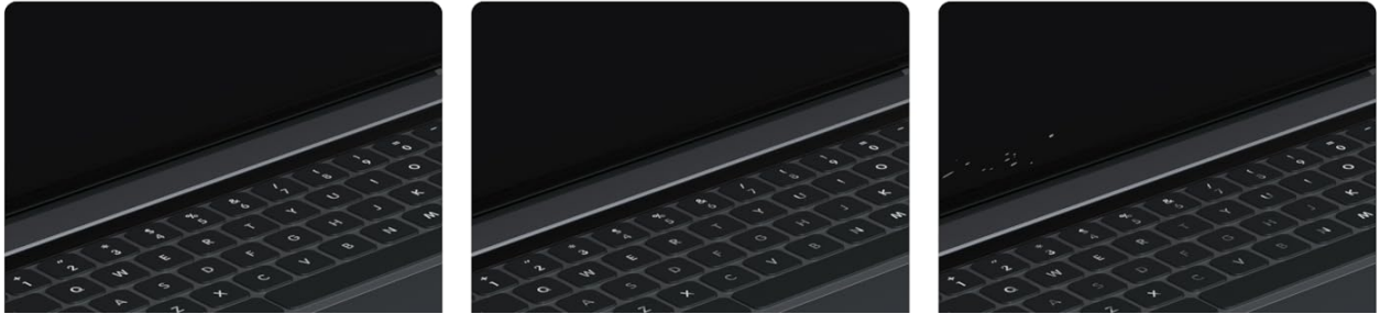
Figure 9.1: Overview of cosmetic and functional conditions for Certified Renewed products.

Example body scratches and dents – not actual products