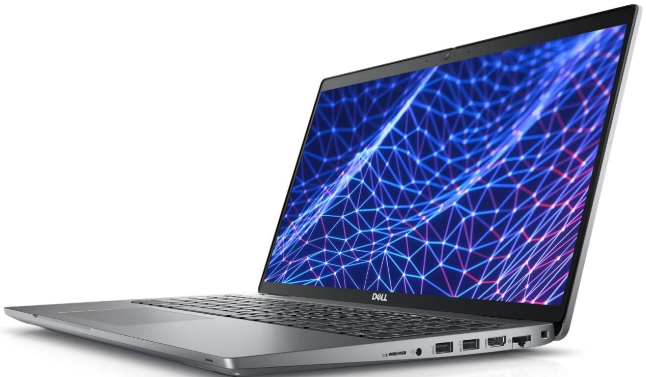
Figure 3.2: Left side of the laptop, featuring two USB-C ports (Thunderbolt compatible) and a Smart Card Reader slot.