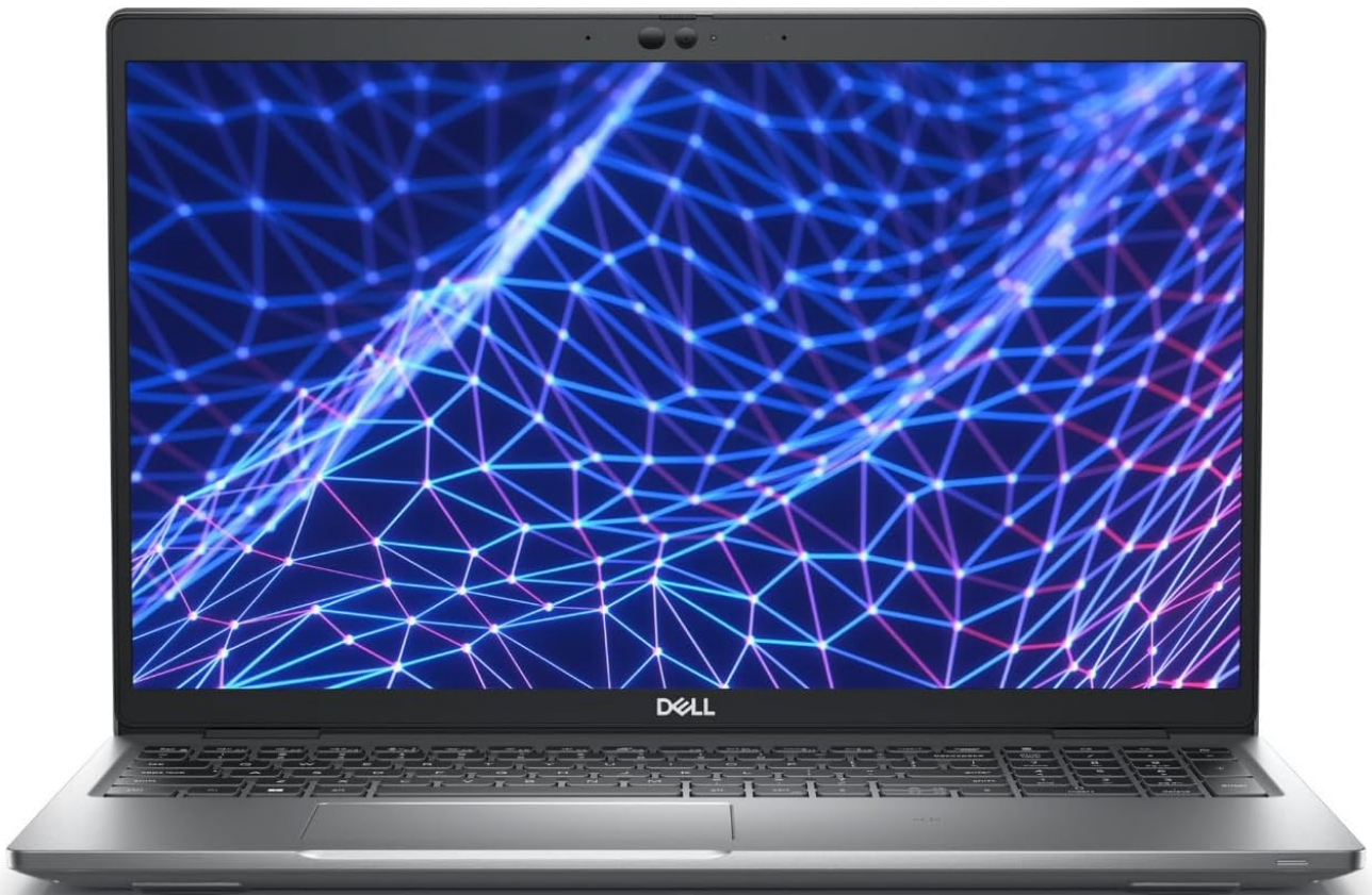
Figure 3.1: Front view of the Dell Latitude 5530 laptop, showcasing the 15-inch display and keyboard.