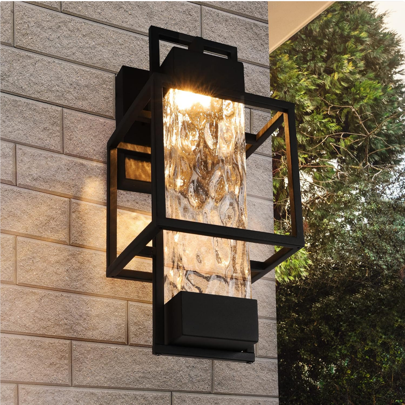
Image: The light fixture installed on an exterior brick wall, illuminating the area.