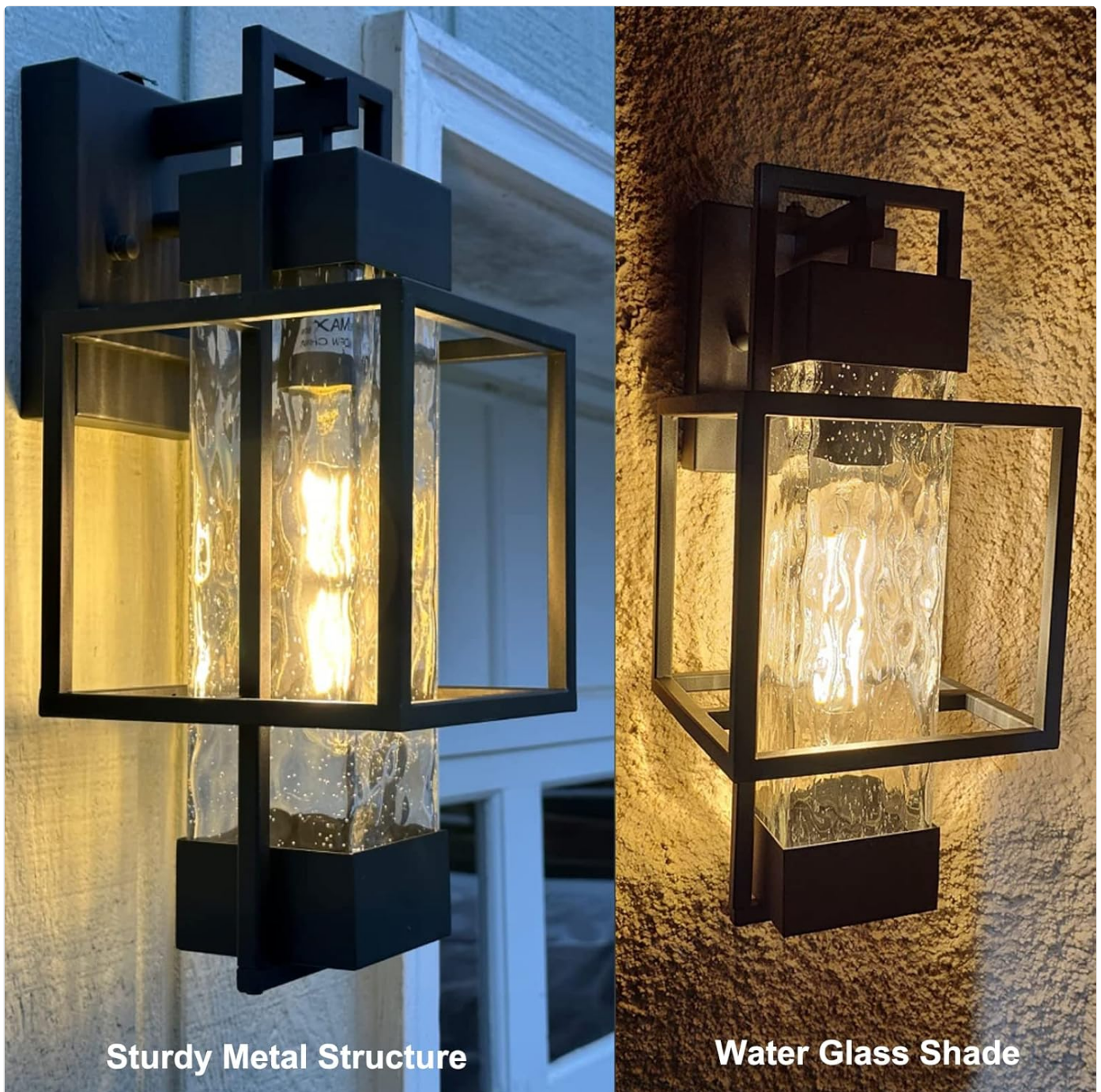
Image: A split image showing a close-up of the light fixture's sturdy metal structure on the left and the unique water glass shade on the right.