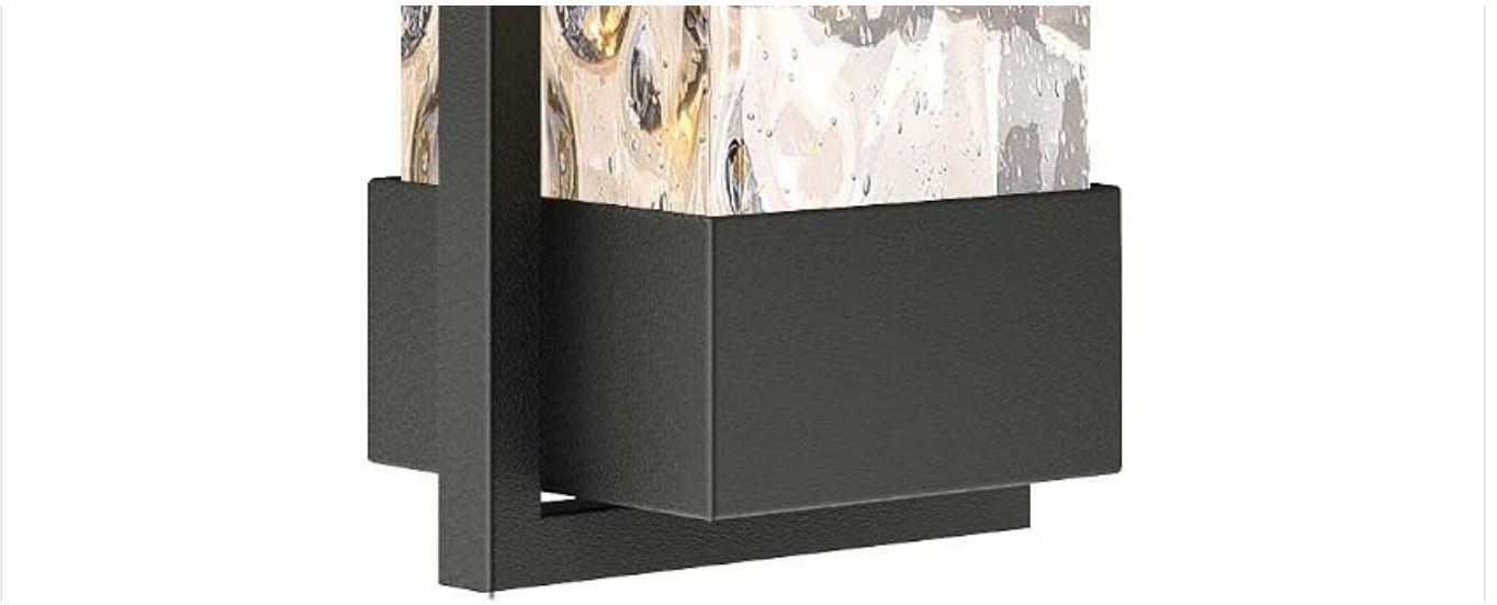
Image: Front view of the PARTPHONER Modern Outdoor Light Fixture, showcasing its black frame and textured glass.