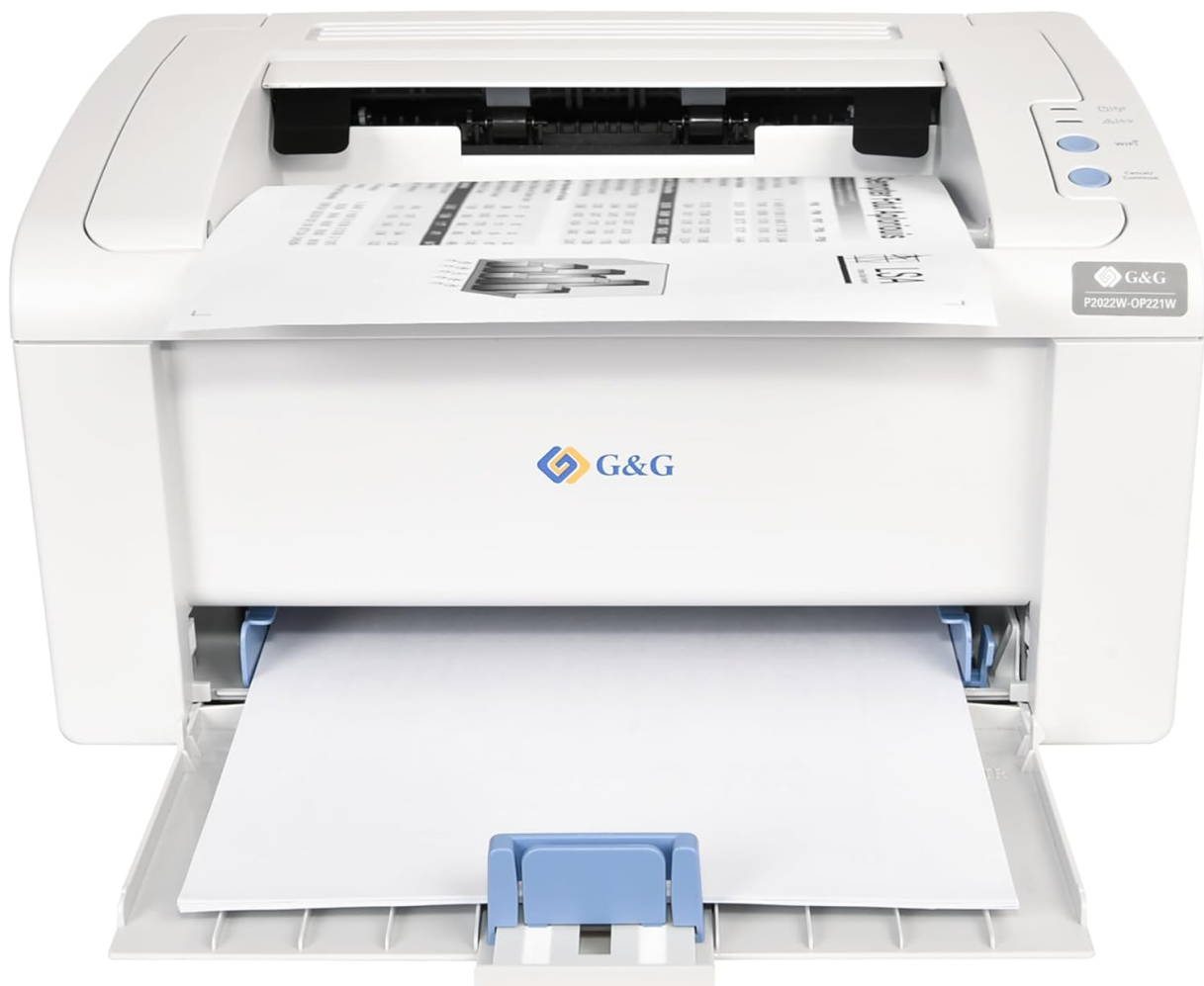
Image: The G&G P2022W printer with paper loaded in both the input and output trays, demonstrating readiness for printing.

Open the paper tray and load paper. The printer has a 150-sheet paper capacity. Ensure the paper guides are adjusted to fit the paper size to prevent jams.