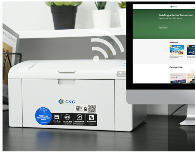
Image: Visual guide detailing the process of connecting the G&G P2022W printer to a Wi-Fi router using a mobile device.