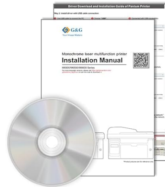
CD and User Manuals

Image: A G&G GT202 toner cartridge, designed for the P2022W monochrome laser printer.