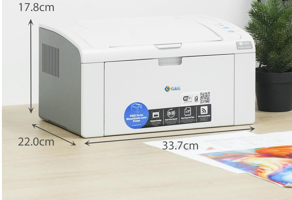
Image: G&G P2022W printer with its dimensions (33.7cm width, 22.0cm depth, 17.8cm height) clearly marked.