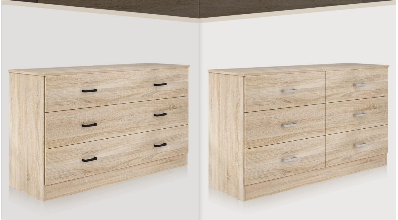
Image 3.2: The dresser shown with two different handle options (black and silver) for personalized styling.