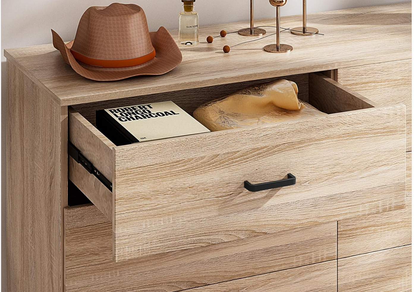
Image 4.1: An open drawer demonstrating the ample storage capacity for various items.