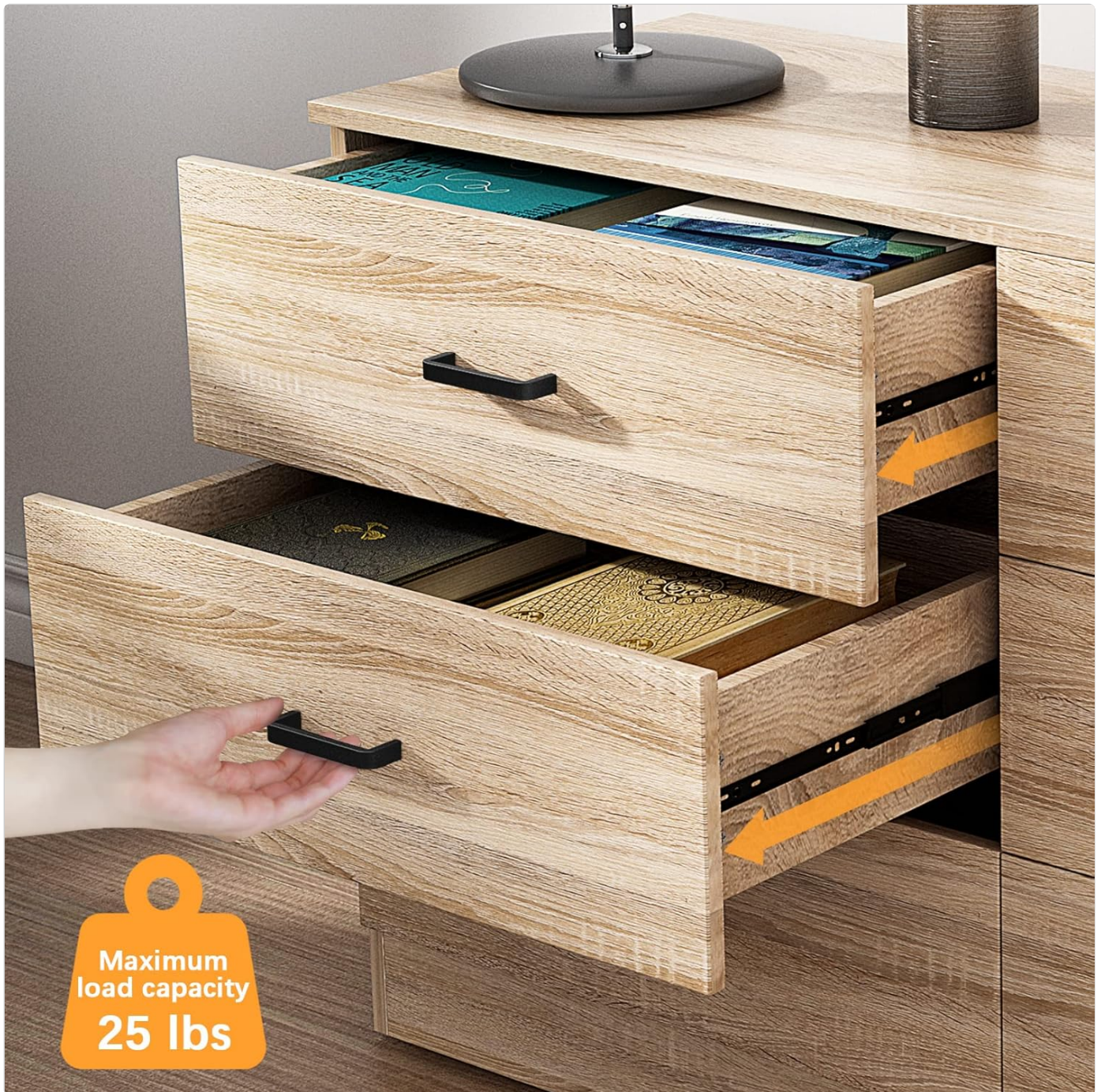
Image 2.1: Illustration of open drawers, indicating a maximum load capacity of 25 lbs per drawer.