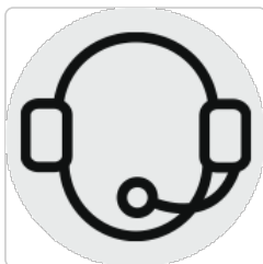
Image 8.1: Representation of customer support services available for assistance.