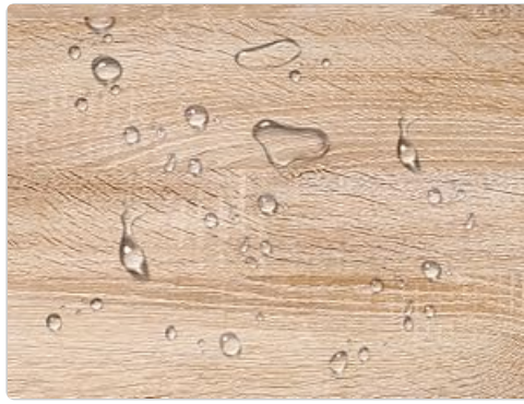
Image 5.1: Close-up of the dresser surface with water droplets, highlighting its waterproof and easy-to-clean properties.