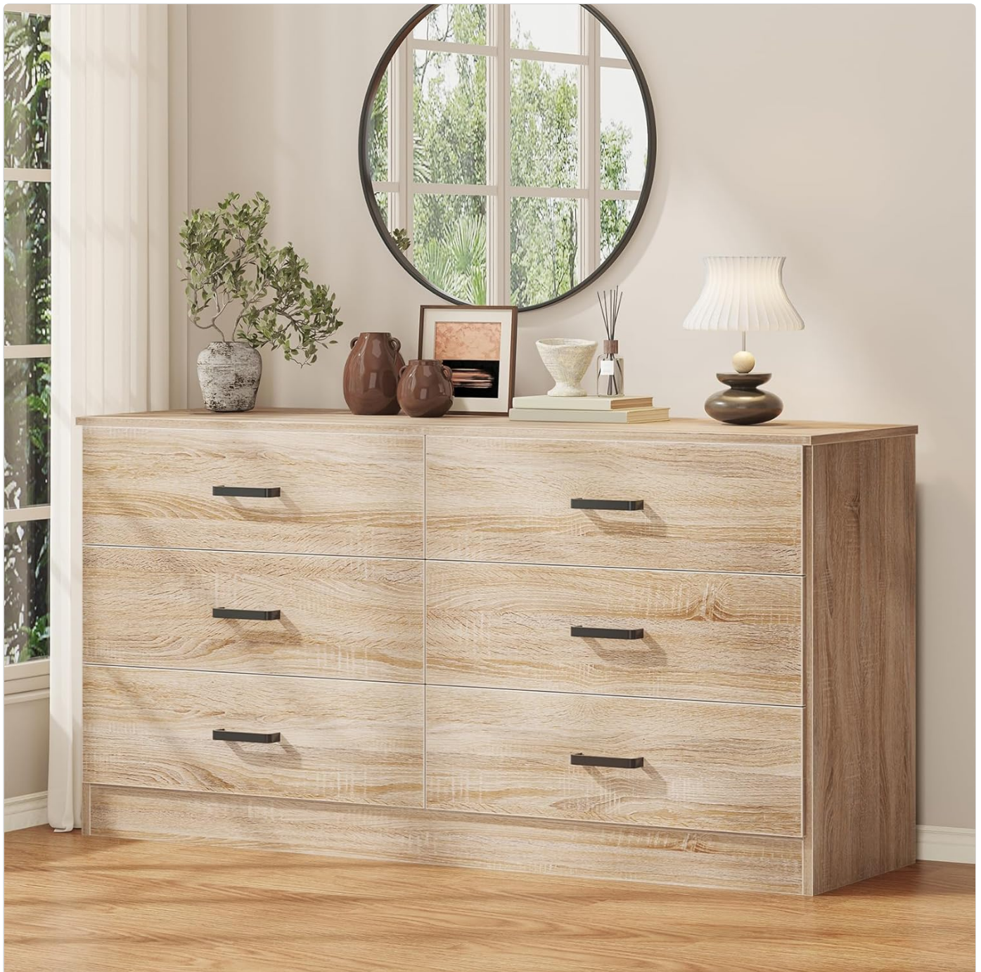
Image 1.1: The Bigbiglife 6-Drawer Double Dresser in Light Oak, featuring a modern design with black metal handles.