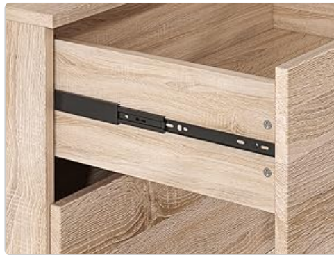
Image 3.1: Detail of the pre-installed drawer slide mechanism, designed for smooth operation.