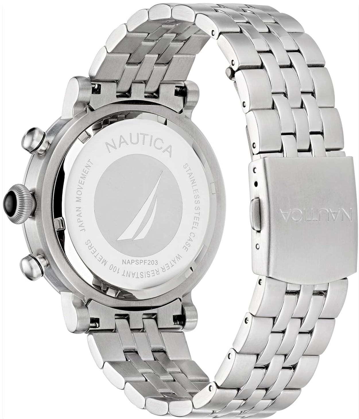
Image: Rear view of the Nautica Spettacolare Reissue Watch, displaying the screw-down case back with engravings for water resistance (100 meters) and model number (NAPSPF203).