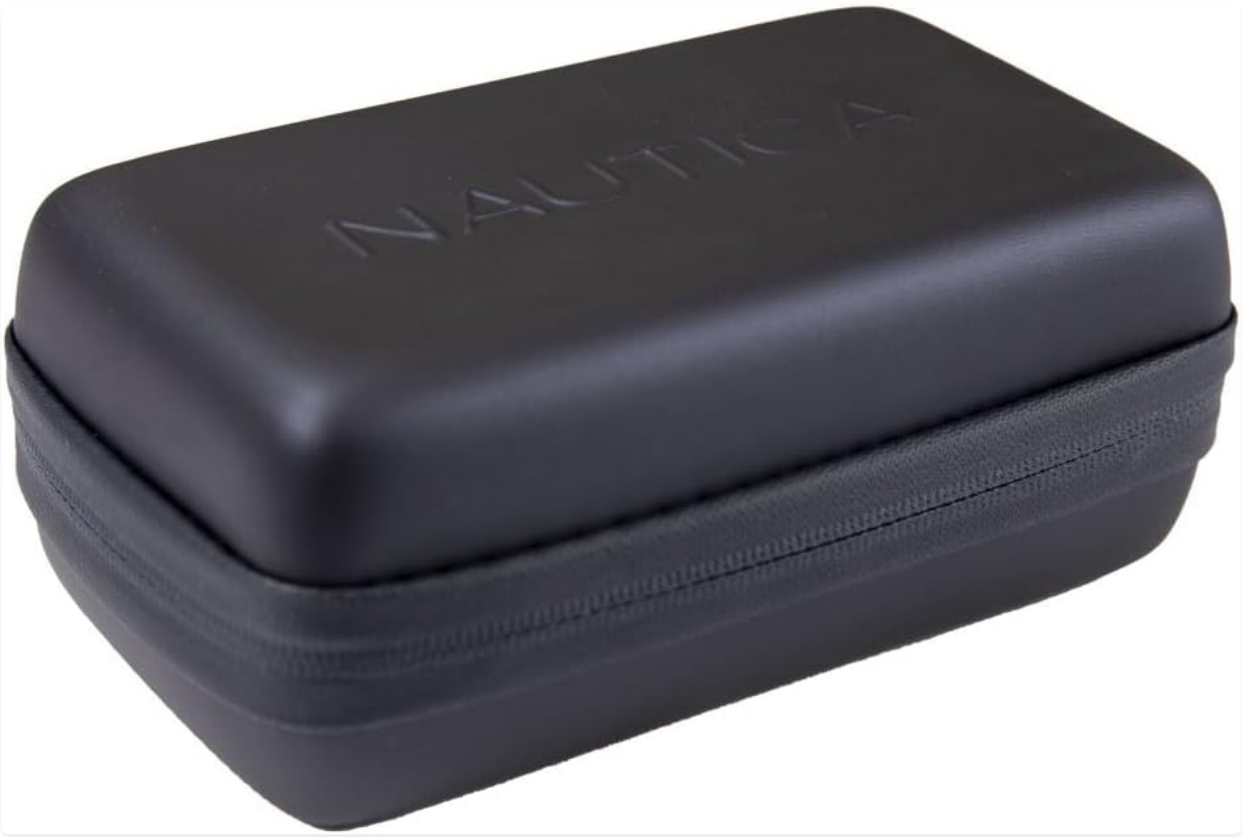
Image: The black Nautica branded watch case, designed for protection and storage of the timepiece.