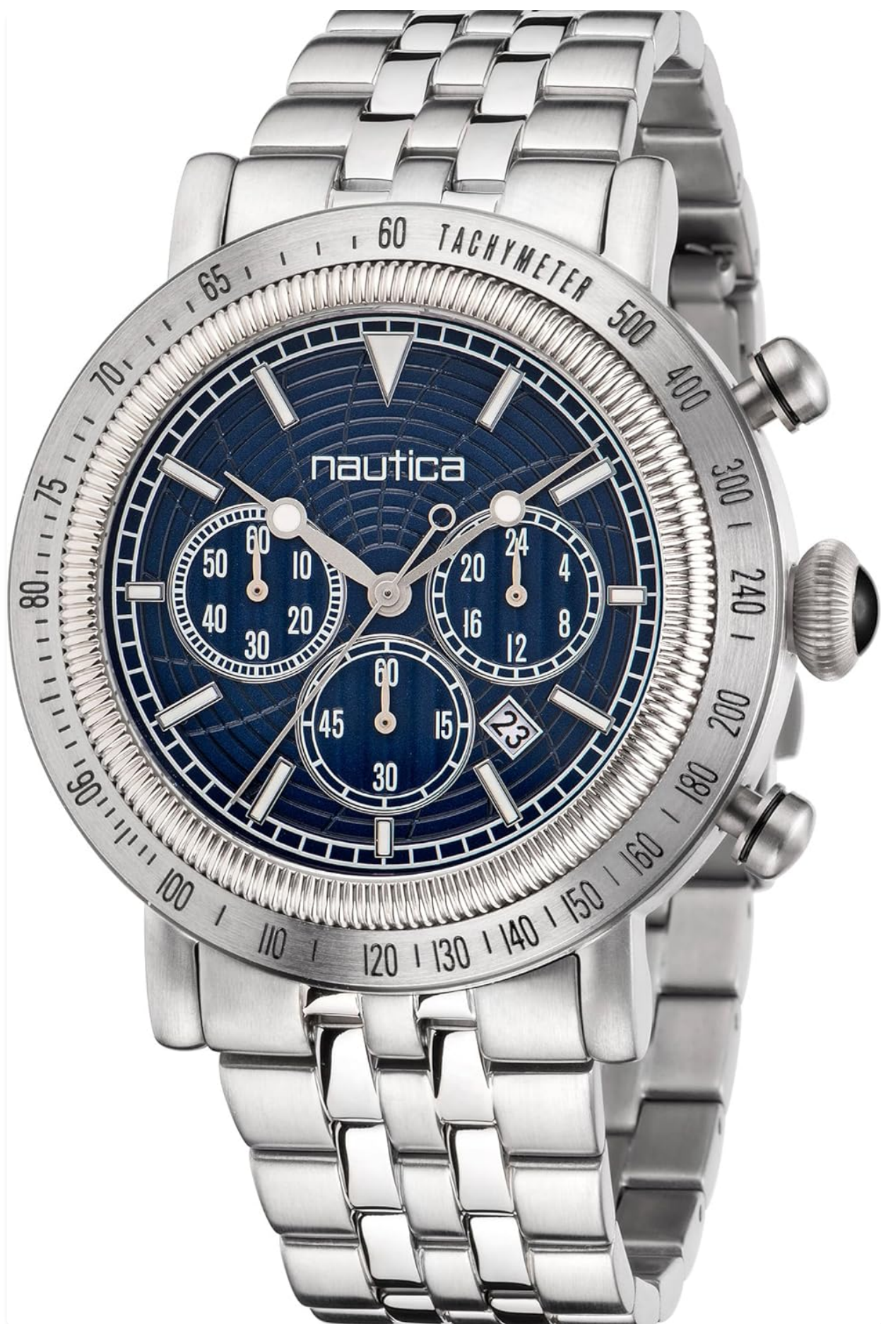
Image: Front view of the Nautica Spettacolare Reissue Watch, showcasing its blue dial, chronograph subdials, and silver-tone stainless steel case and bracelet.