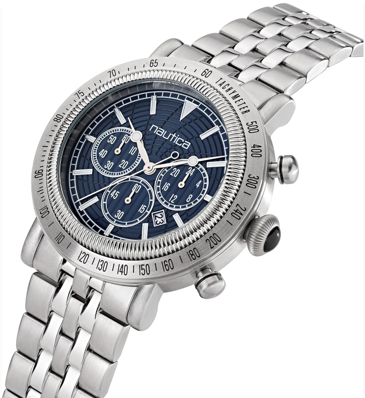
Image: Angled view of the Nautica Spettacolare Reissue Watch, highlighting the crown and the two chronograph pushers on the right side of the case.