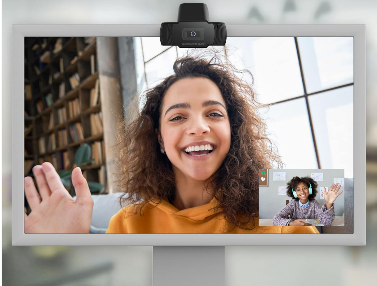
Figure 2.2: The webcam in use, mounted on top of a monitor, demonstrating its high-resolution video capture capability for online meetings.

30 frames per second high-resolution video capture for crystal-clear images and streaming video.