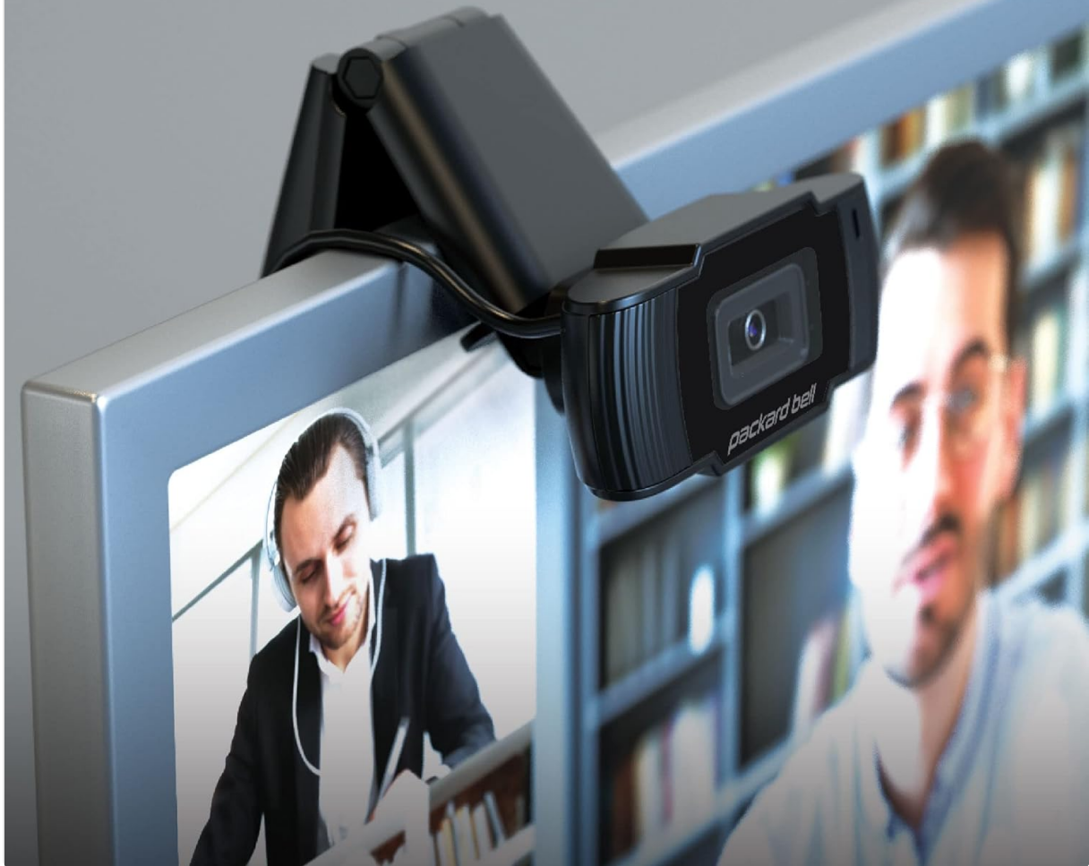
Figure 3.1: The compact design of the webcam, shown mounted on a monitor, illustrating its minimal footprint.

Compact size will not take up space on your desktop.