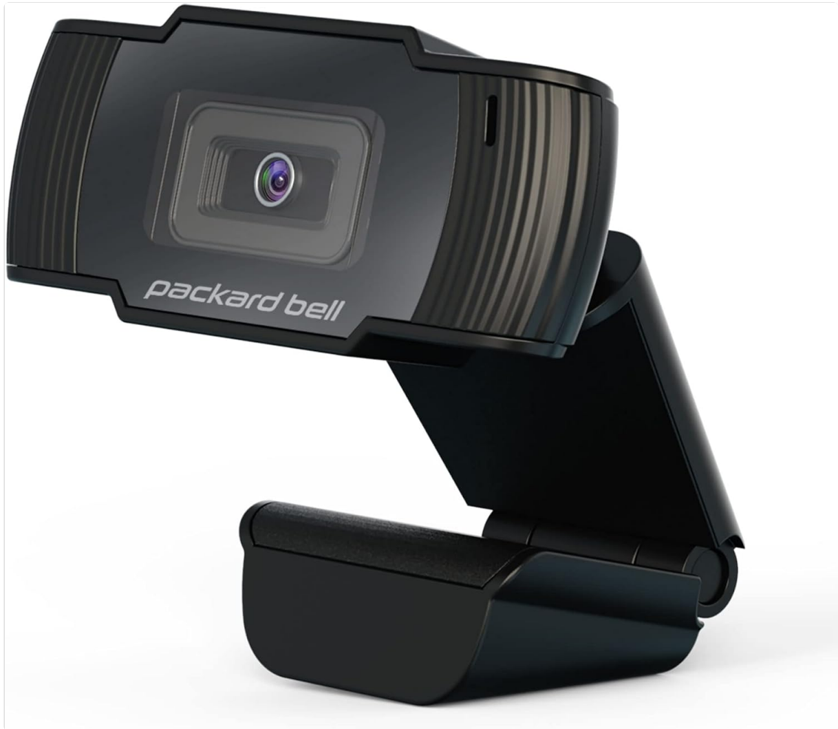
Figure 2.1: Front view of the Packard Bell 1080p Desktop Webcam, showing the lens and integrated stand.