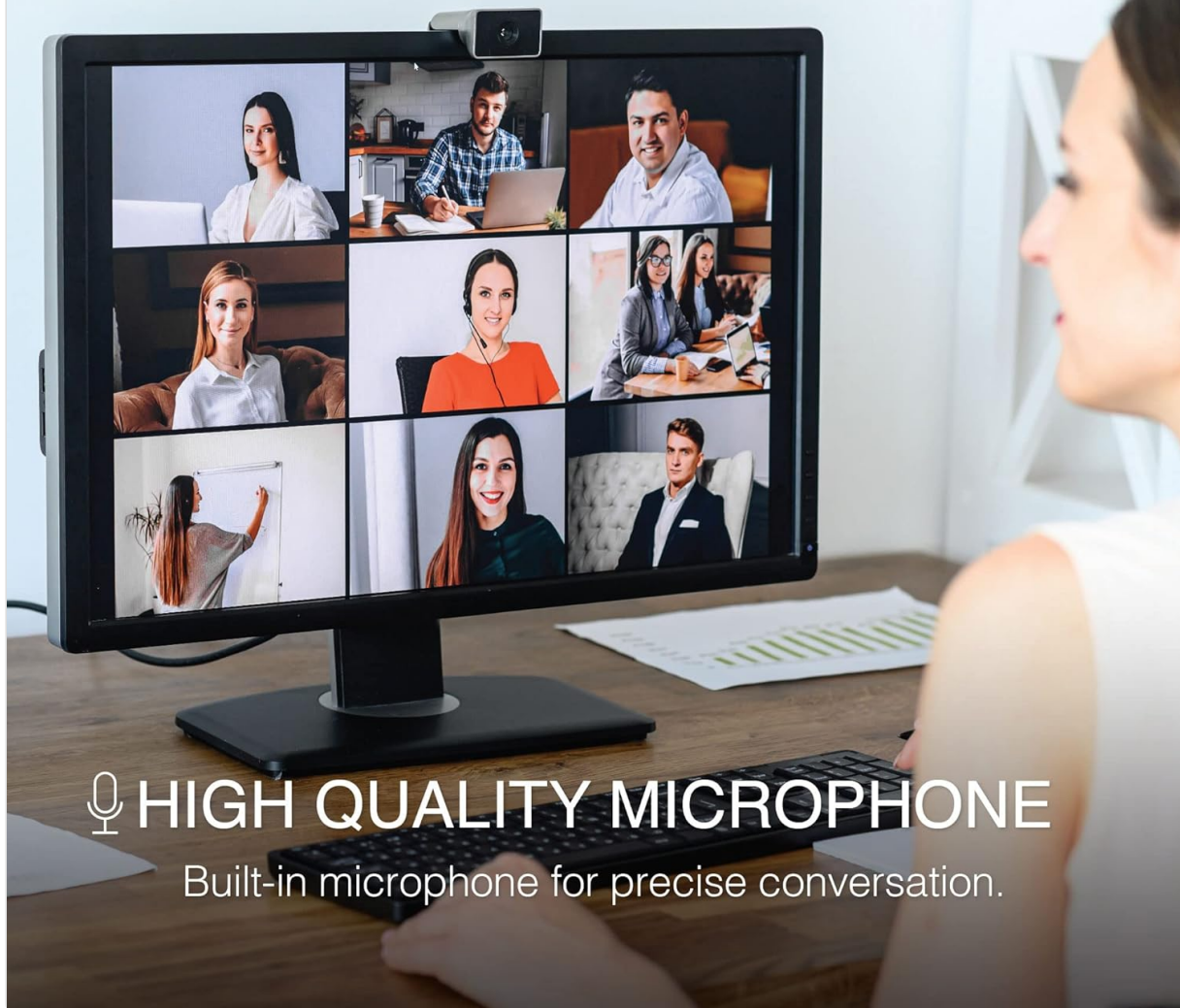
Figure 2.3: Illustration of the webcam's built-in microphone, providing clear audio for video conferencing.