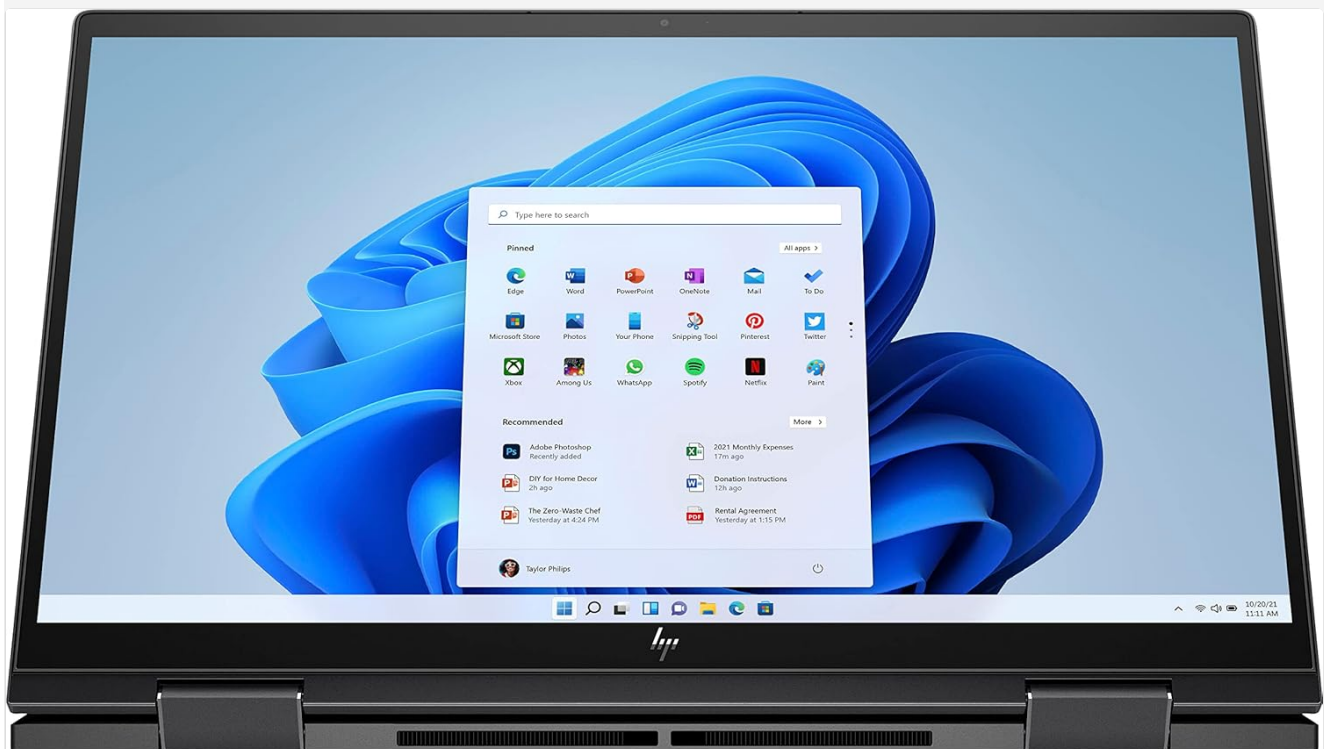
Image 2.1: Close-up view of the laptop screen showing the Windows 11 Start menu.

Follow the on-screen prompts to complete the Windows 11 initial setup. This process includes selecting your region, keyboard layout, connecting to a Wi-Fi network, and creating a user account. An internet connection is recommended for updates during this phase.