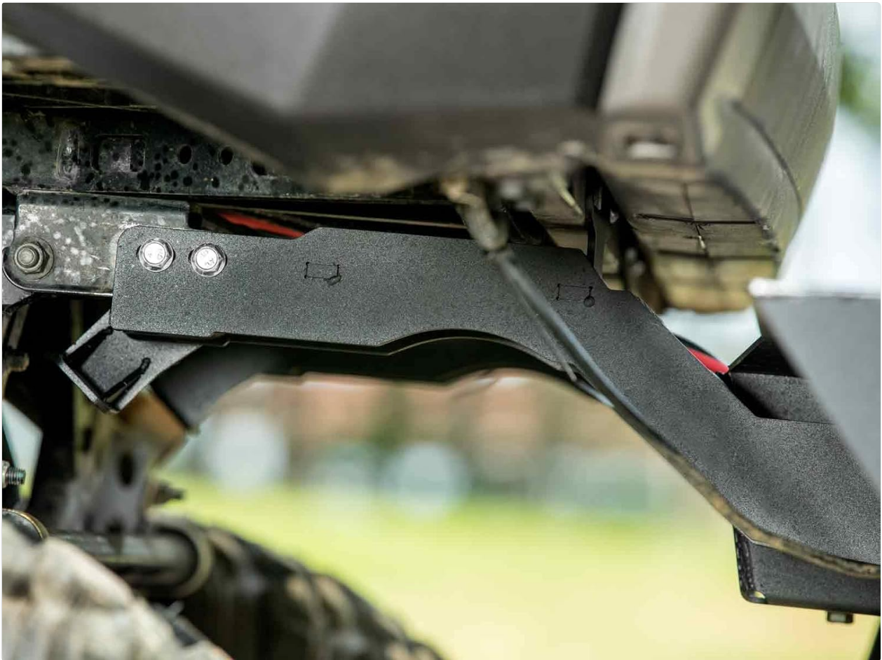
Figure 3: Close-up of the bumper's mounting bracket.