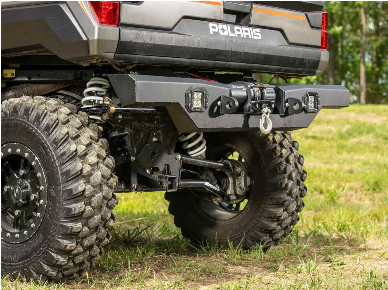
Figure 4: Rear bumper with winch and D-ring mounts.