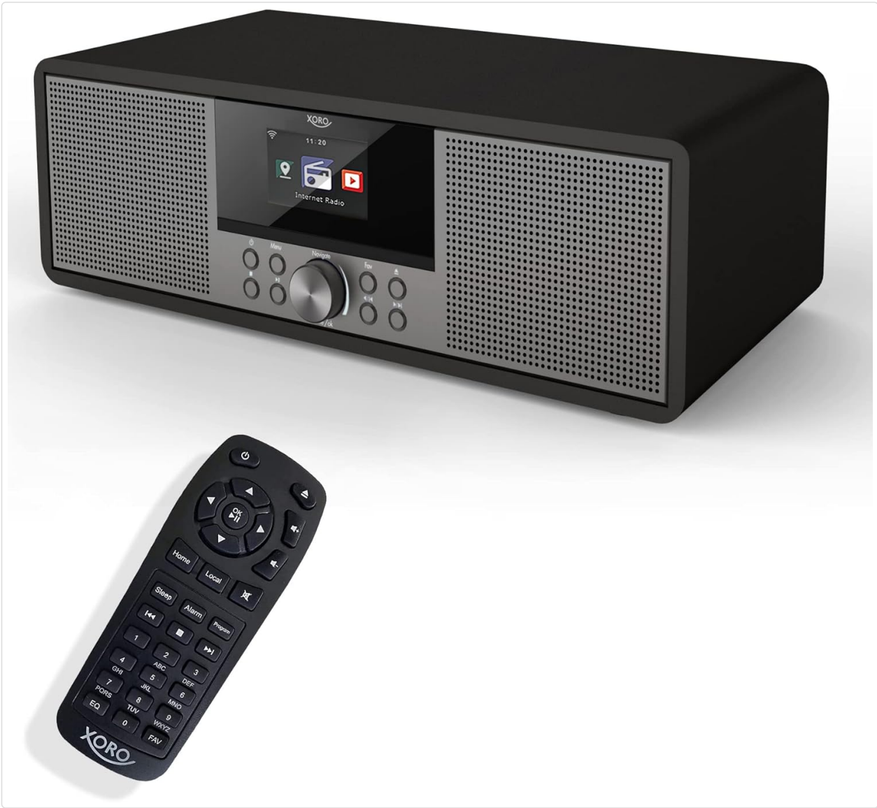
Image 1: Front view of the XORO HMT 600 V2 Internet Radio with its remote control. The radio features a central display, control buttons, and speaker grilles on both sides. The remote control provides convenient access to various functions.

The XORO HMT 600 V2 unit consists of the main radio unit and a remote control. Familiarize yourself with the layout for optimal use.