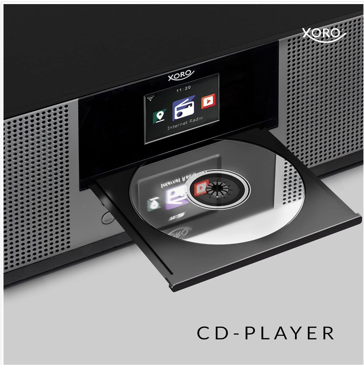
Image 3: Close-up view of the integrated CD player tray on the XORO HMT 600 V2. The tray is shown open, ready to accept a compact disc for playback.