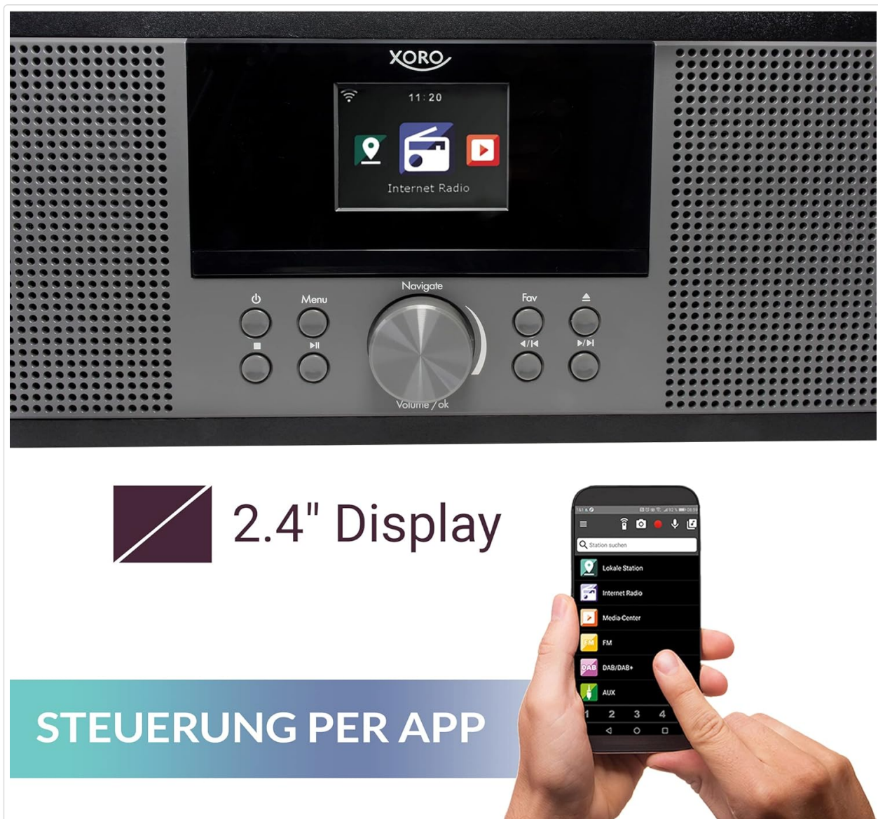
Image 4: The 2.4-inch color display of the XORO HMT 600 V2, showing menu options. The image also illustrates the possibility of controlling the device via a dedicated smartphone application, offering an alternative interface for navigation and function selection.

The XORO HMT 600 V2 can be operated using the buttons on the front panel or the included remote control. The central navigation dial and surrounding buttons allow for menu navigation, volume control, and function selection.