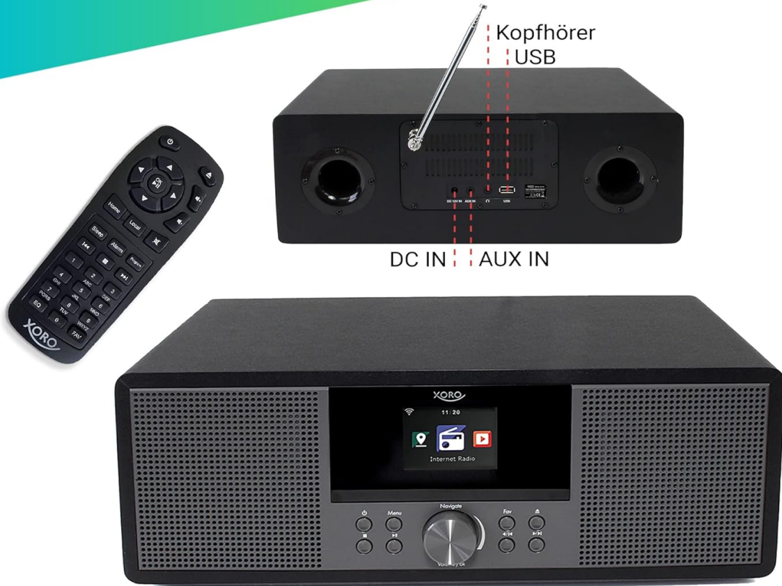
Image 2: Rear view of the XORO HMT 600 V2, highlighting the connectivity ports. These include a headphone jack, USB port, DC IN for power, and an AUX IN port for external audio sources. An extendable antenna is also visible for improved radio reception.