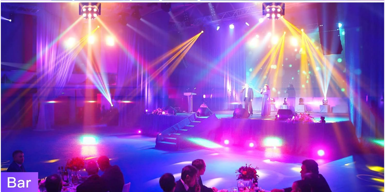
Figure 3.2: Examples of the diverse color patterns and combinations achievable with the 4-in-1 RGBW LEDs.