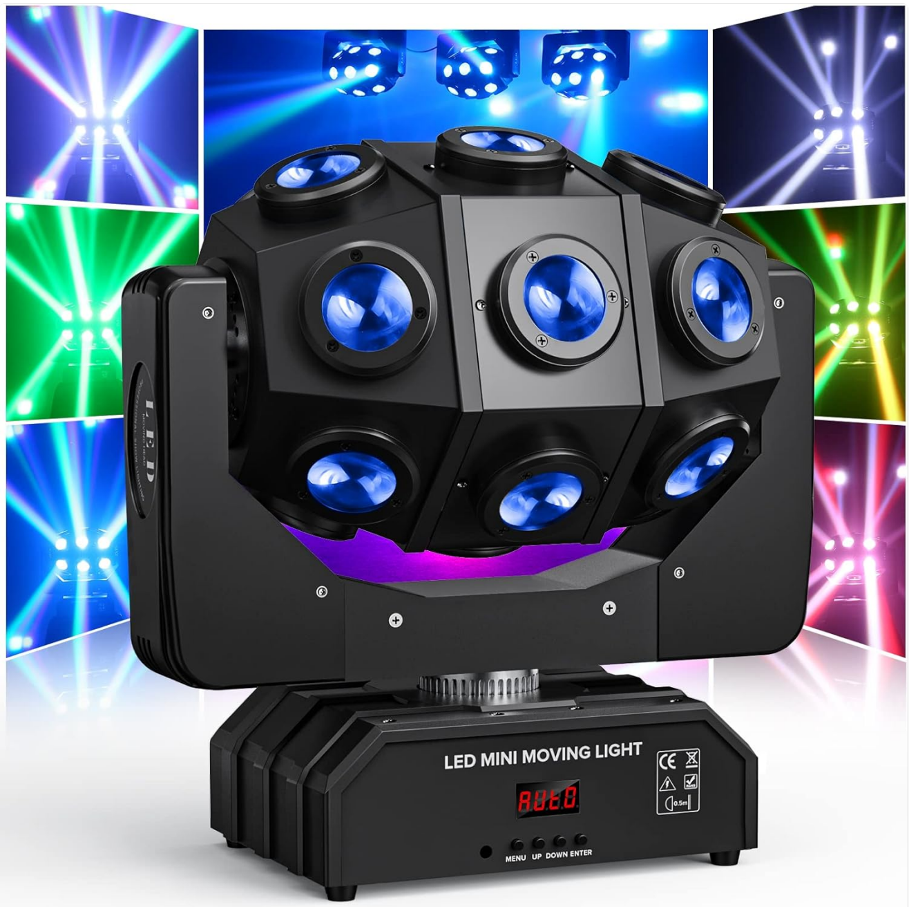
Figure 1.1: The FODEXAZY 180W Moving Head Light, showcasing its compact design and multiple light sources.