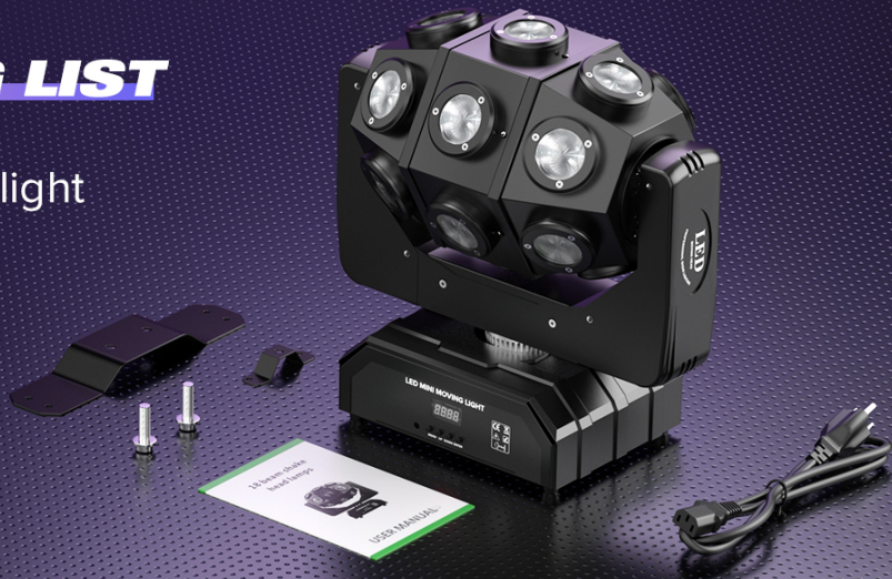
Figure 2.1: Visual representation of the items included in the product packaging.