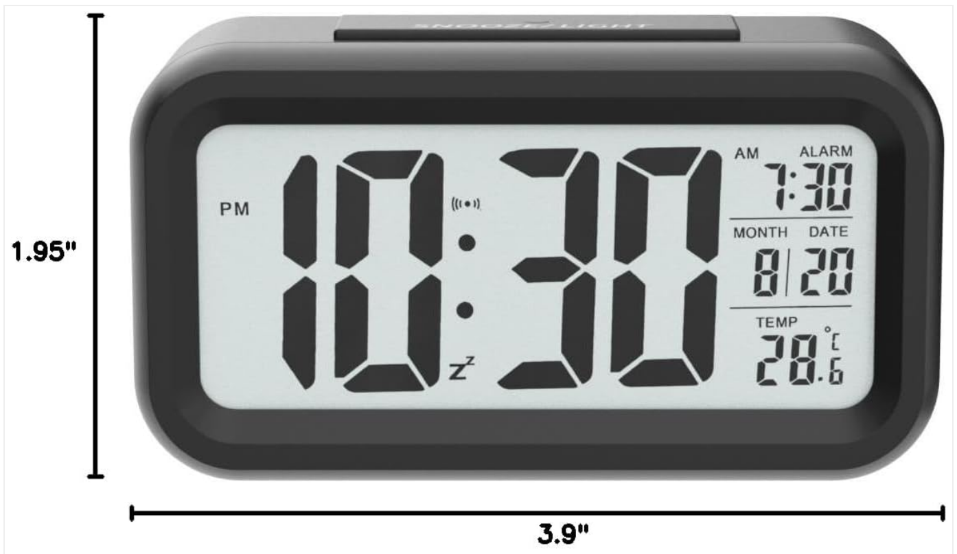
Figure 7: Product Dimensions