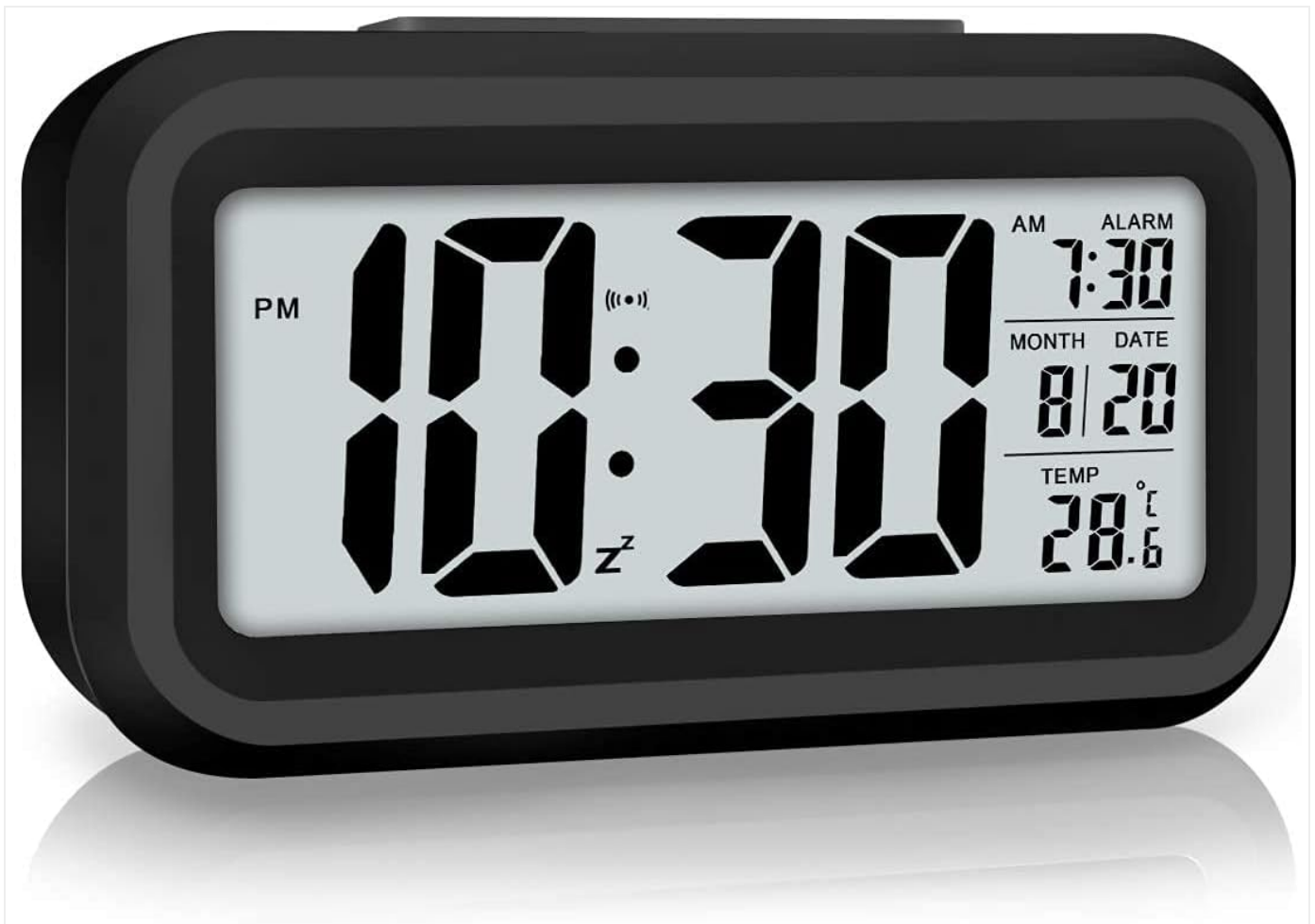
Figure 1: Jisile Digital Alarm Clock Front View

Thank you for choosing the Jisile Digital Alarm Clock, Model 007. This manual provides detailed instructions for the setup, operation, and maintenance of your new alarm clock. Please read this manual thoroughly before use to ensure proper functionality and to maximize your product experience.