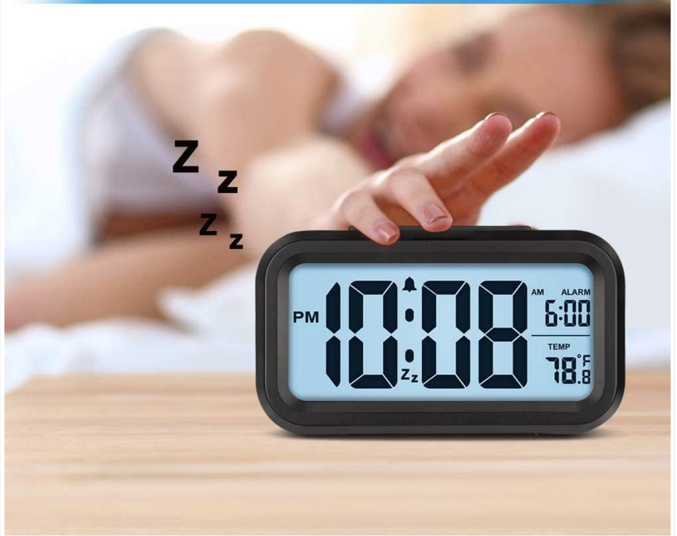
Figure 4: Snooze Button Operation

Top button can be continually pressed to get an extra 8-minute nap and light the clock for 10s