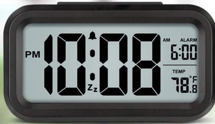
12-hour (Standard Time)