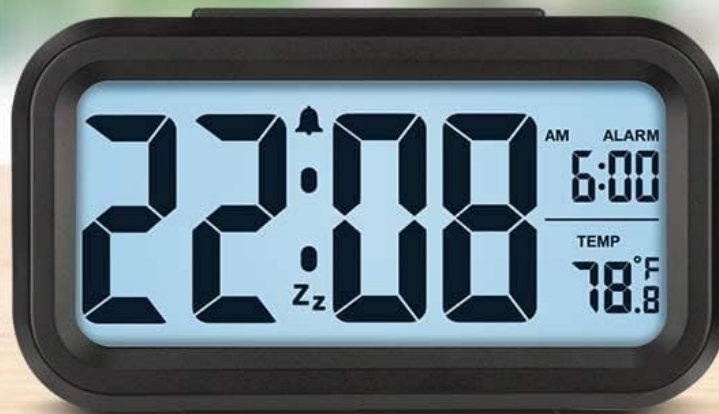
24-hour (Military Time)