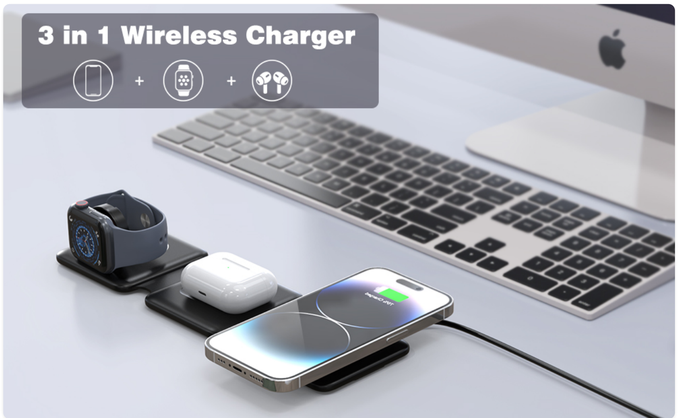
Figure 8: The improved design for stable charging with various phone models.