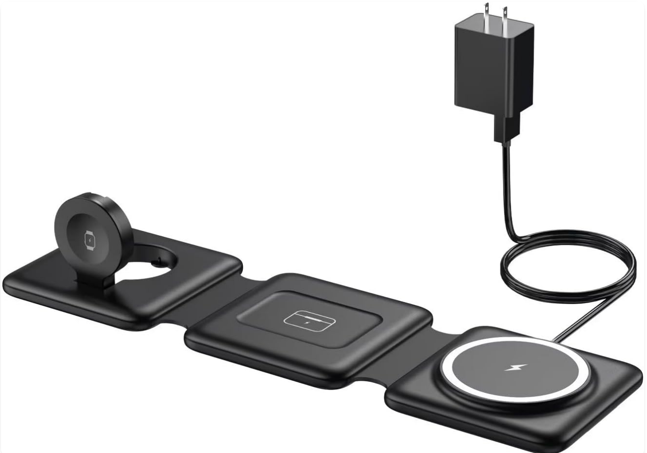
Figure 1: The Iseyyox 3-in-1 Foldable Magnetic Wireless Charging Station with its power adapter.

Thank you for choosing the Iseyyox 3-in-1 Foldable Magnetic Wireless Charging Station. This versatile device is designed to efficiently charge your iPhone (12 series and above), Apple Watch, and AirPods simultaneously. Its compact and foldable design makes it ideal for both home use and travel. Please read this manual carefully to ensure proper setup and operation.