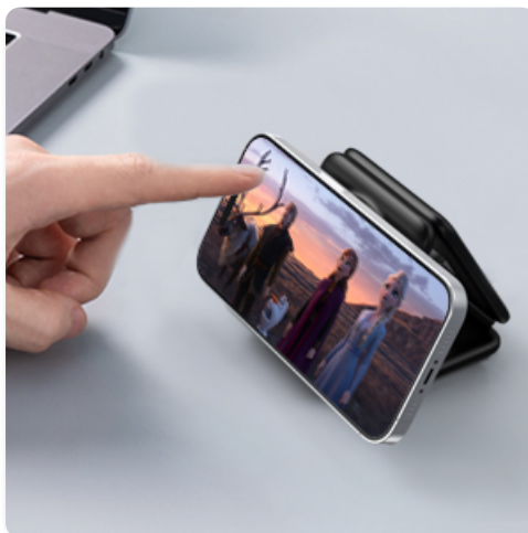
Figure 3: Placing a device on the magnetic charging pad for automatic alignment.