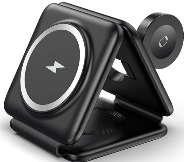
Figure 4: Charging an iPhone, Apple Watch, and AirPods simultaneously.