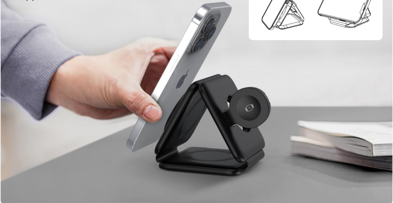
Figure 7: Understanding magnetic auto-alignment for efficient charging.

Support horizontal and vertical installation