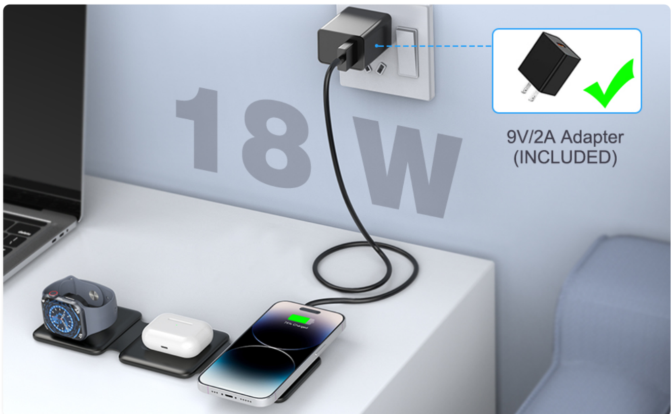
Figure 6: The charging station's compact, foldable design for travel.