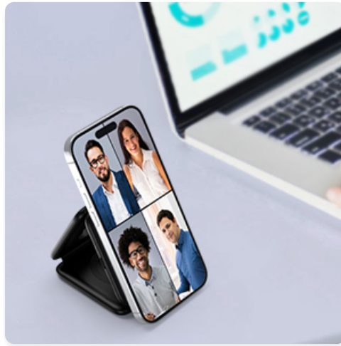
Figure 5: The charging station configured as a phone stand.