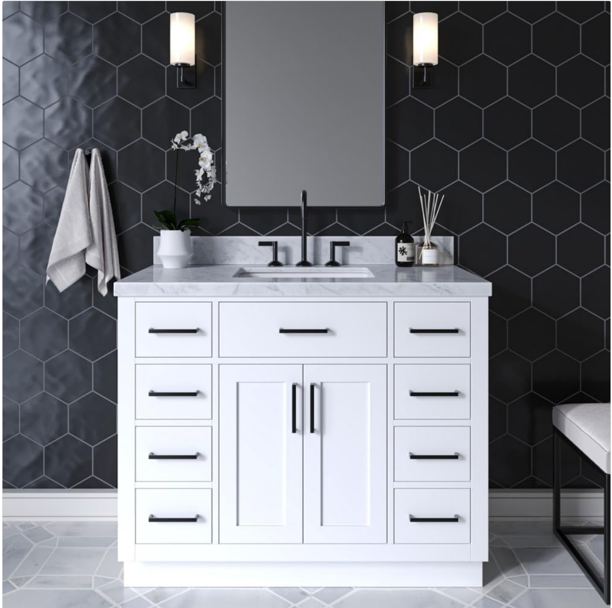
Front view of the ARIEL Hepburn 43 Inch Bathroom Vanity.

featuring a 1.5-inch edge Italian Carrara Marble top. It includes a rectangular ceramic under-mount sink, soft-closing doors, and nine full-extension dovetail drawers for ample storage.