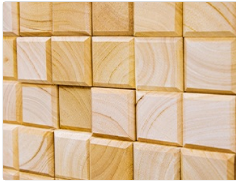
Solid Wood Construction