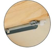
Soft closing doors and drawers