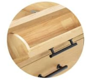
Tilt out drawer