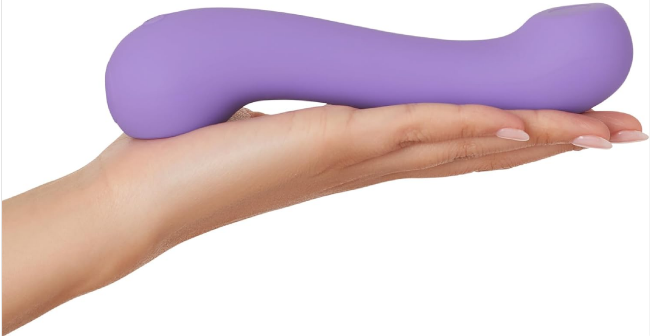
Figure 7: The plusOne Thumping Arouser held in a hand, illustrating its approximate length of 6.7 inches (17 cm).