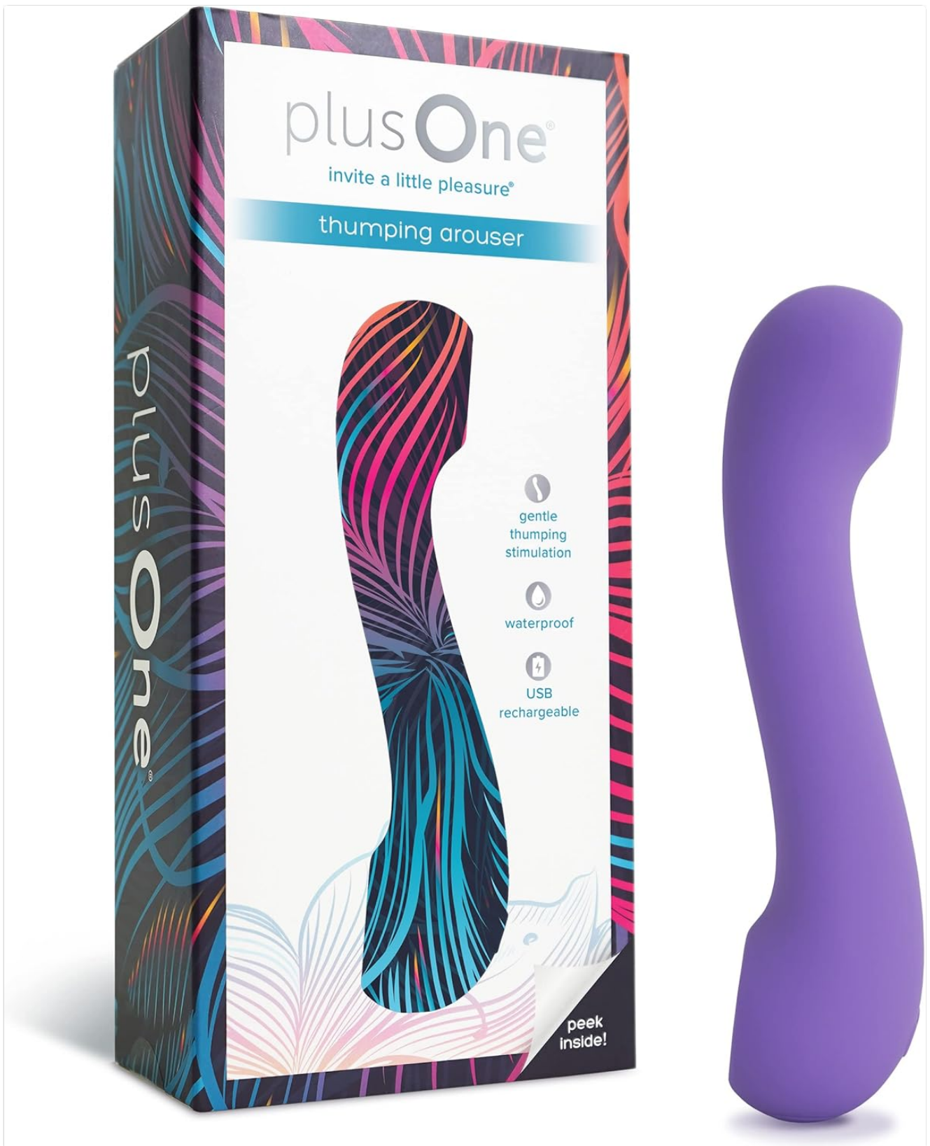
Figure 1: The plusOne Thumping Arouser shown with its retail packaging.