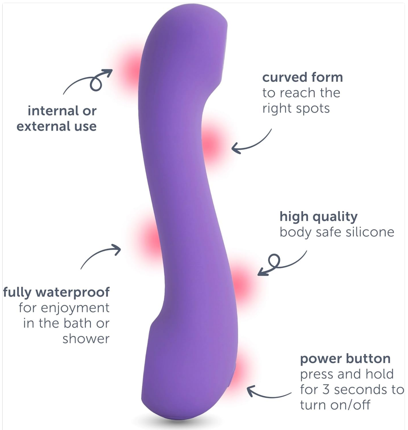
Figure 2: Key features of the plusOne Thumping Arouser, including its curved form, suitability for internal or external use, high-quality body-safe silicone, full waterproof design, and power button location.