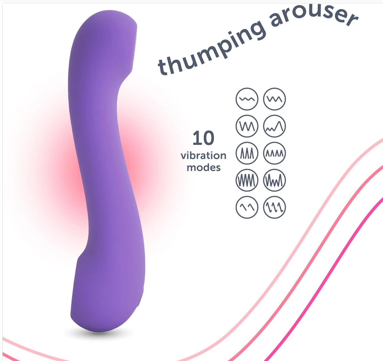
Figure 5: The plusOne Thumping Arouser illustrating its 10 distinct vibration modes, which can be cycled through by pressing the power button.