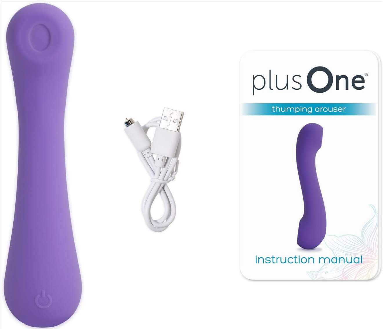
Figure 3: The plusOne Thumping Arouser device, USB charging cable, and instruction manual.