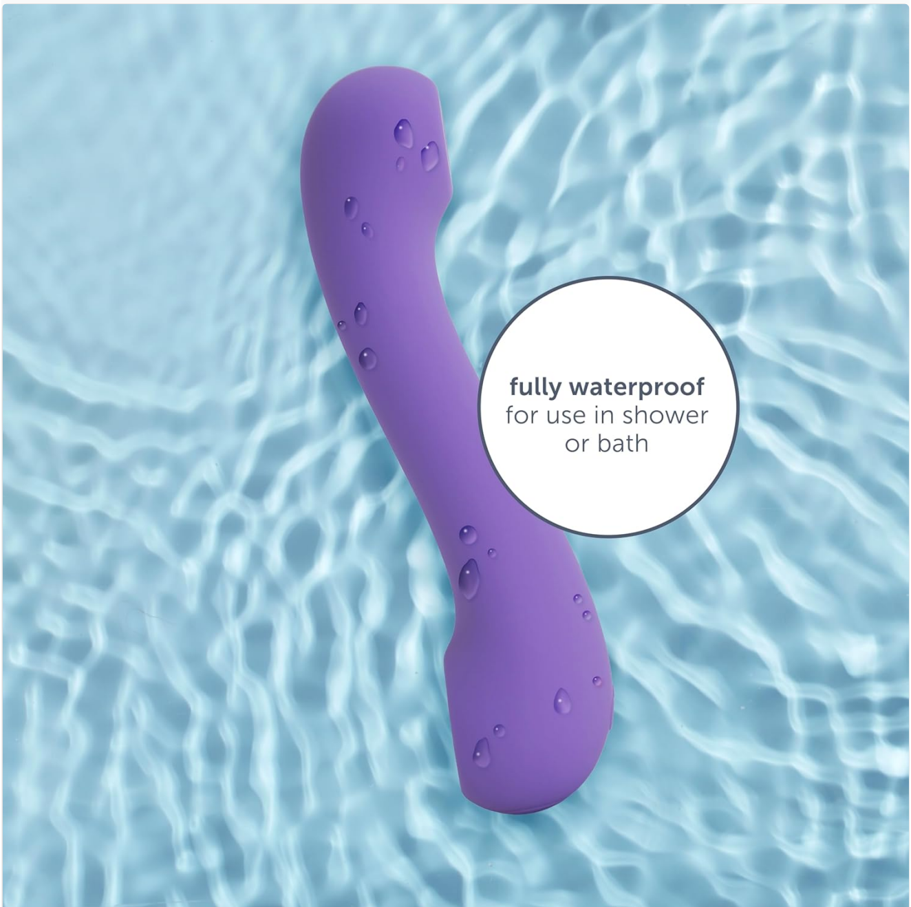
Figure 6: The plusOne Thumping Arouser submerged in water, demonstrating its fully waterproof capability for easy cleaning and use in wet environments.