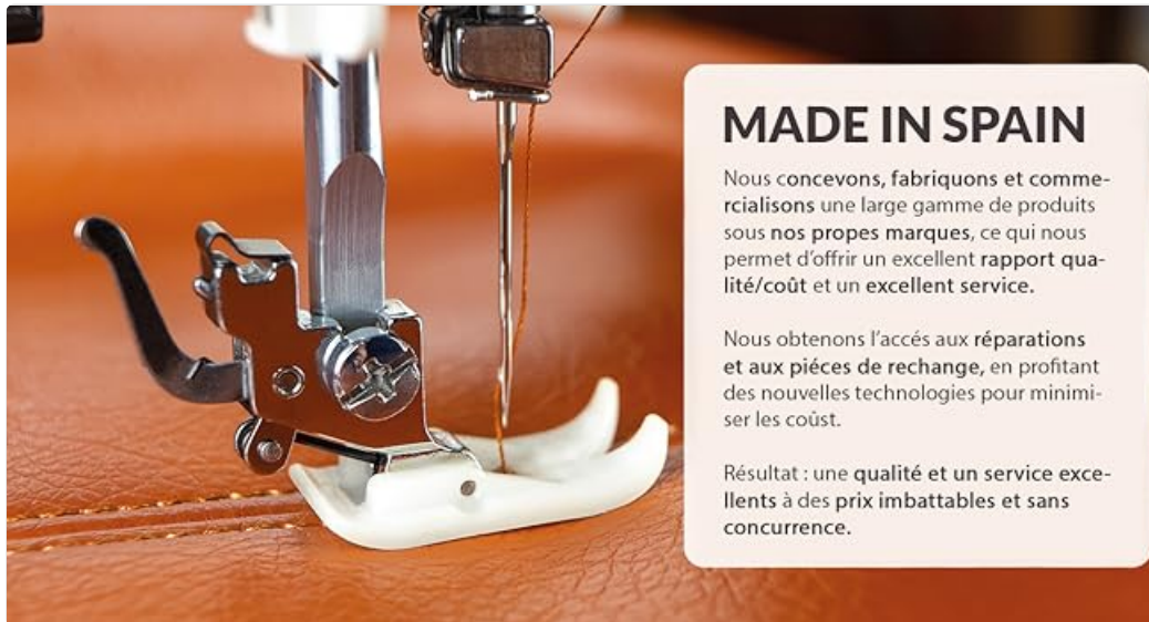
Image: A sewing machine with text highlighting the product's origin and quality manufacturing in Spain.

Image: An illustrative diagram detailing the dimensions and key features of the DHOME headboard, including thickness and leg height.