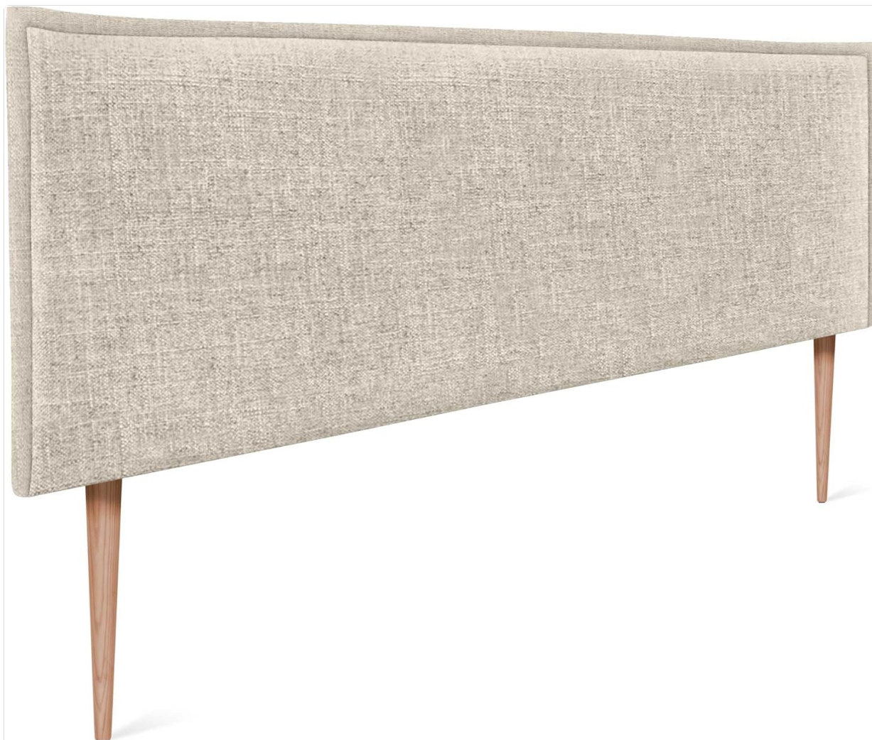
Image: The DHOME 160x105cm Beige Linen Headboard, featuring its natural linen upholstery and wooden legs.