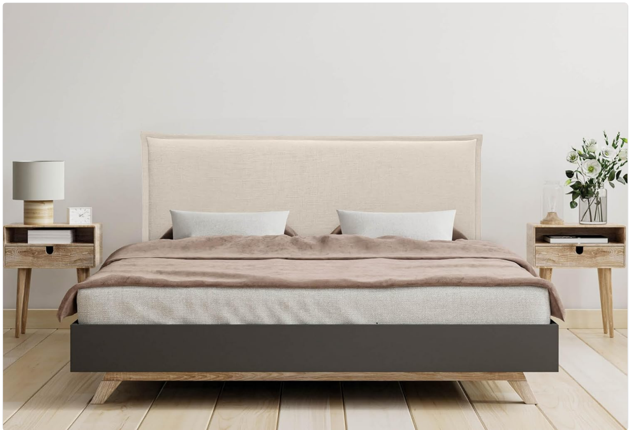
Image: The DHOME headboard positioned behind a bed in a modern bedroom setting.