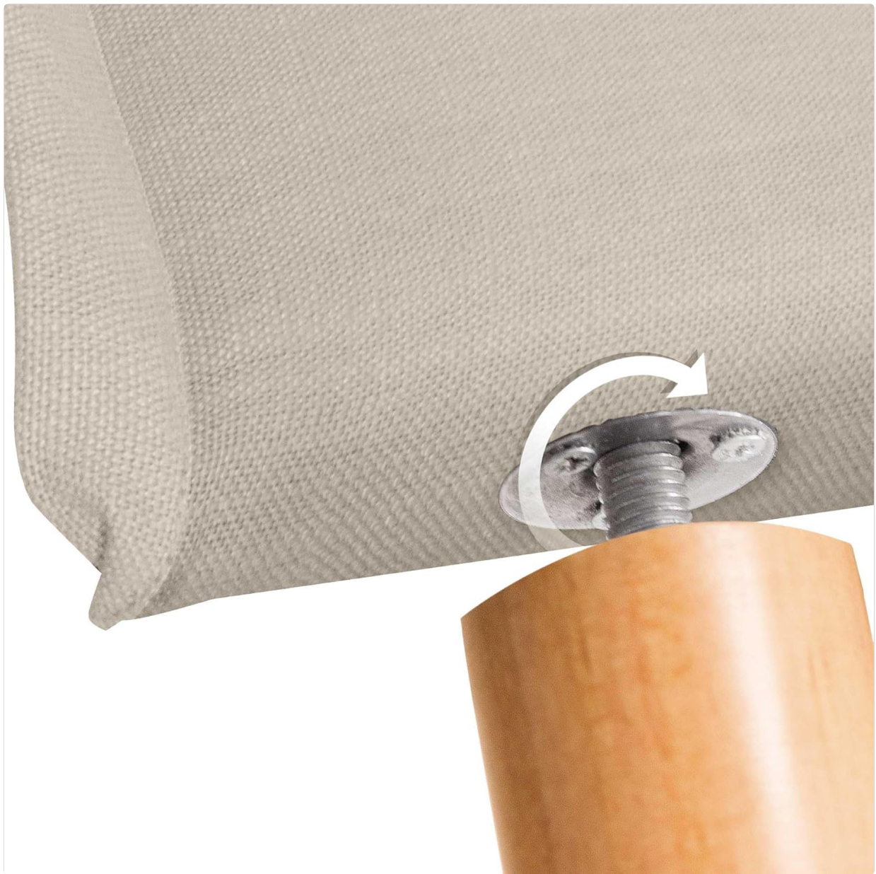
Image: Detail of the leg attachment mechanism, showing the screw plate and wooden leg.