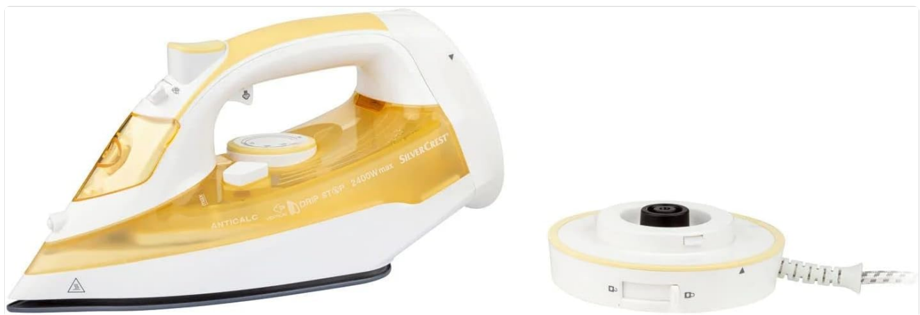
Image 3.1: The Silvercrest SDBK 2400 E1 Steam Iron detached from its 360° cordless base station.