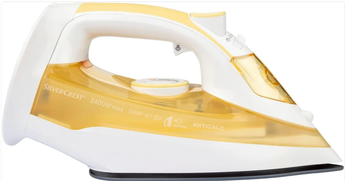
Image 1.1: The Silvercrest SDBK 2400 E1 Steam Iron, showcasing its sleek design and yellow water tank.

This user manual provides important information for the safe and efficient operation of your SILVERCREST SDBK 2400 E1 Steam Iron. Please read these instructions carefully before first use and keep them for future reference. This appliance is designed for domestic use only.