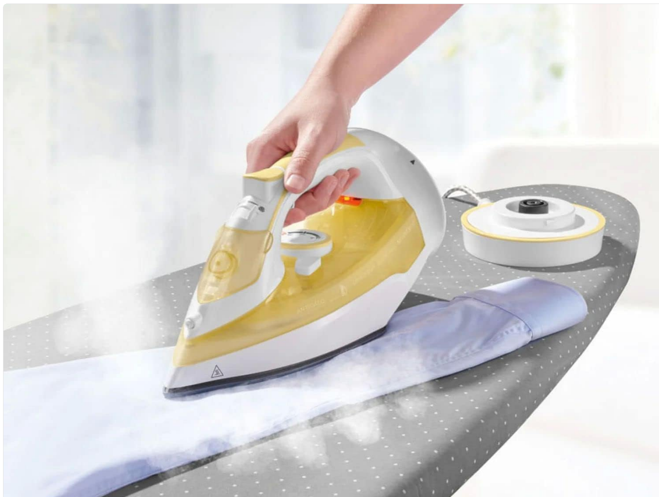
Image 5.3: A close-up view of the Silvercrest SDBK 2400 E1 Steam Iron in action, highlighting the steam output from the soleplate.