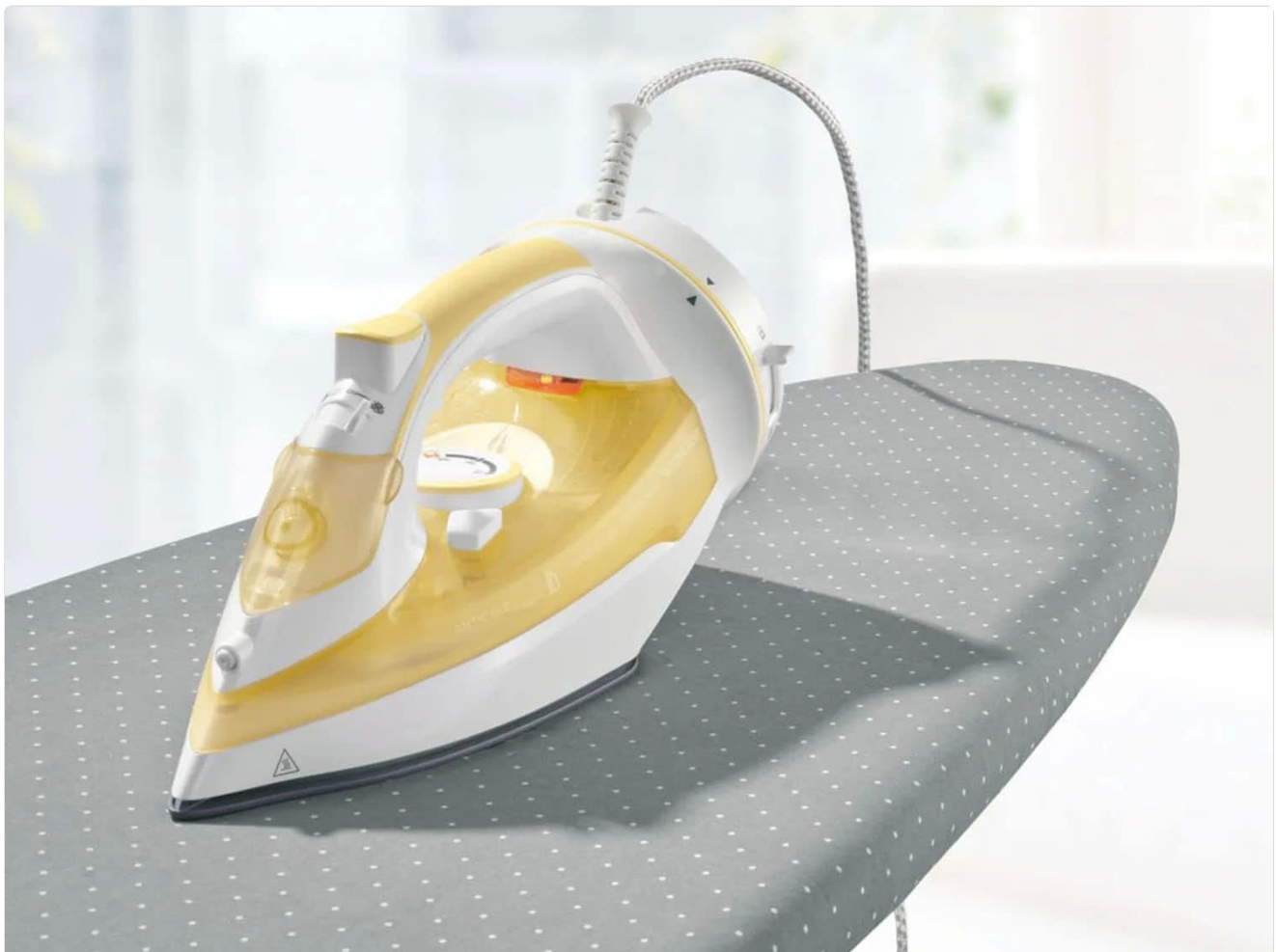
Image 5.1: The Silvercrest SDBK 2400 E1 Steam Iron positioned on an ironing board, ready for use.