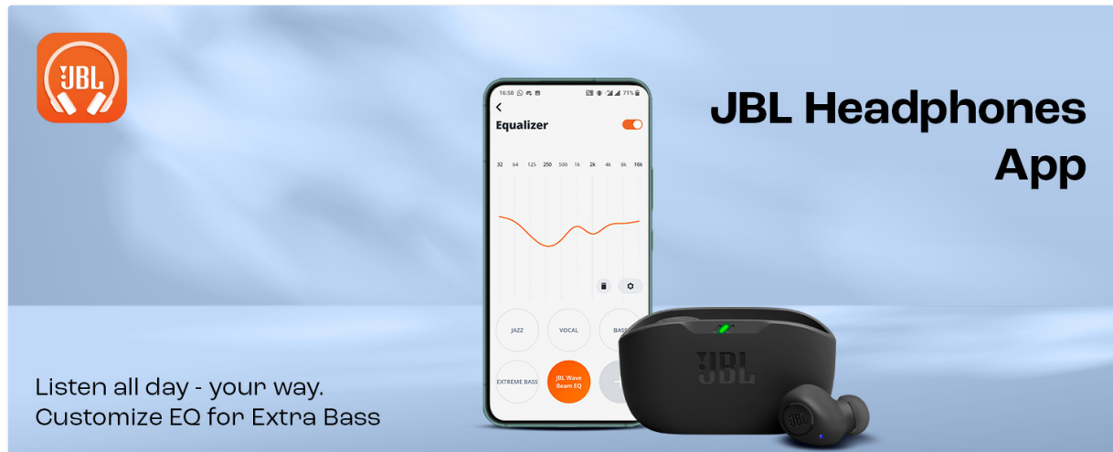
Image: Screenshot of the JBL Headphones App showing equalizer settings.

Download the JBL Headphones App from your device's app store (Google Play Store or Apple App Store) to unlock full features, customize sound settings, and manage your earbuds.