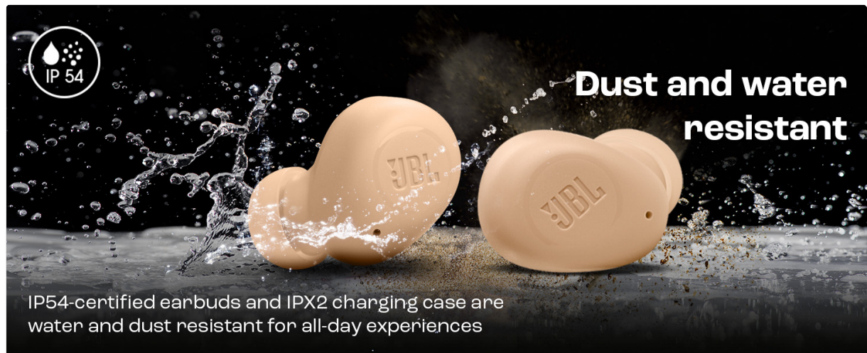
Image: JBL Wave Buds on a sandy surface with water splashing, demonstrating their IP54 dust and water resistance.

The JBL Wave Buds are IP54-certified, making them resistant to dust and splashes of water. This ensures durability for various activities and environments.