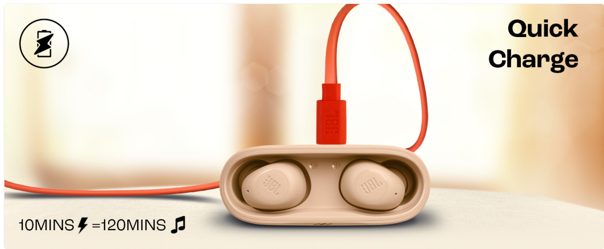
Image: The charging case connected via a USB-C cable, highlighting the quick charge capability.