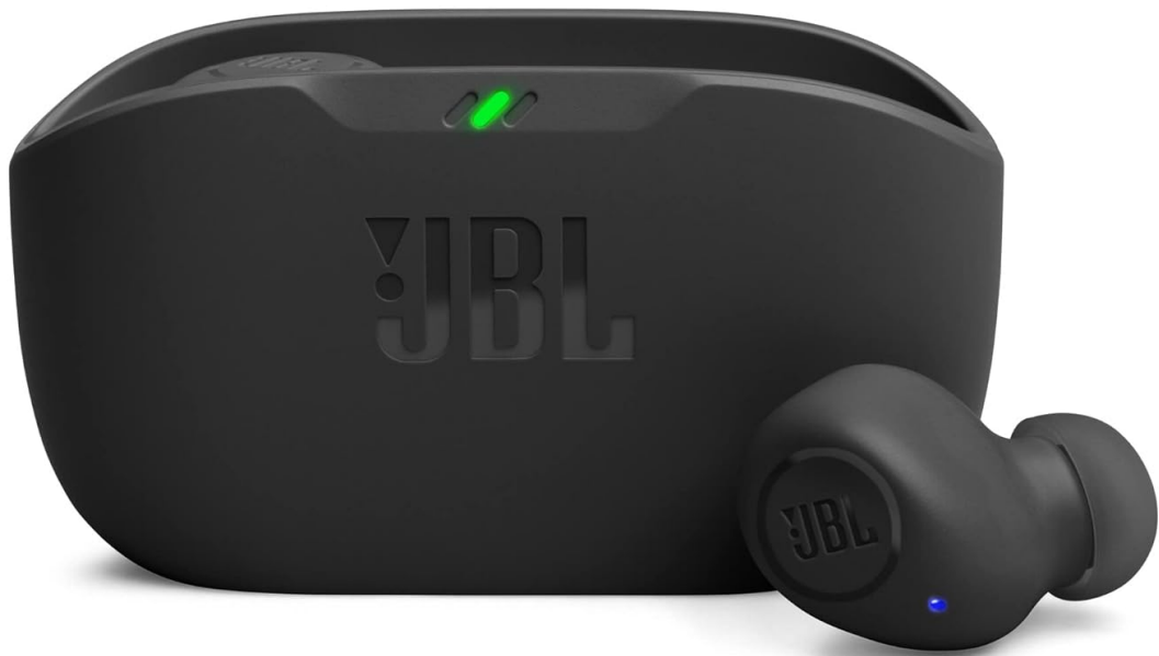
Image: JBL Wave Buds earbuds and their charging case.