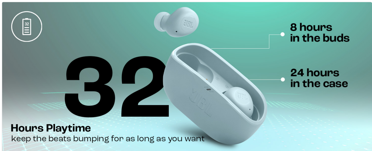
Image: Graphic illustrating the total 32 hours of playtime, broken down into 8 hours for the earbuds and 24 hours provided by the charging case.

Enjoy extended listening with up to 32 hours of combined battery life. The earbuds provide 8 hours of playback, and the charging case holds an additional 24 hours of charge.