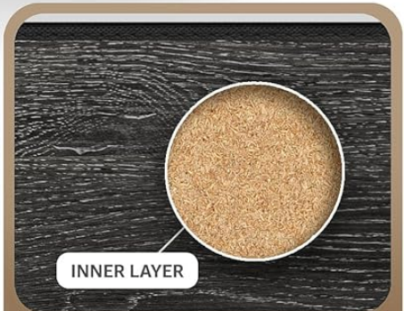
DURABLE MDF WOOD CORE

Image: A diagram showing the overall dimensions of the dresser: 31.5 inches in width, 24.62 inches in height, and 11.75 inches in depth.