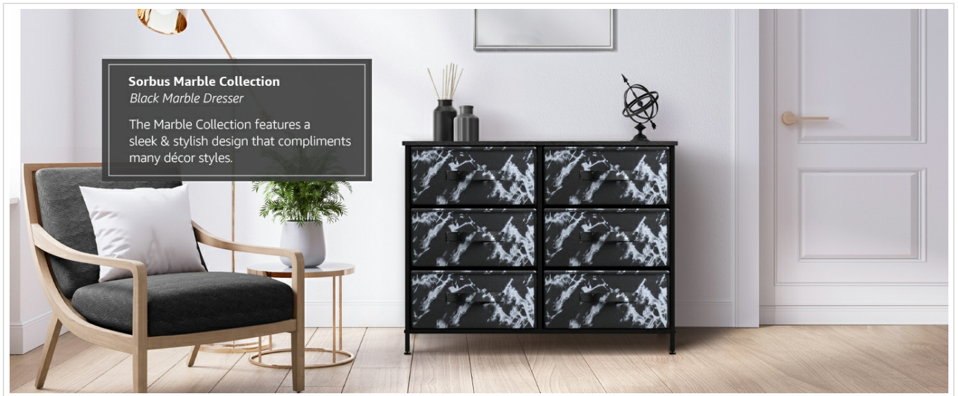
Image: Detailed view of the dresser's components, highlighting the sturdy steel frame, wood top, water-resistant fabric drawers, and adjustable feet.