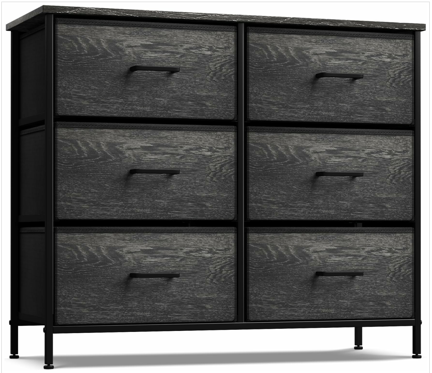
Image: The Sorbus 6-Drawer Dresser, fully assembled, showcasing its gray wood finish and six fabric drawers with handles.