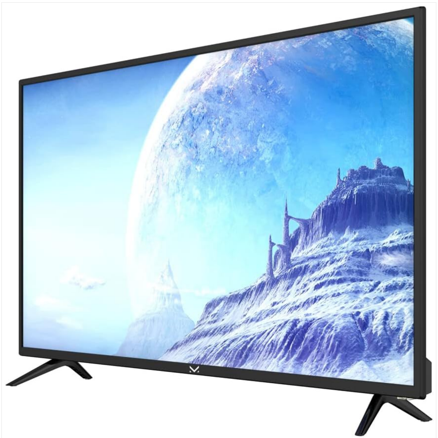
Side view of the MAJESTIC ST43VD V1 Smart TV, illustrating its sleek design and slim profile.