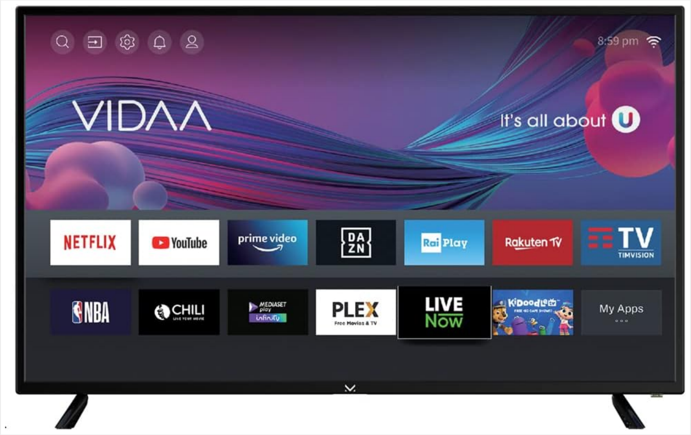
Front view of the MAJESTIC ST43VD V1 Smart TV, showcasing its 43-inch Ultra HD screen and the intuitive VIDAA operating system with various streaming application shortcuts.

The front of the television features the 43-inch Ultra HD display and the integrated VIDAA Smart TV interface.