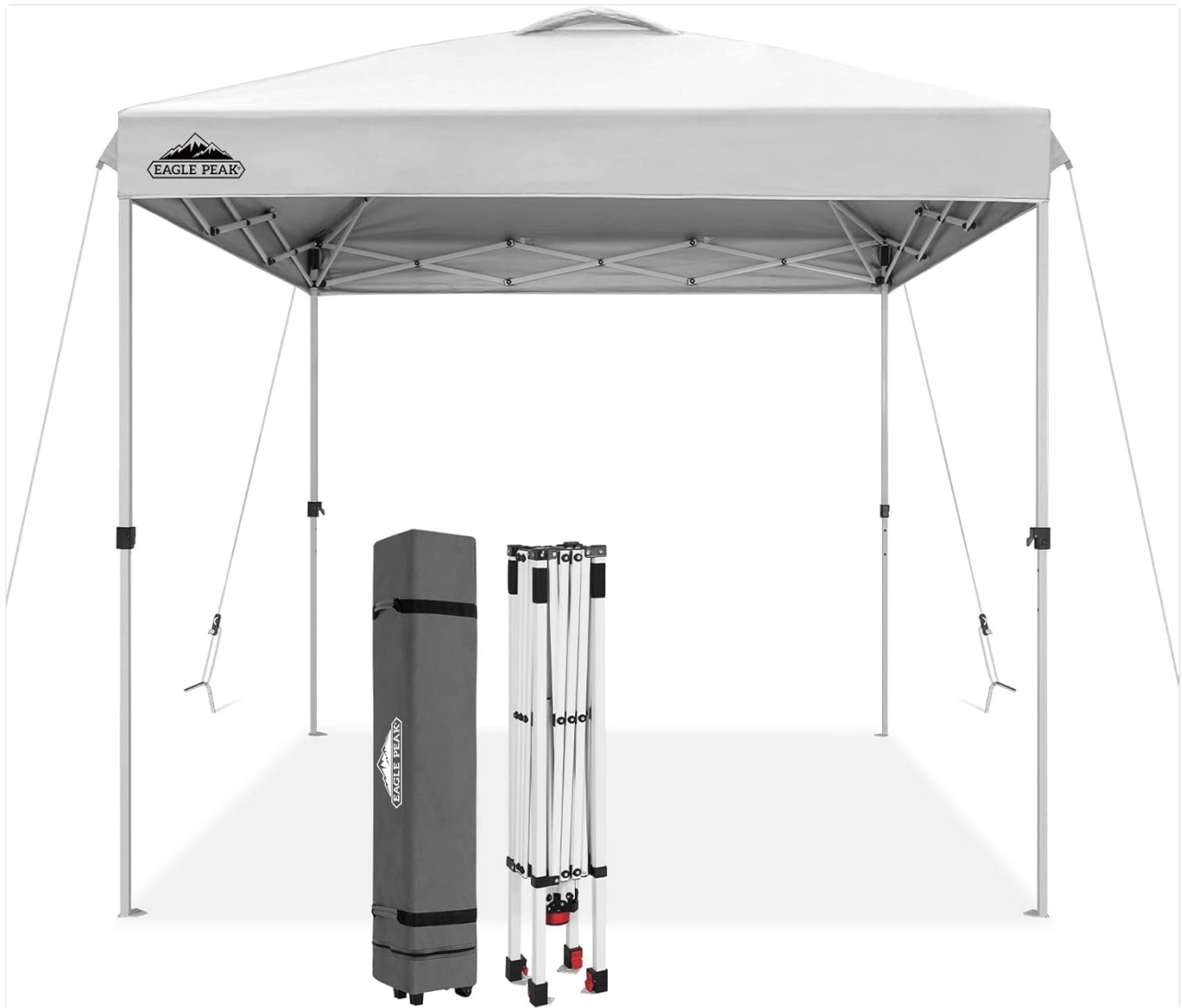
Figure 1: EAGLE PEAK 8x8 Pop Up Canopy Tent, showing the fully assembled canopy, folded frame, and wheeled carrying bag.

Key features include the Peak Push system for single-person setup, a durable steel frame with powder coating, CPAI-84 flame resistant and water-resistant 150D oxford fabric with UPF 50+ UV protection, and a vented top for improved airflow. The canopy offers three height settings for versatile use.