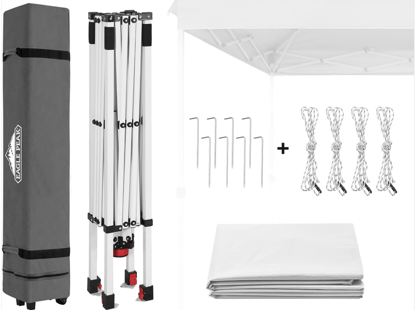
Figure 3: Components included in the package: canopy frame, canopy top, wheeled roller bag, 4 guy ropes, and 8 steel stakes.

Your browser does not support the video tag.