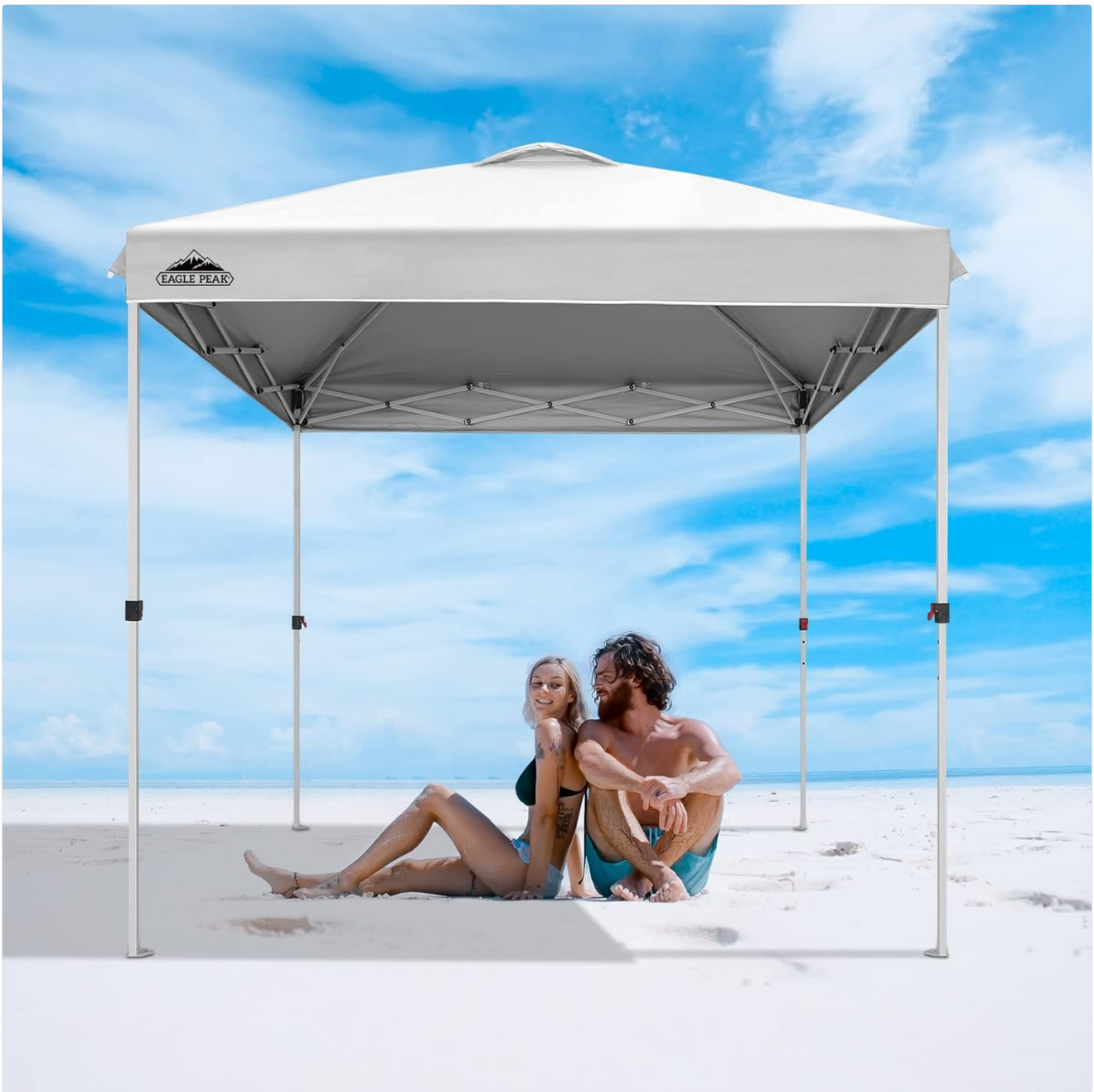
Figure 5: Illustration of the air vents on the canopy top, designed to allow good ventilation and improve stability by reducing wind resistance.