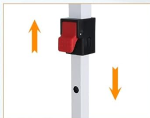
Pinch Free Button