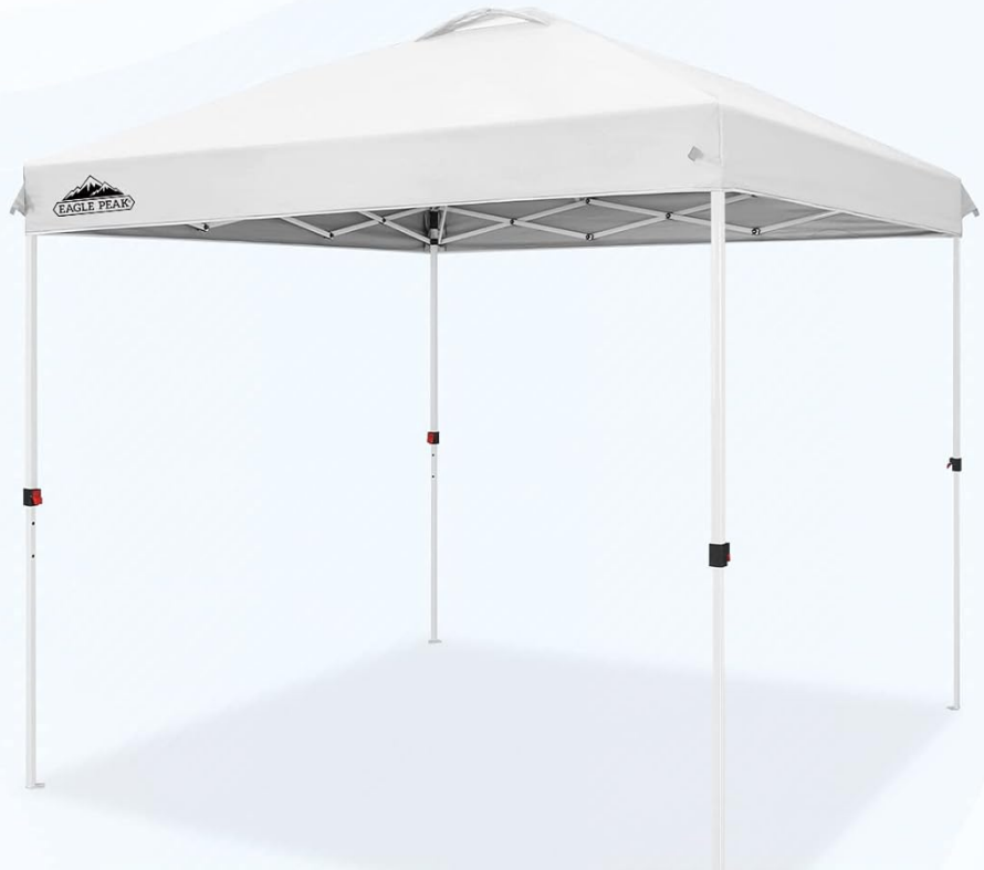
Figure 4: Key product features including the vented peak for ventilation, the easy setup Peak Push Lock mechanism, heavy-duty eave connections, pinch-free buttons for leg adjustment, and strong webbing for durability.