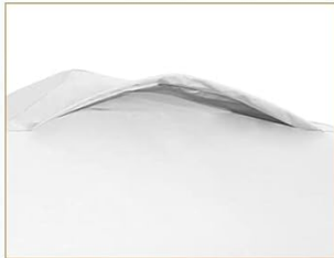
Vented Peak for Ventilation