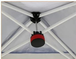
Easy Set up Peak Push Lock