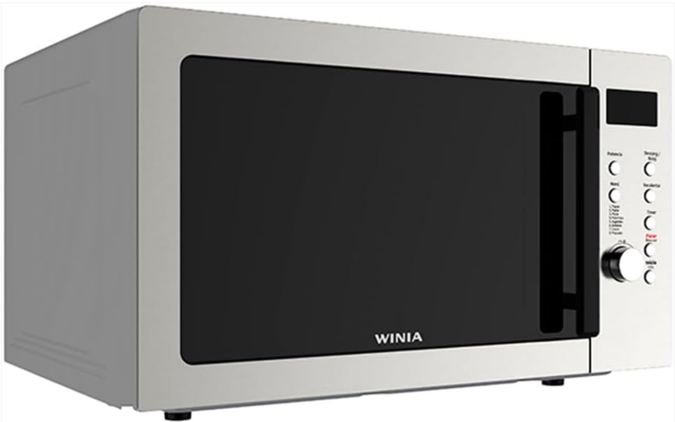
Image: Front view of the Winia KOS-1N1SS Microwave Oven, showing the control panel and door.