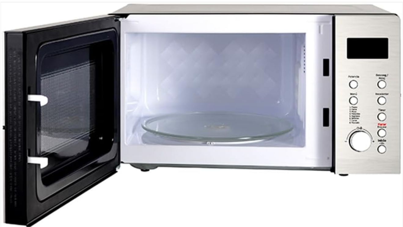
Image: Interior view of the Winia KOS-1N1SS Microwave Oven, showing the glass turntable and cavity.