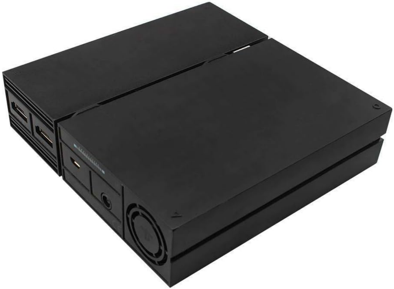
Figure 2.3: Angled view of the Processor Unit, providing a perspective of its overall shape and size.