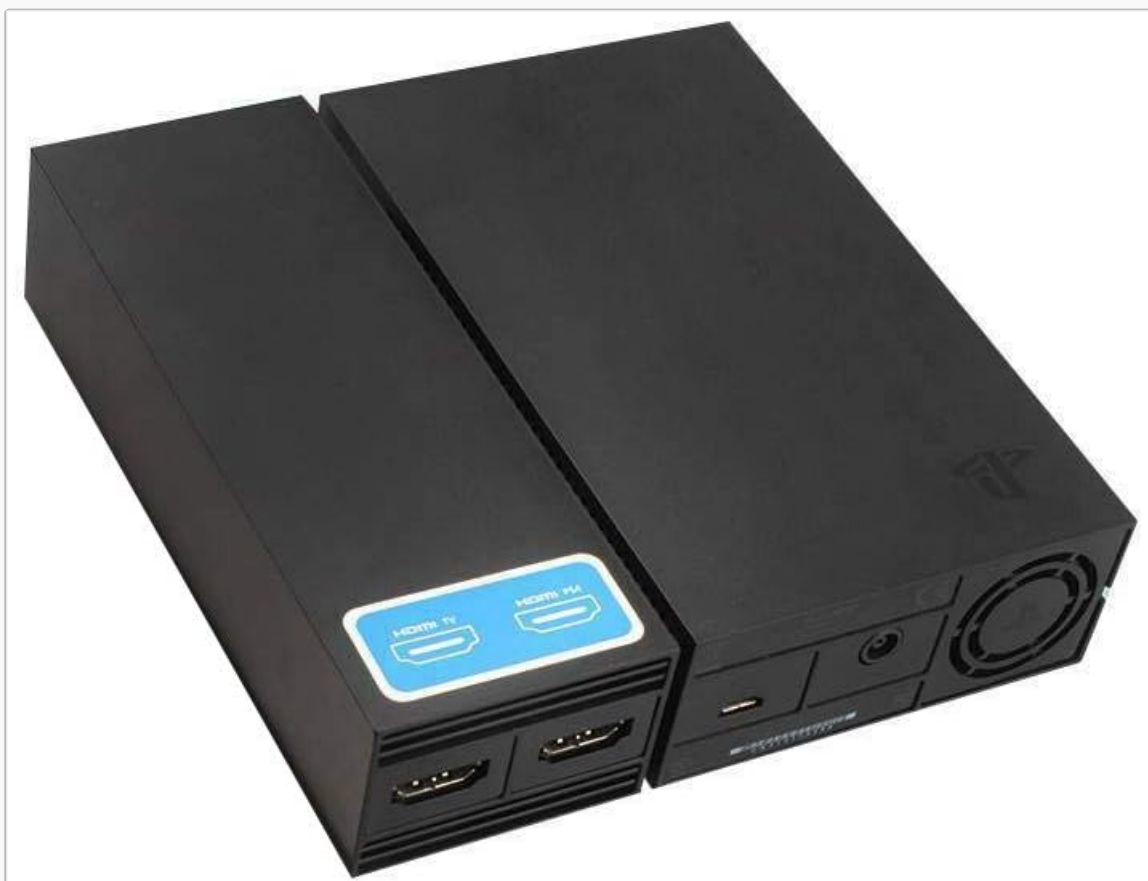
Figure 2.2: Top-down view of the Processor Unit, showing its compact design.