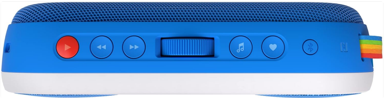
Figure 2: Top panel of the Polaroid P2, detailing the playback controls, volume dial, and other function buttons.