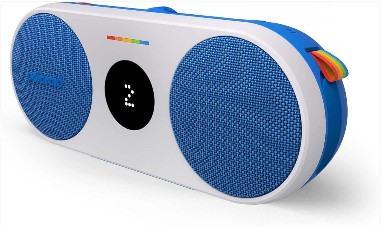
Figure 1: Front view of the Polaroid P2 Music Player, showcasing its distinctive blue speaker grilles, white body, and central display.