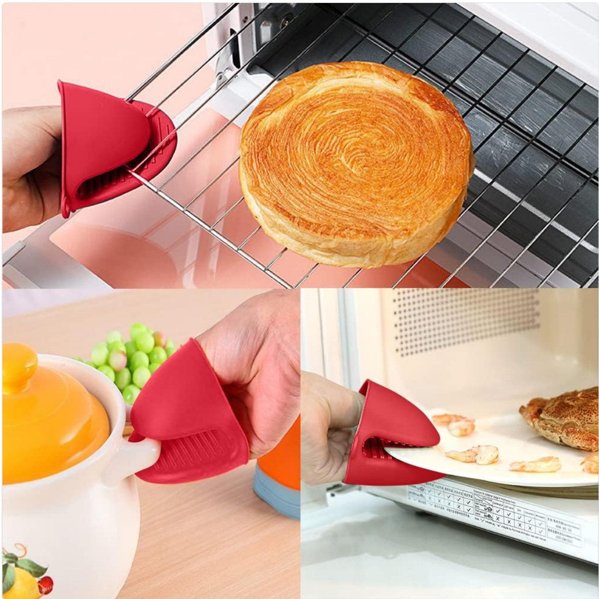
Image: Demonstrations of the silicone gloves in use for handling hot bakeware and dishes.