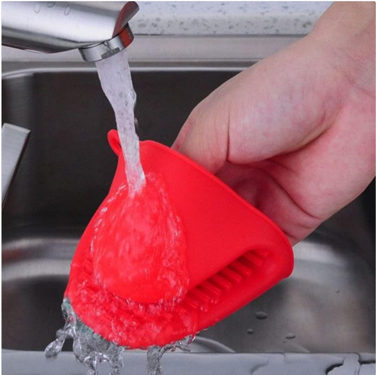
Image: A silicone glove being cleaned under running water, illustrating ease of washing.