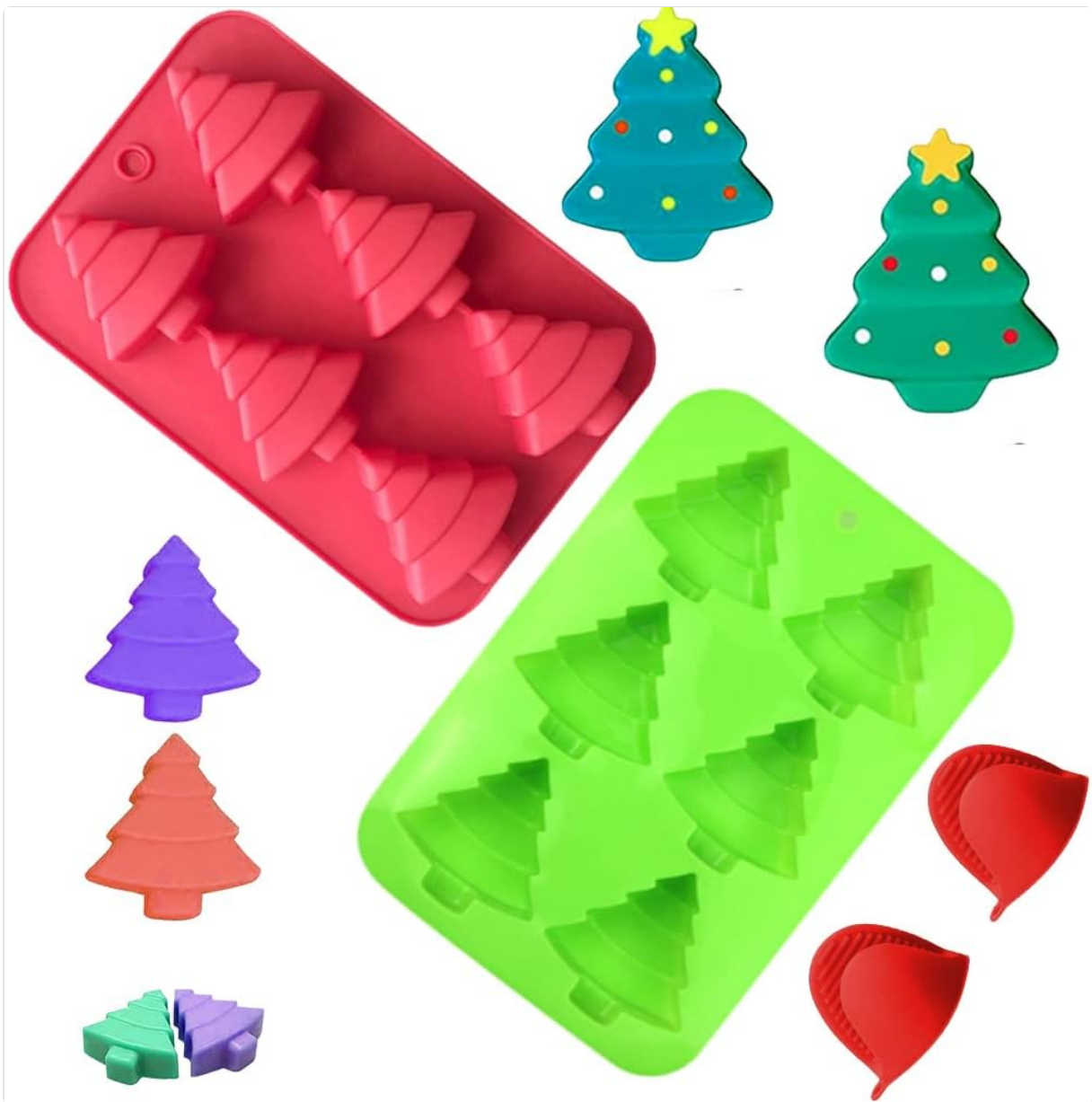
Image: The Lawdiey Christmas Tree Silicone Molds set, including two molds (red and green) and two mini silicone gloves.