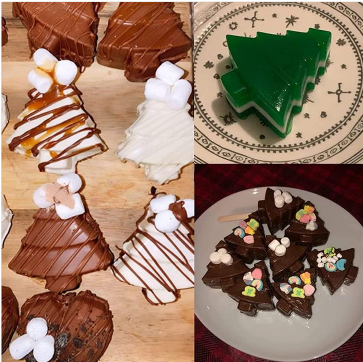
Image: Examples of food items, such as chocolates and jelly, created with the Christmas tree molds.