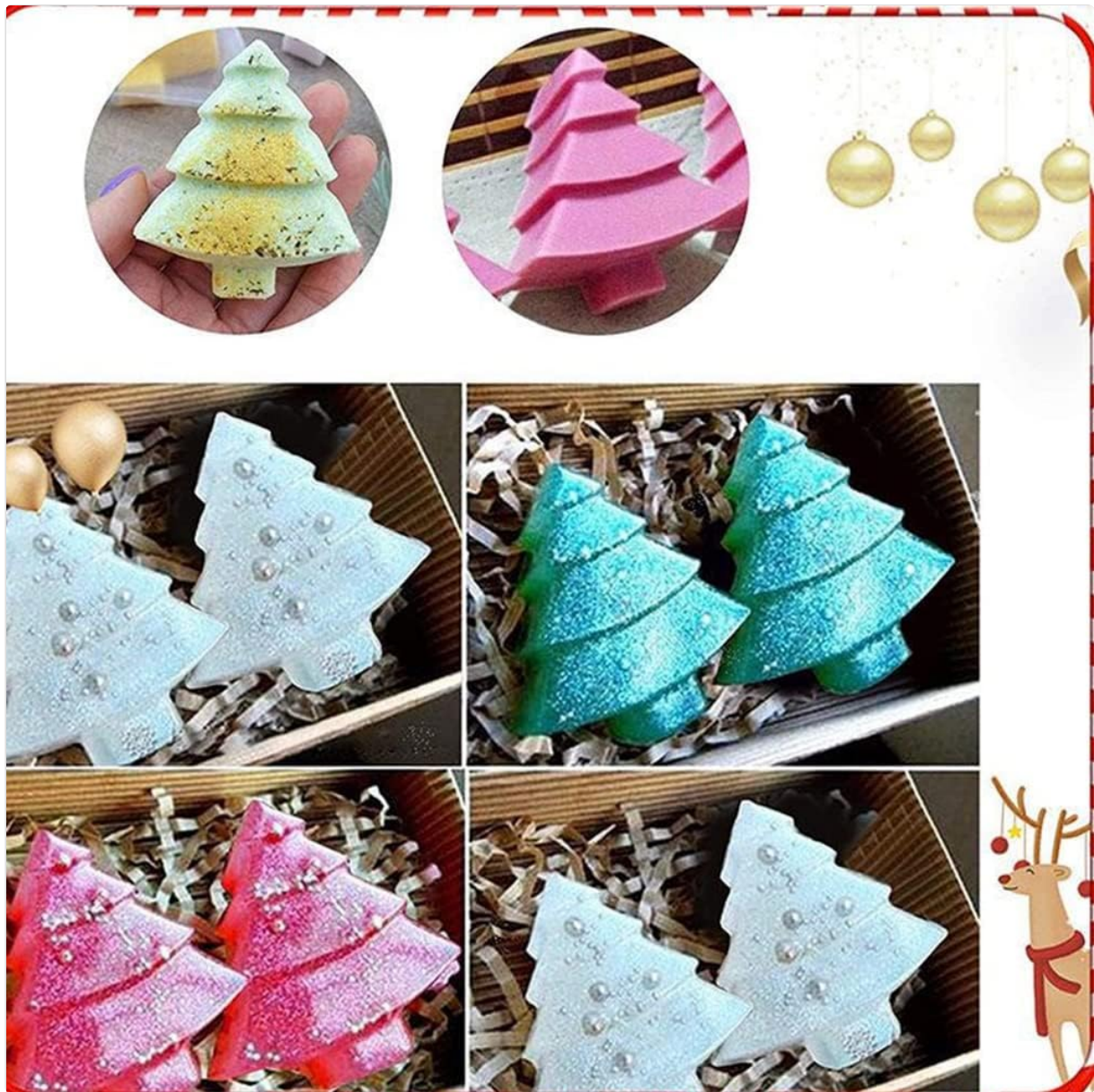
Image: Examples of Christmas tree shaped soaps, demonstrating the molds' versatility for crafts.