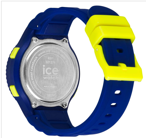
Image 4: Back View. This image shows the stainless steel case back of the watch. Engravings include 'STAINLESS STEEL CASEBACK', 'WWW.ICE-WATCH.COM', 'REF: 021274', 'ICE WATCH', 'Made in PRC/China', and '100M', indicating its water resistance.