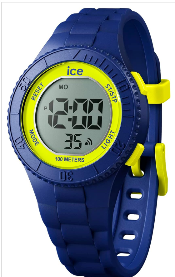
Image 1: Front View. This image displays the front of the Ice-Watch ICE Digit Navy Yellow. It features a blue case and strap with a bright yellow inner bezel