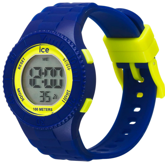
Image 2: Side View (Strap). This image shows the watch from a slight angle, highlighting the blue silicone strap and the yellow buckle. The strap has multiple holes for adjustment and a textured surface. The digital display is visible, showing 'WE' for Wednesday and the time '12:00'.

surrounding the digital display. The display shows the time, day, and a small icon indicating an active alarm. Buttons labeled 'RESET', 'MODE', 'ST/STP', and 'LIGHT' are visible around the bezel.