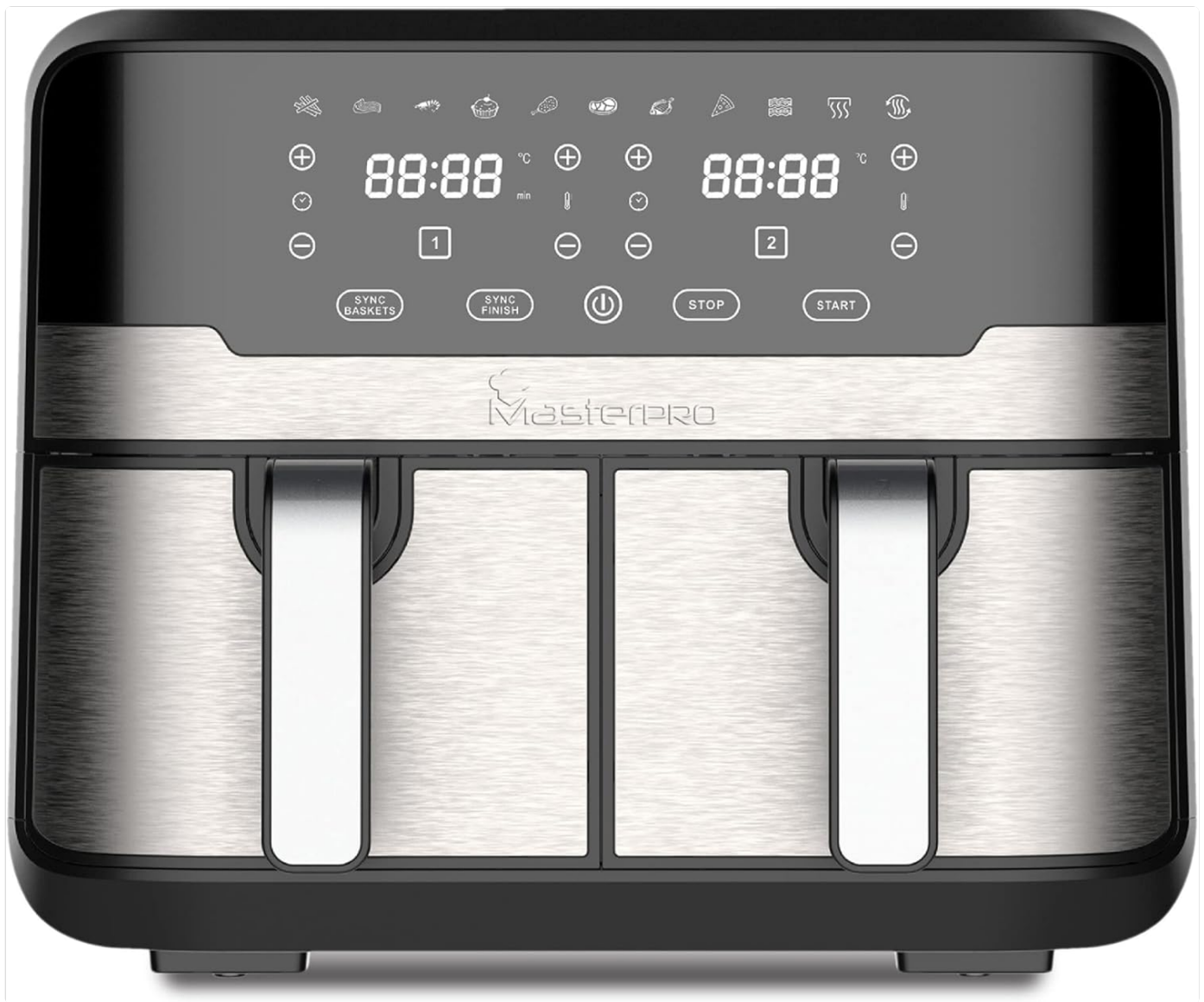
Front view of the MasterPRO Rocket Duo 9L Air Fryer, showcasing its dual baskets and intuitive LED touch control panel.