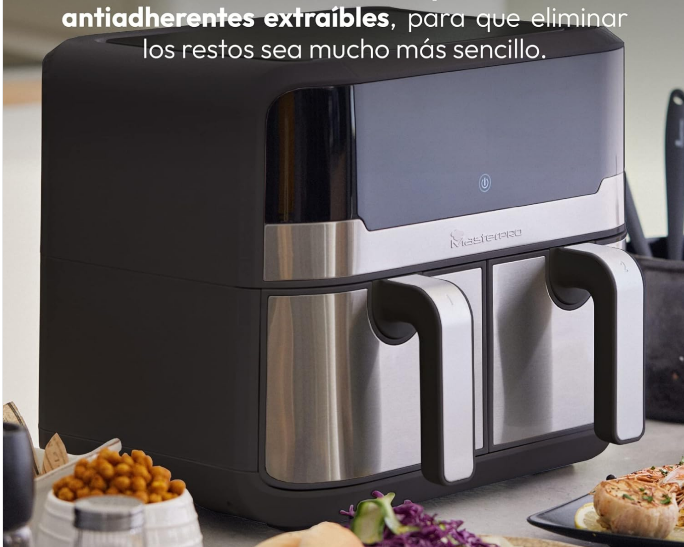
Food being cooked inside the MasterPRO Rocket Duo 9L Air Fryer, illustrating the cooking process.

La Rocket Duo 900 incorpora 2 cestos antiadherentes extraíbles, para que eliminar los restos sea mucho más sencillo.