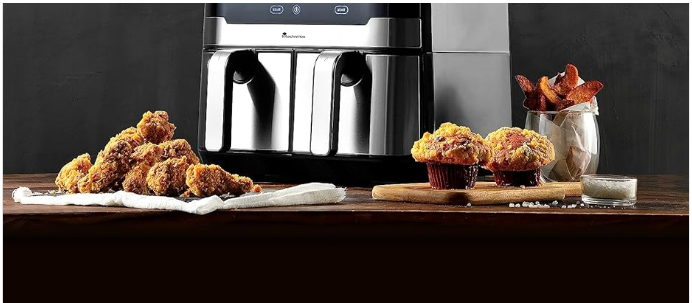
The MasterPRO Rocket Duo 9L Air Fryer positioned on a kitchen counter, ready for use.