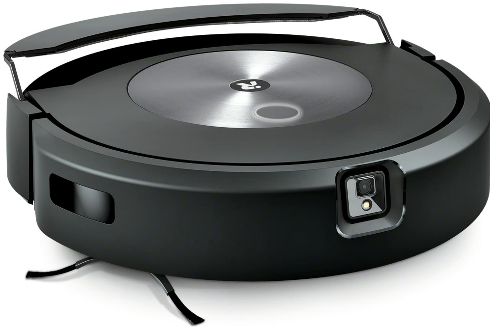
The iRobot Roomba J7 Combo Robot Vacuum and Mop, a versatile cleaning device.