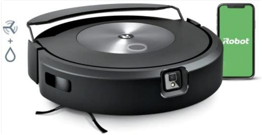
Connect your Roomba J7 Combo to the iRobot Home App for enhanced control and features.

For full functionality and smart features, download the iRobot Home App from your device's app store. Follow the in-app instructions to connect your Roomba J7 Combo to your home Wi-Fi network. The app allows for scheduling, mapping, and customized cleaning preferences.