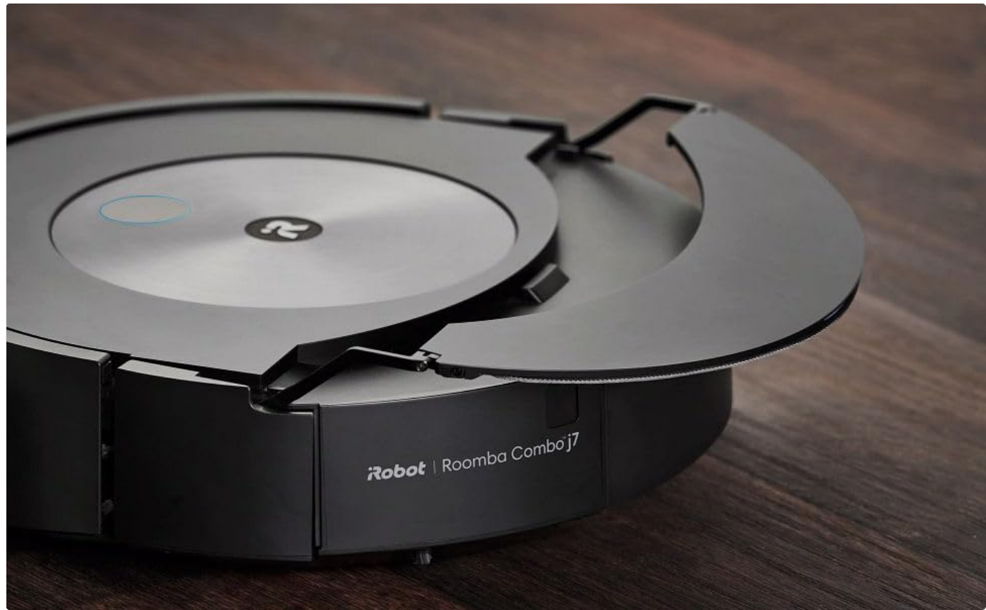
The Roomba J7 Combo efficiently cleans various floor types.

Press the CLEAN button on the robot or use the iRobot Home App to start a cleaning cycle. The robot will automatically begin vacuuming and, if the mop pad is attached and the water tank filled, will also mop hard floors.