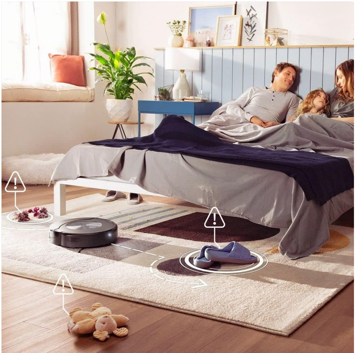
The robot intelligently navigates around furniture and other items.