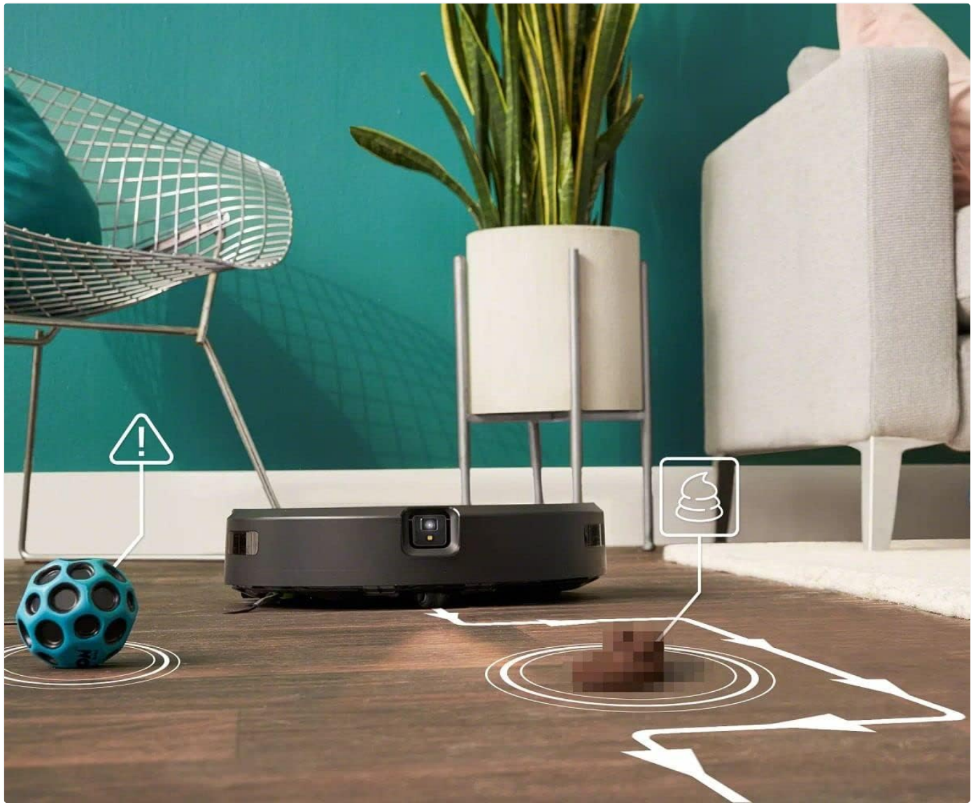
The robot's navigation system detects and avoids obstacles like pet waste.