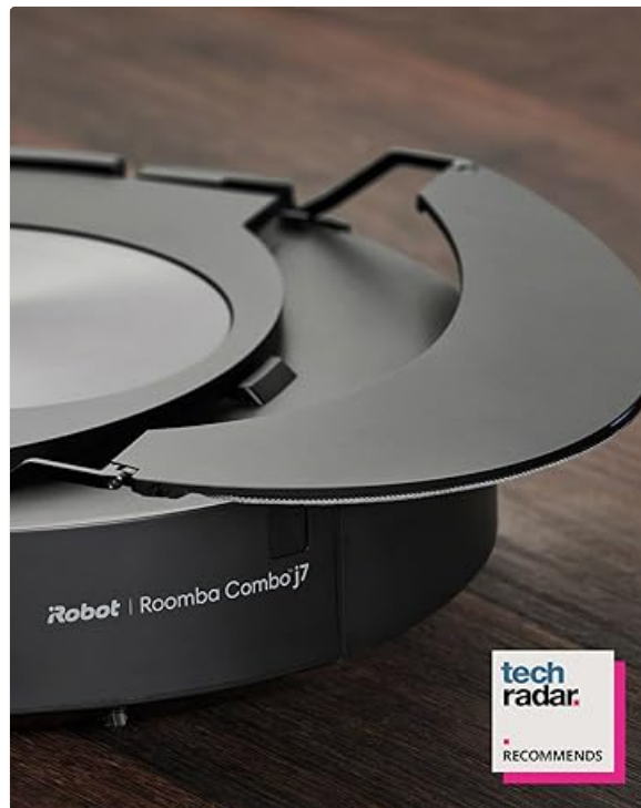
The mop arm retracts when carpet is detected, preventing wetting.