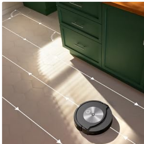
The robot intelligently avoids carpets during mopping cycles.