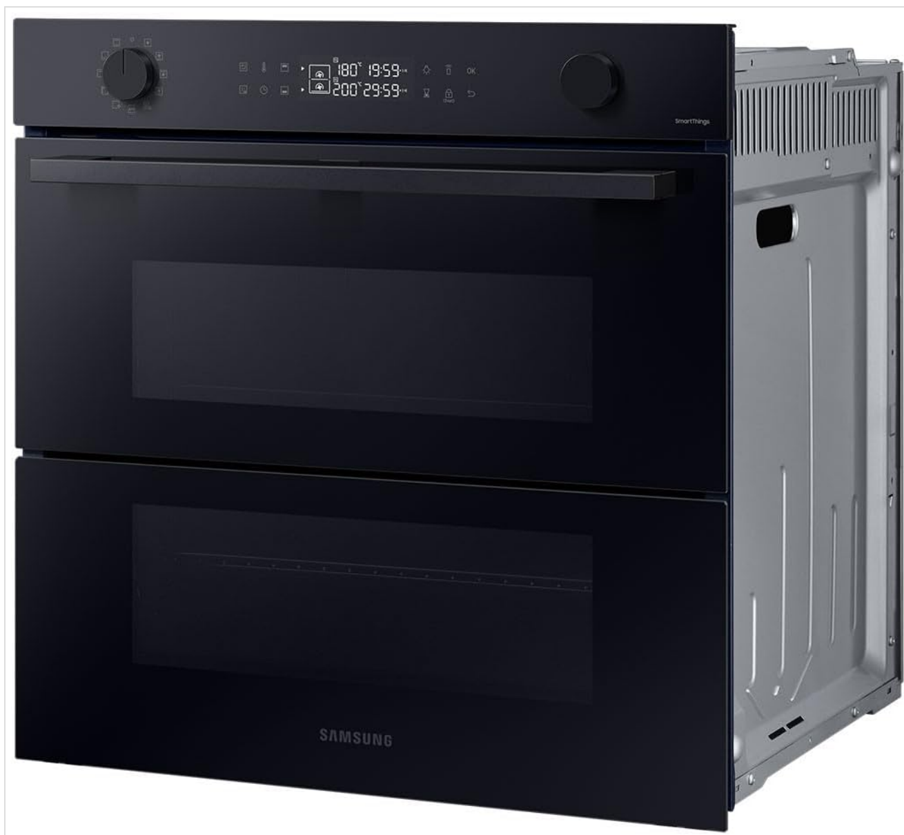
Figure 1: Side view of the Samsung NV7B4550VAK built-in oven, showing its integration into cabinetry.