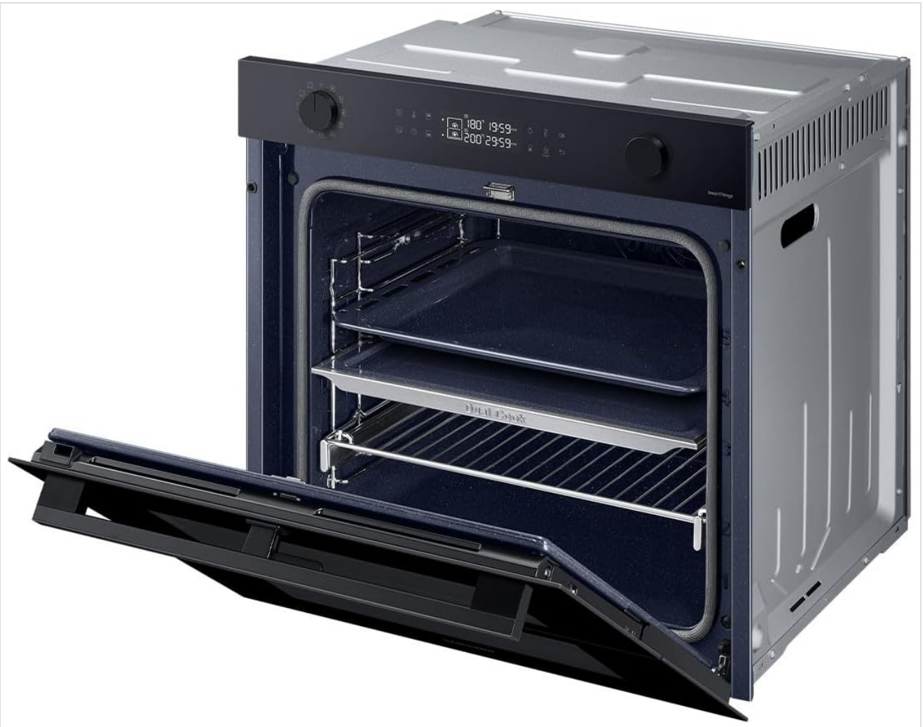
Figure 2: Interior view of the oven, showing racks and heating elements.