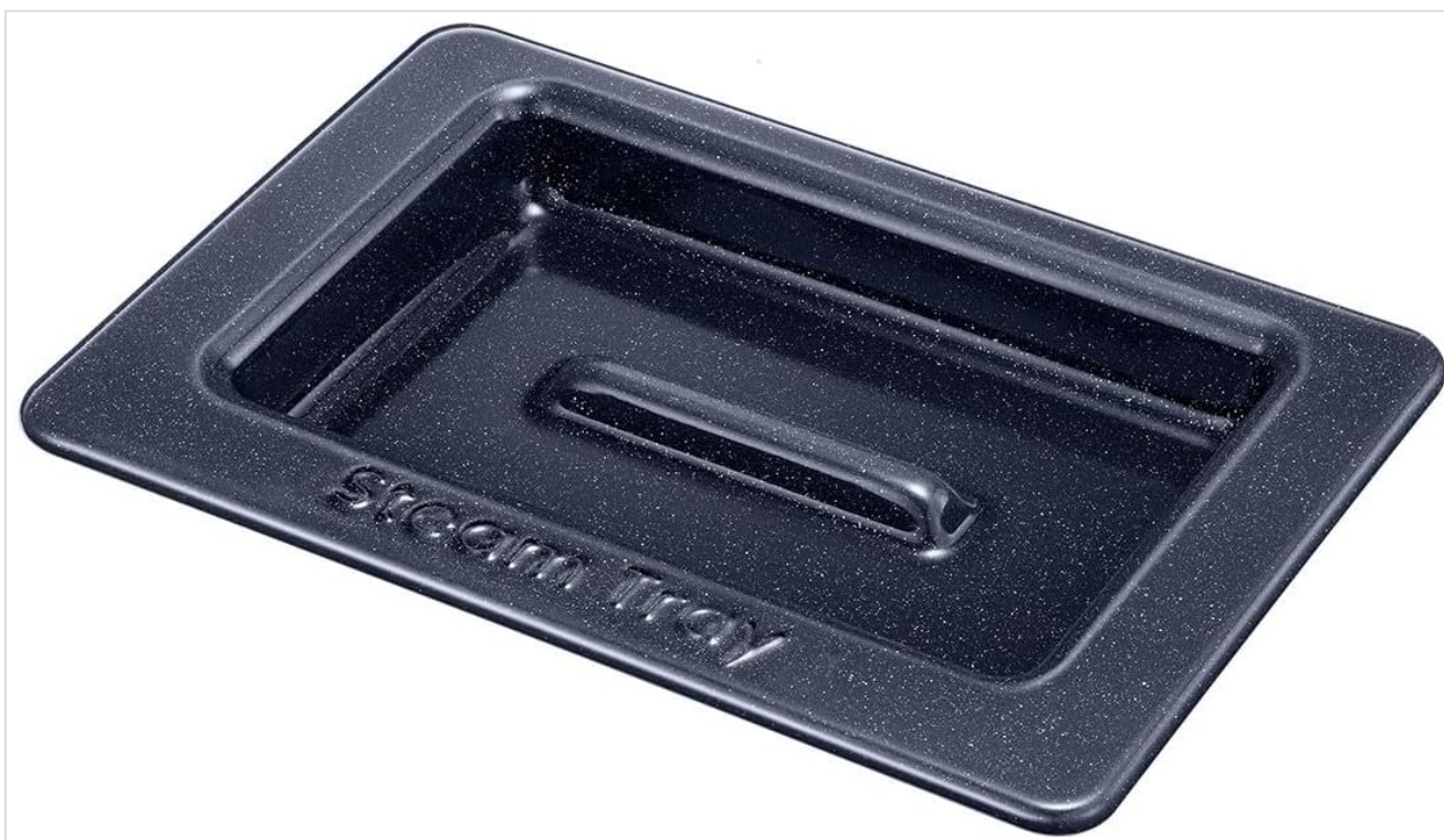
Figure 4: The steam tray accessory, used for steam cooking functions.