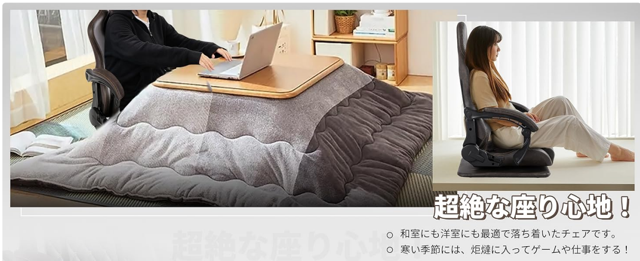
Image: The Dowinx Gaming Floor Chair LS-667902 showcasing its 360-degree rotation capability.

The chair features a 360-degree rotating base, allowing for easy movement and access to your surroundings without needing to reposition the entire chair. Simply swivel the chair to your desired direction.