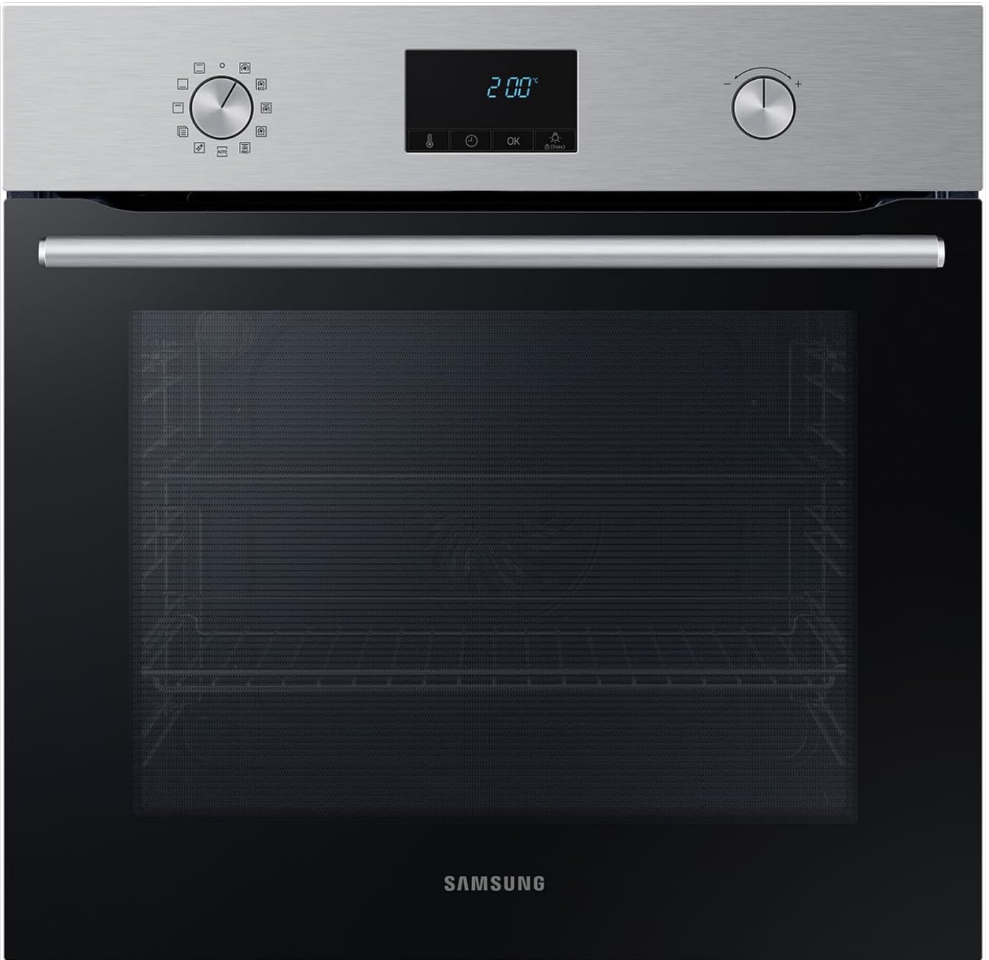
Figure 2: Oven Front View and Control Panel