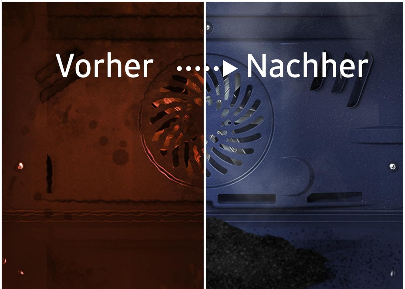
Figure 5: Pyrolytic Self-Cleaning Before and After