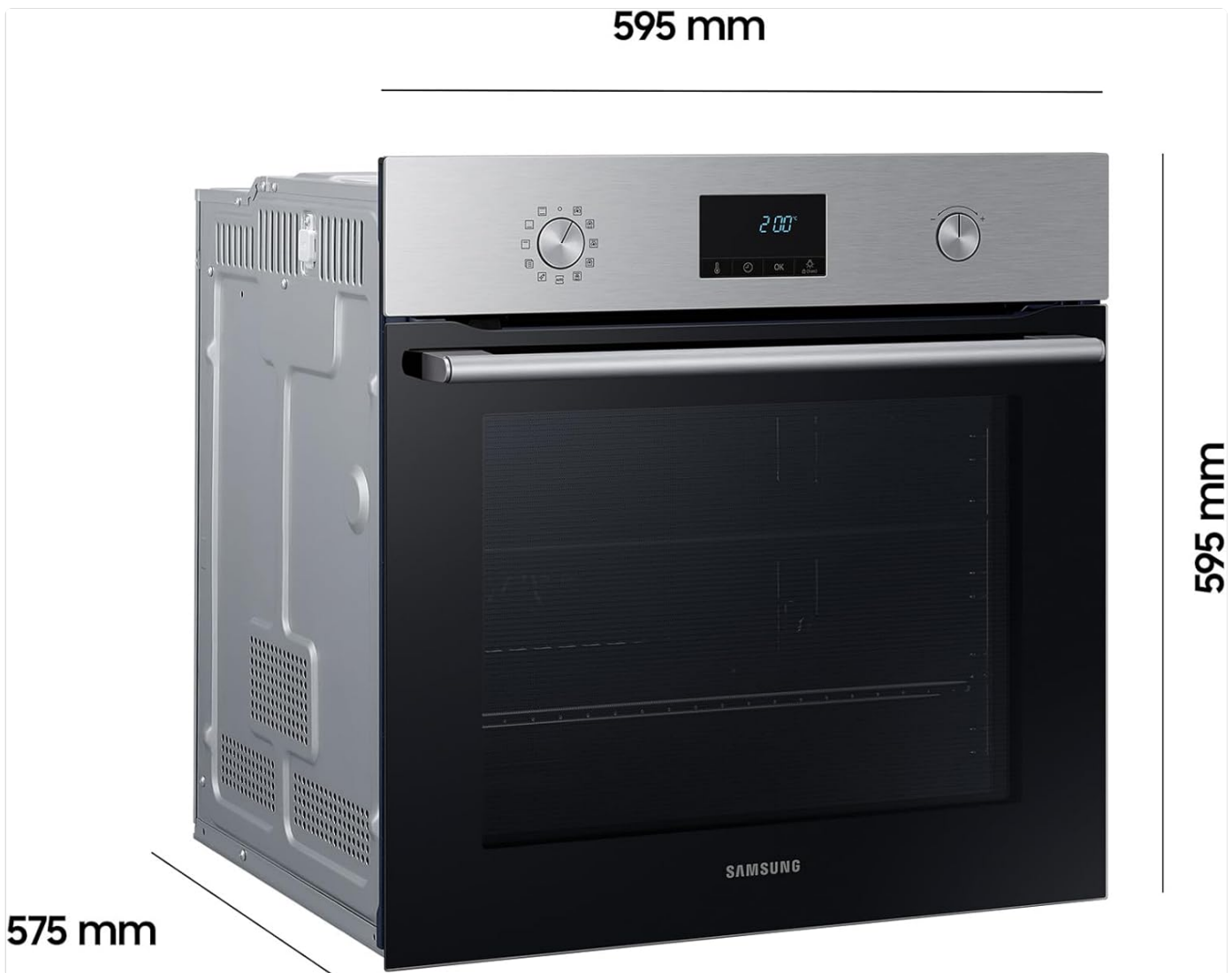
Figure 1: Oven Dimensions