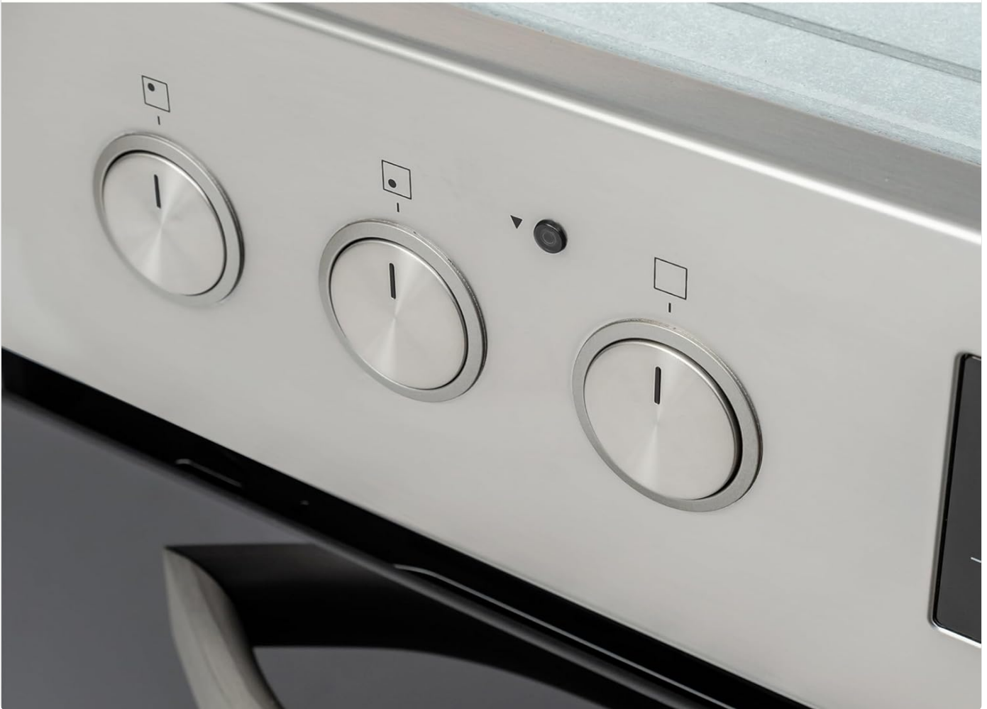
Figure 3: Retractable Knobs