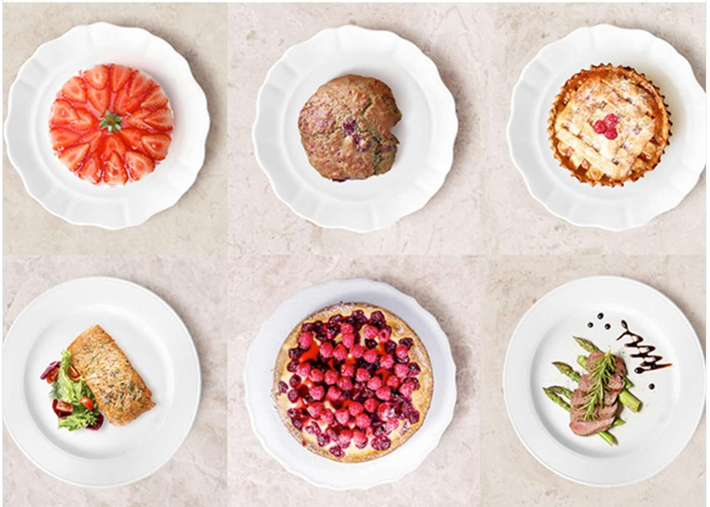
Figure 4: Automatic Programs for Diverse Cooking