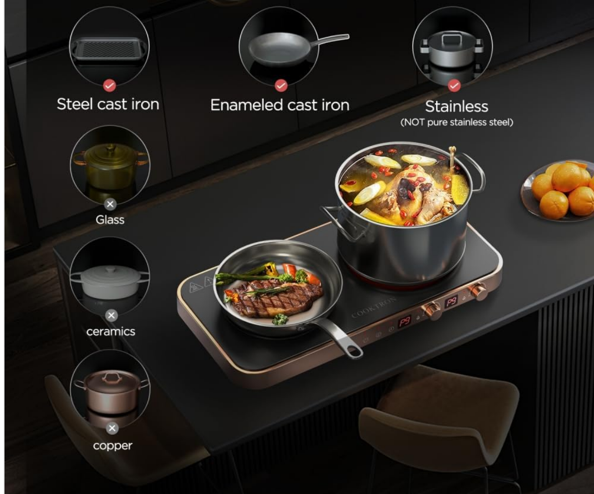
Figure 5.1: Visual guide for choosing compatible and incompatible cookware for induction.