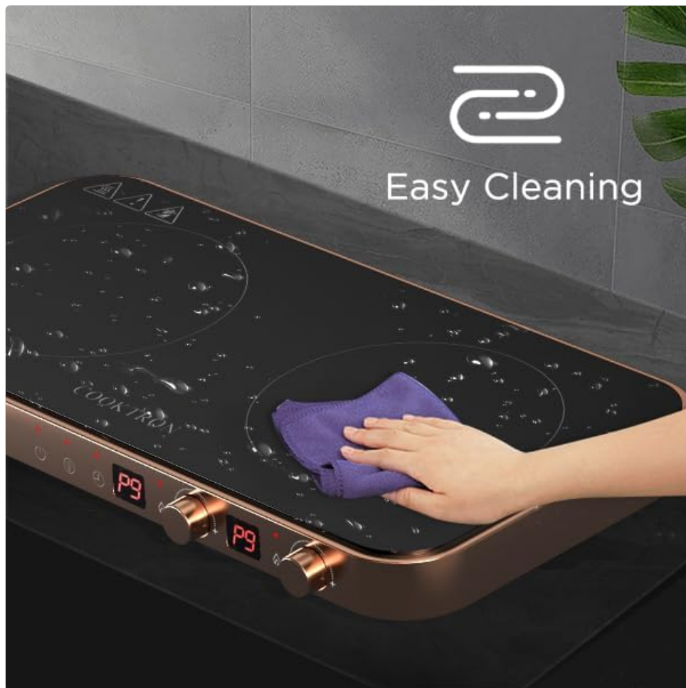
Figure 6.1: The smooth cooktop surface is easy to clean with a damp cloth.