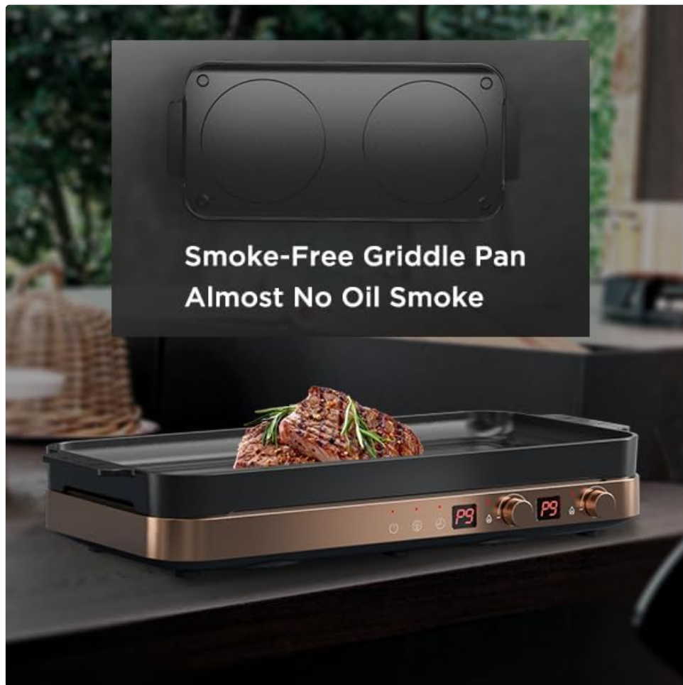
Figure 4.2: The smokeless griddle pan reduces oil smoke during cooking.