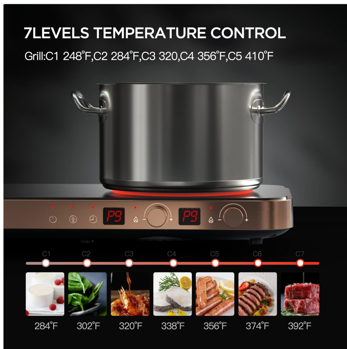
Figure 4.1: Control panel showing temperature and power settings for each burner.