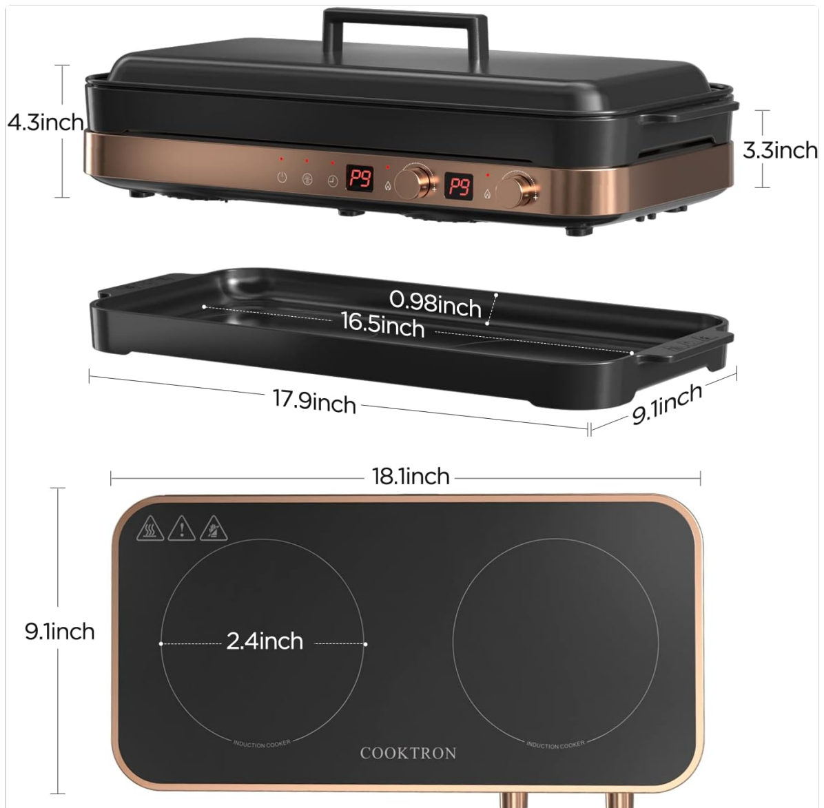
Figure 8.1: Detailed dimensions of the cooktop and griddle components.