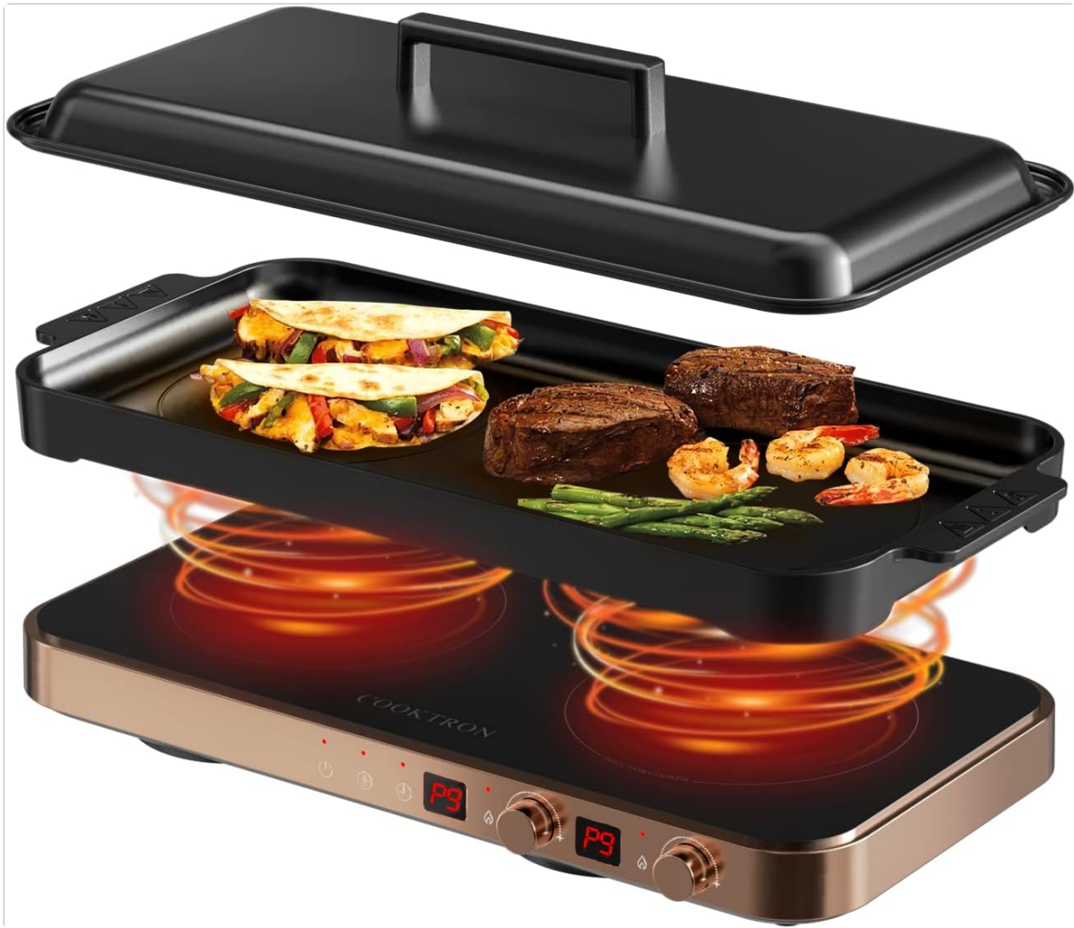
Figure 2.1: Main unit with removable griddle pan and lid.

The main unit houses two induction burners, each with independent controls. The removable cast iron griddle pan fits securely over both burners, allowing for simultaneous grilling. A lid is provided for the griddle pan to enhance cooking and reduce splatter.