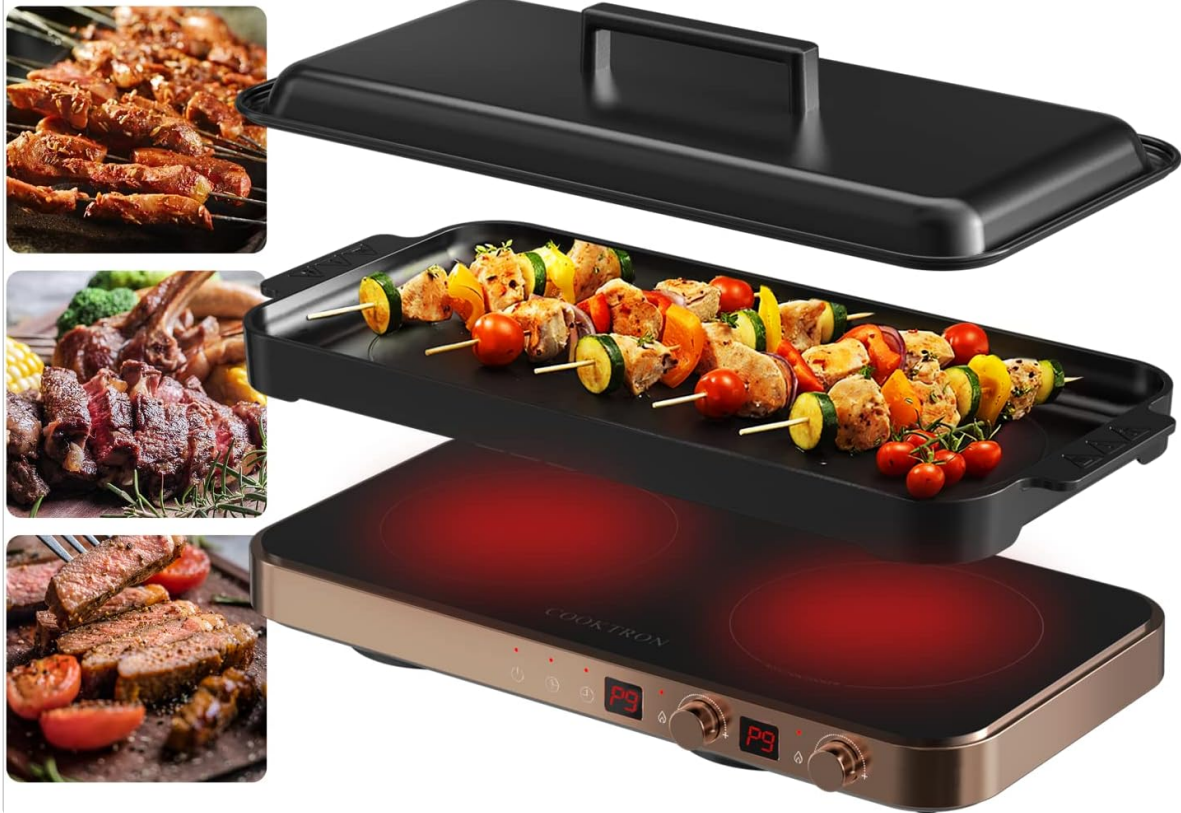
Figure 2.2: The cooktop functions as a 2-in-1 induction cooker and grill, powered by 1800W.

BBQ Grill Cast Iron Grill Panfast Heating With No Oil Smoke