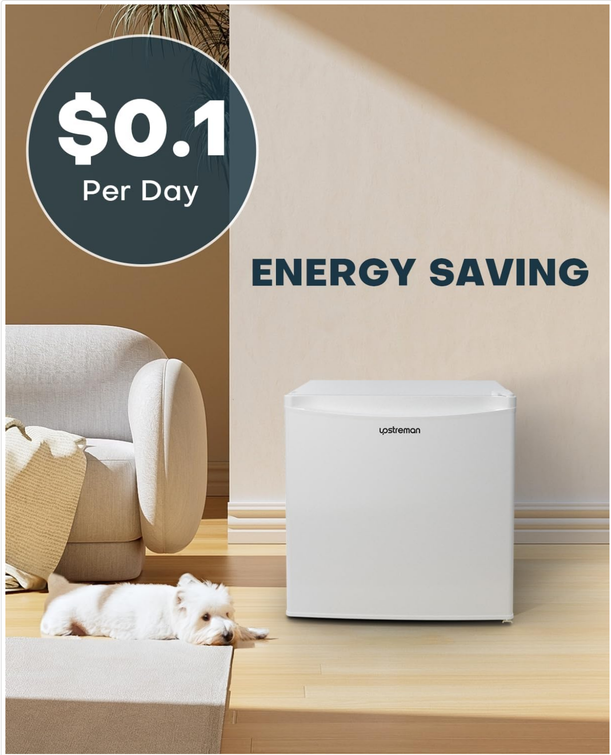
Image: The Upstreman Mini Fridge highlighting its energy-saving feature, with an estimated daily cost of $0.1.