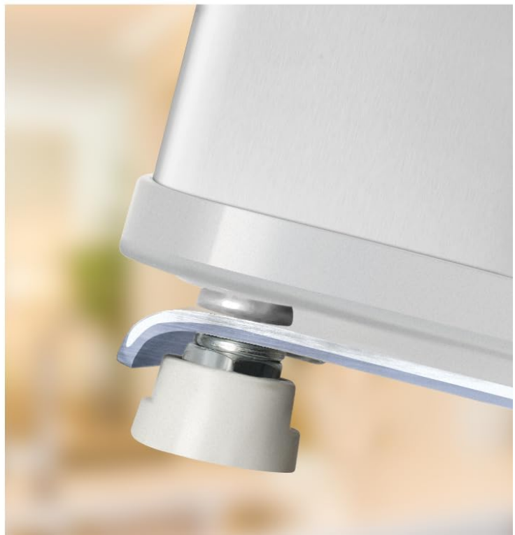
Image: A diagram illustrating the reversible door feature and adjustable settings of the Upstreman Mini Fridge.

Your browser does not support the video tag.