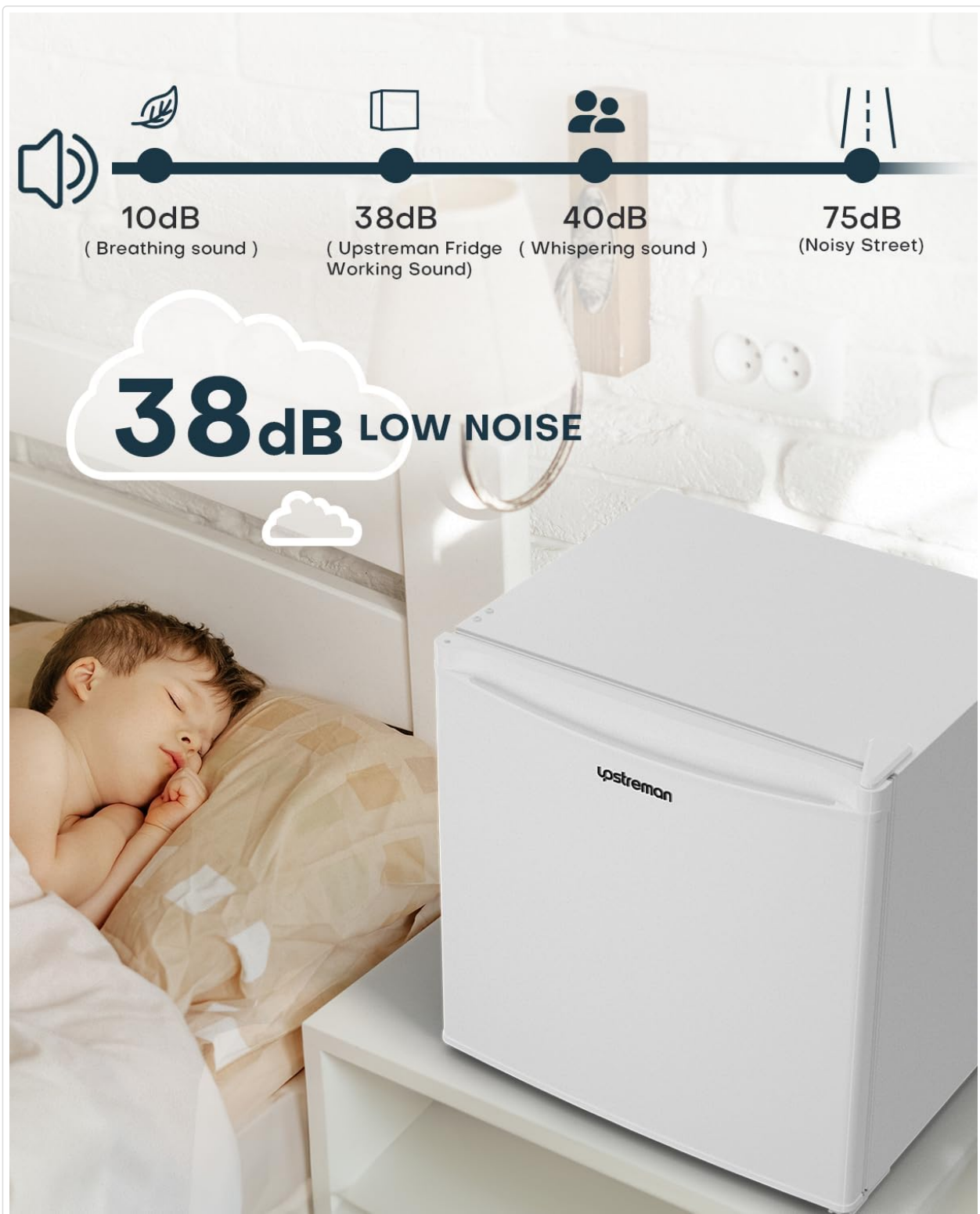
Image: The Upstreman Mini Fridge emphasizing its low noise operation at 38 dB, suitable for quiet environments like bedrooms.