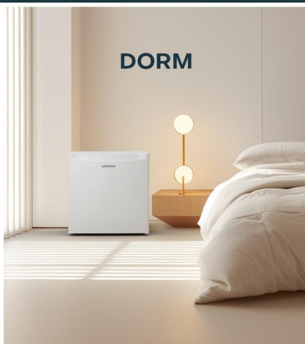
Image: The Upstream Mini Fridge shown in different environments such as an apartment, office, kitchen, and dorm room, illustrating its versatile placement options.