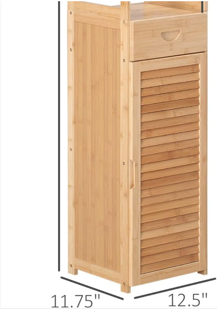
Diagram illustrating the overall dimensions of the kleankin Tall Bathroom Cabinet: 12.5 inches width, 11.75 inches depth, and 64.25 inches height. Shelf spacing is approximately 10 inches.