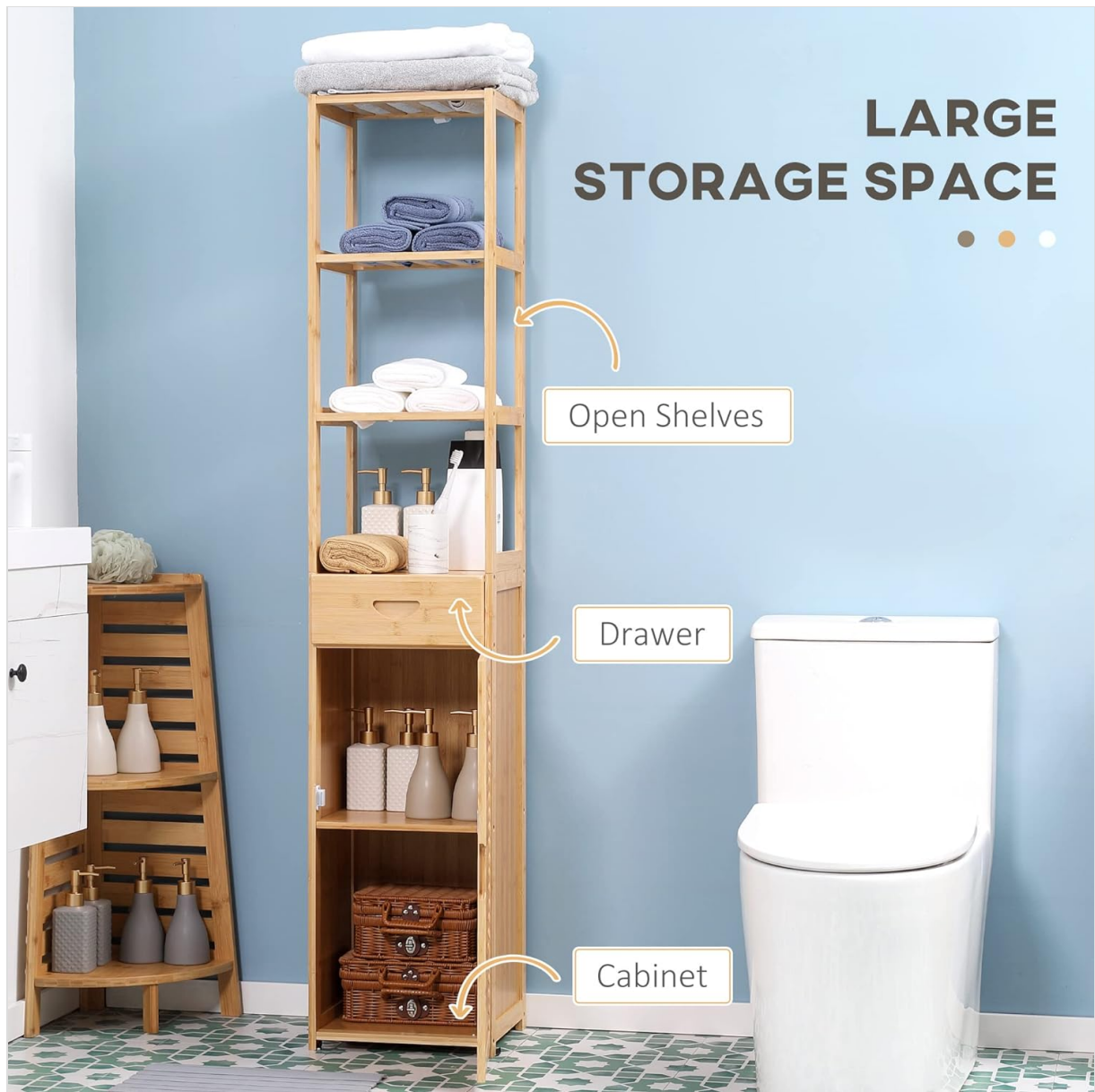
Image highlighting the various storage areas of the cabinet: open shelves at the top, a central drawer, and a lower cabinet with a louvered door, demonstrating ample storage capacity.