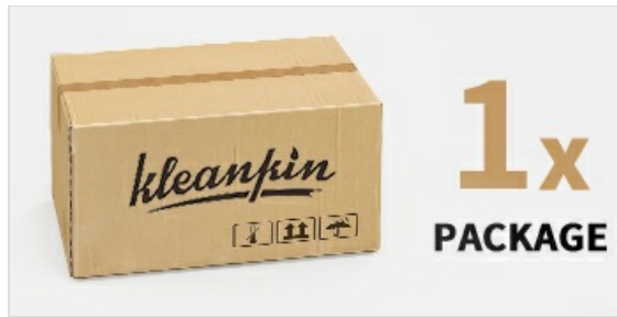
Image showing the product packaging, indicating one package.