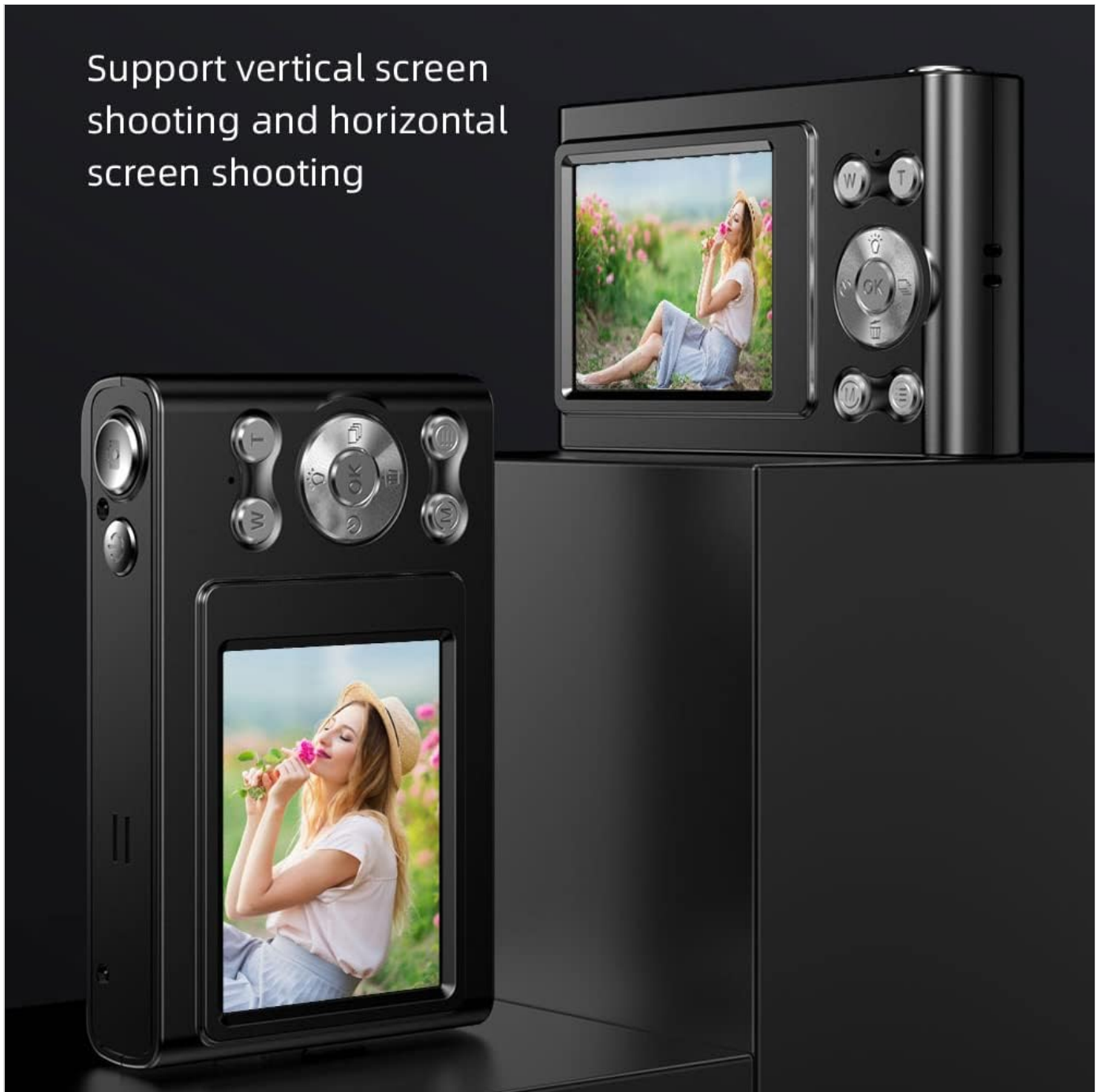
Image: Two views of the Andoer camera demonstrating its ability to support both vertical and horizontal screen shooting. One camera is positioned horizontally, and another is rotated vertically, each displaying a portrait of a woman.

Support vertical screen shooting and horizontal screen shooting