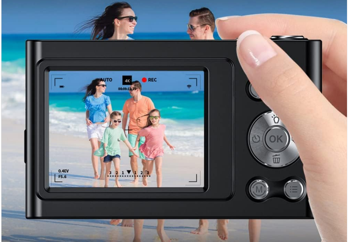
Image: A hand holding the Andoer camera, with the screen displaying a family on a beach. The image highlights the camera's compact size and the accessibility of its rear controls, including the directional pad and function buttons.

The 4K HD video camera records every interesting thing and shoots your VOG