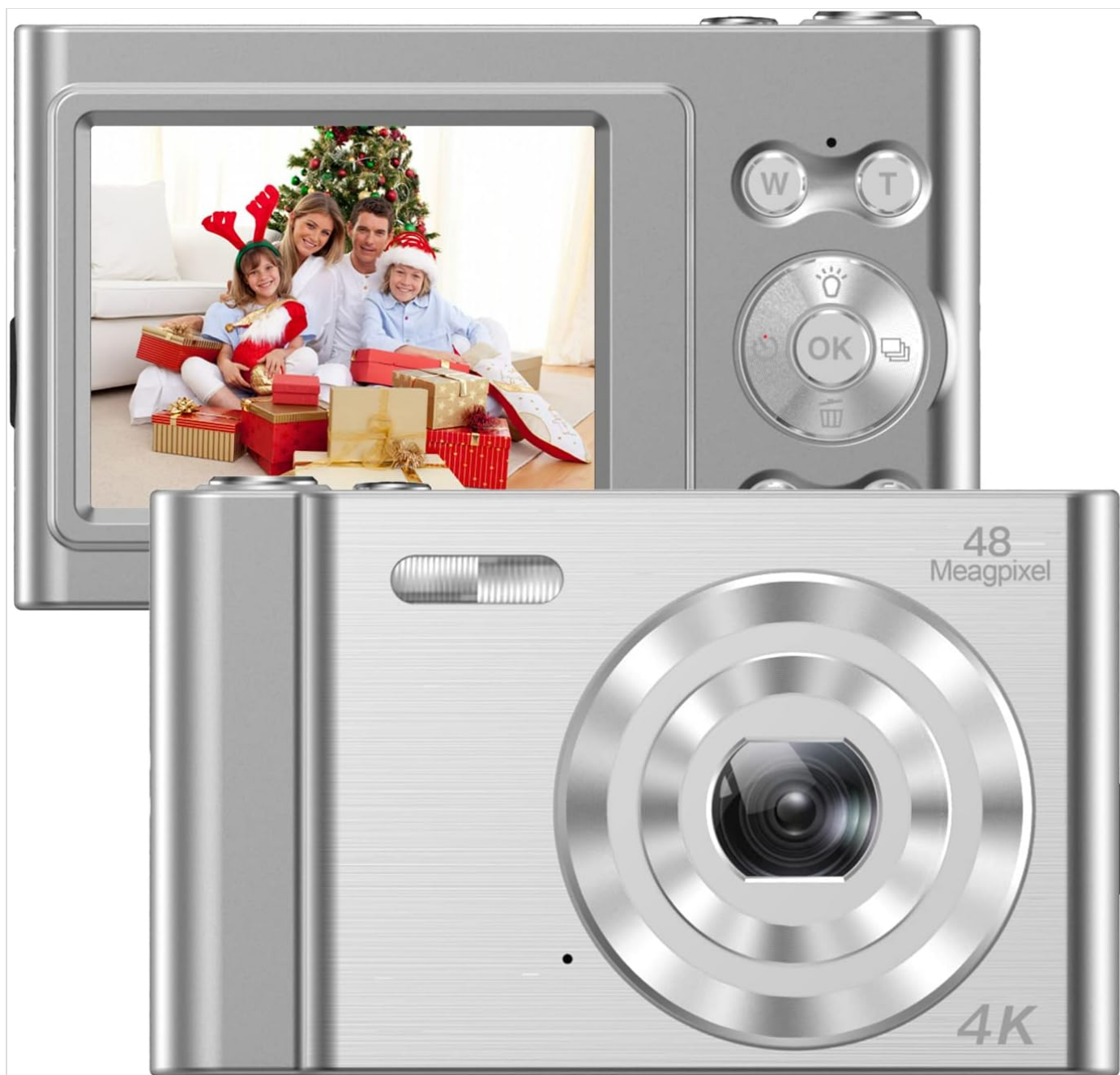
Image: Front and back views of the silver Andoer 4K Digital Camera. The front shows the lens and flash, while the back displays the screen and control buttons, including zoom (W/T), OK, menu, and mode buttons.

Familiarize yourself with the main components of your digital camera.