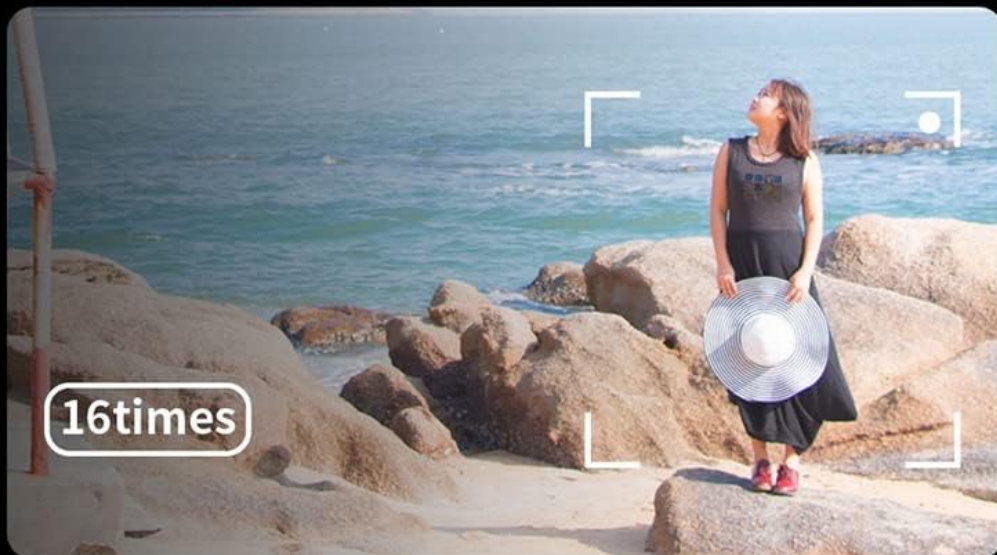
Image: A visual comparison demonstrating the camera's 16X digital zoom capability. The top image shows a wide shot (1x zoom) of a person on a beach with a hot air balloon, while the bottom image shows a zoomed-in view (16x zoom) of the same person, highlighting the magnification.