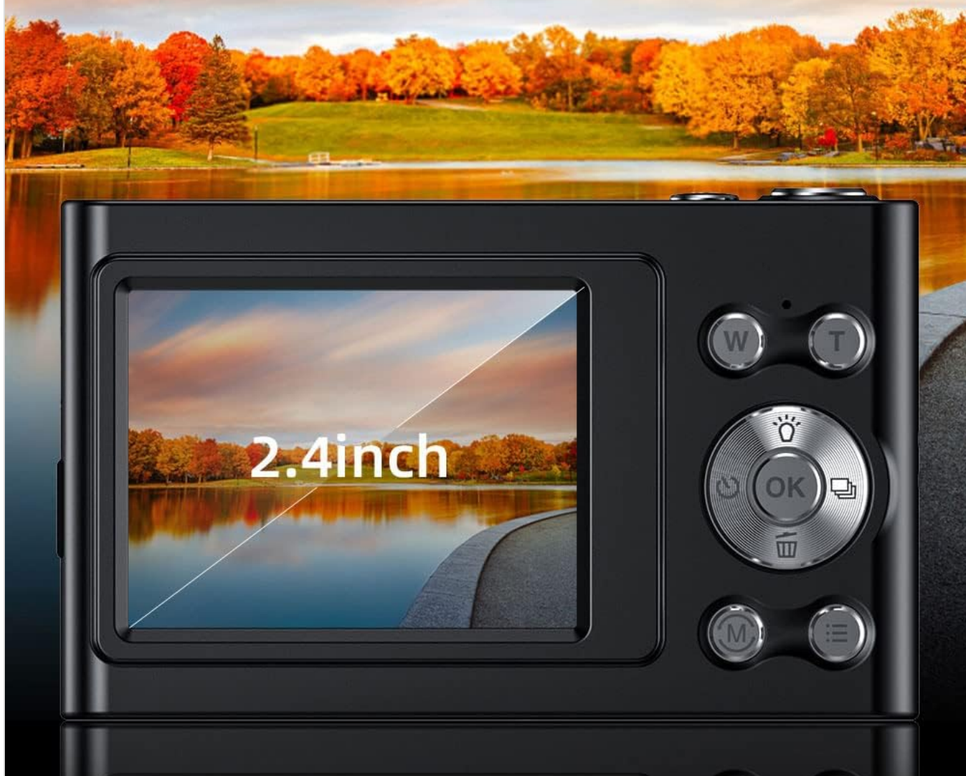
Image: A close-up of the camera's 2.4-inch IPS screen, displaying a landscape scene with a lake and autumn trees, demonstrating the screen's clarity and size.

Provide you with a wide field of vision and let you feel the new artistic conception of the big screen