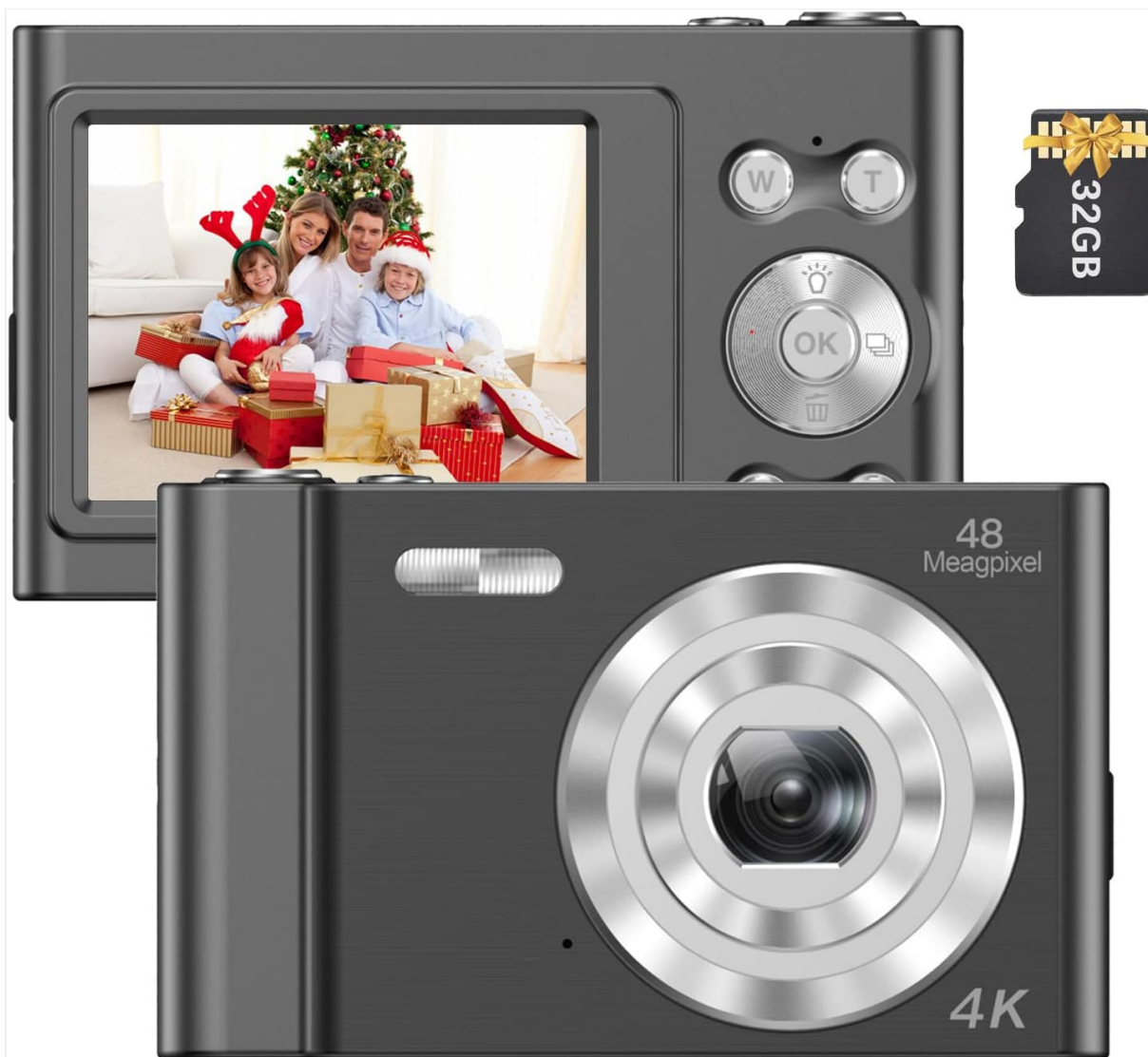
Image: The Andoer 4K Digital Camera, shown with its 2.4-inch IPS screen displaying a family scene and a 32GB memory card.