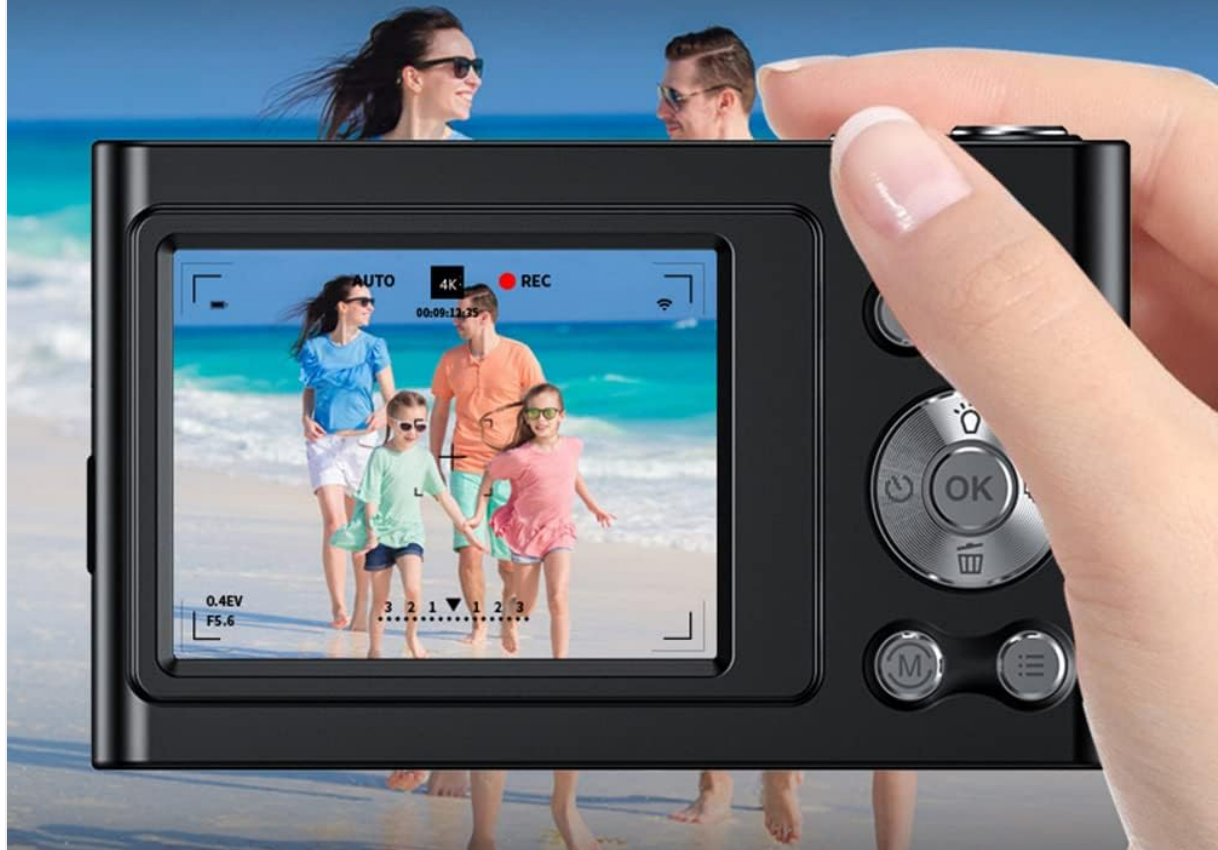
Image: A hand holding the Andoer camera, displaying a family on a beach on its screen, illustrating its use for capturing memories.

The 4K HD video camera records every interesting thing and shoots your VOG