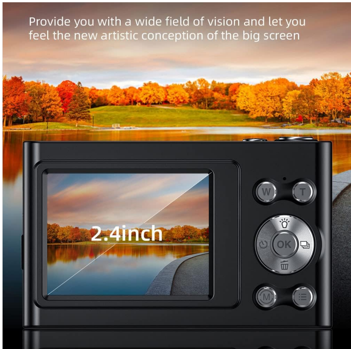
Image: The camera's 2.4-inch IPS screen displaying a vibrant landscape, illustrating the screen size and display quality.