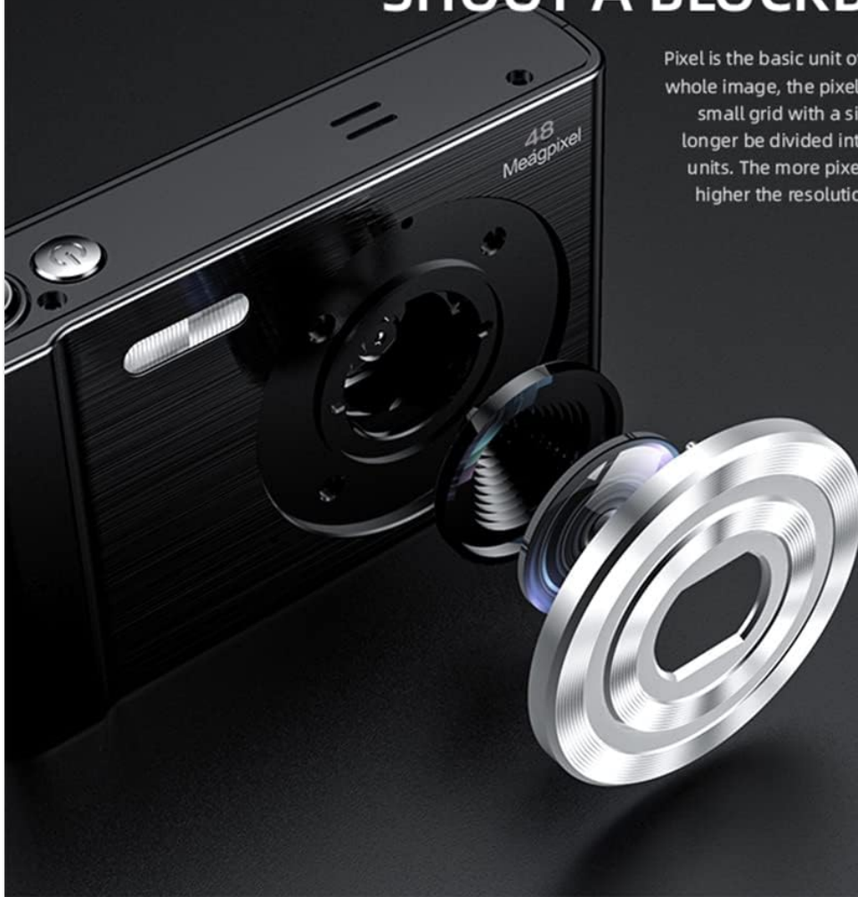
Image: A detailed view of the camera's front, highlighting the lens and the '48 Megapixel' marking, indicating its high-resolution capability.

Pixel is the basic unit of image display. In the whole image, the pixel can be regarded as a small grid with a single color and can no longer be divided into smaller elements or units. The more pixels in the unit area, the higher the resolution, and the clearer the displayed image