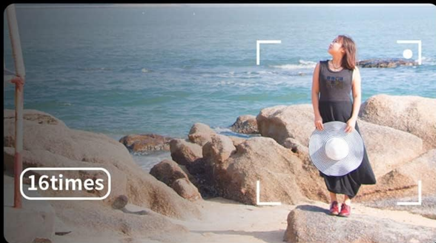
Image: A visual comparison showing the effect of 1x zoom versus 16x digital zoom, demonstrating the camera's magnification capability.